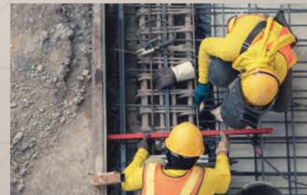
ADVANCED CONSTRUCTION TECHNOLOGY