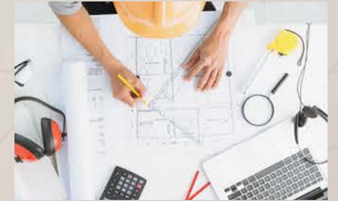
INDUSTRY RENOWNED CONSULTANTS