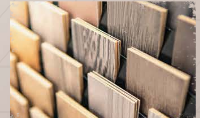
VENEER FINISH DOORS & SYSTEM WINDOWS