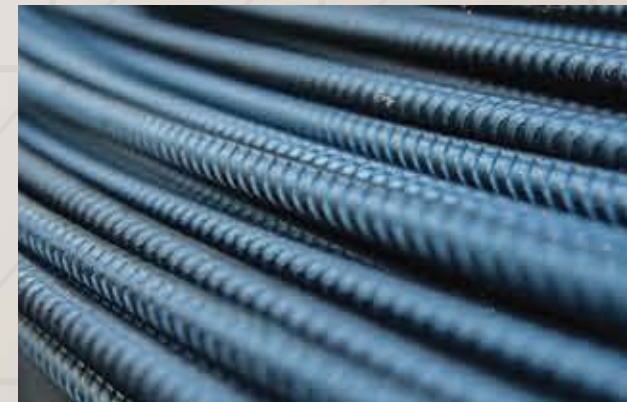
HIGH QUALITY STEEL