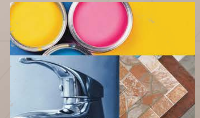
BEST IN CLASS FINISHES, MATERIALS & FITTINGS.