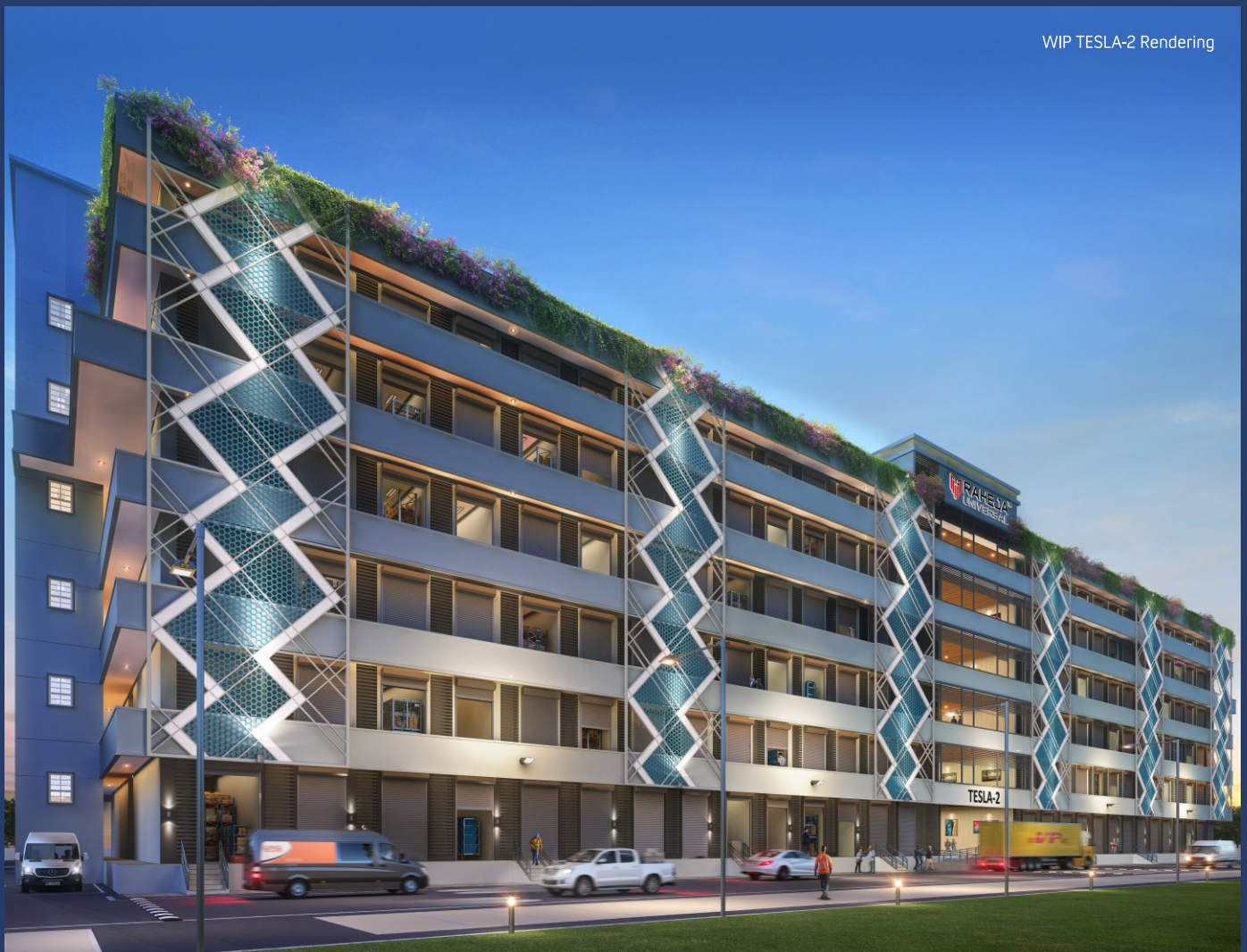
WIP TESLA-2 Rendering

Unit sizes ranging from 521 sq.ft - 833 sq.ft