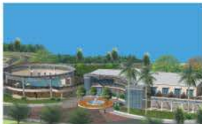
Bungalows & Villas