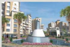
The Water Cascade