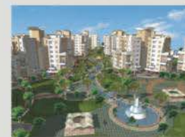
The Central Water Stream