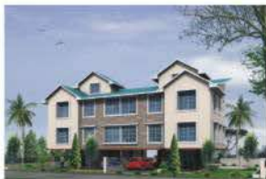
3 BRHK elevated Twin Bungalows