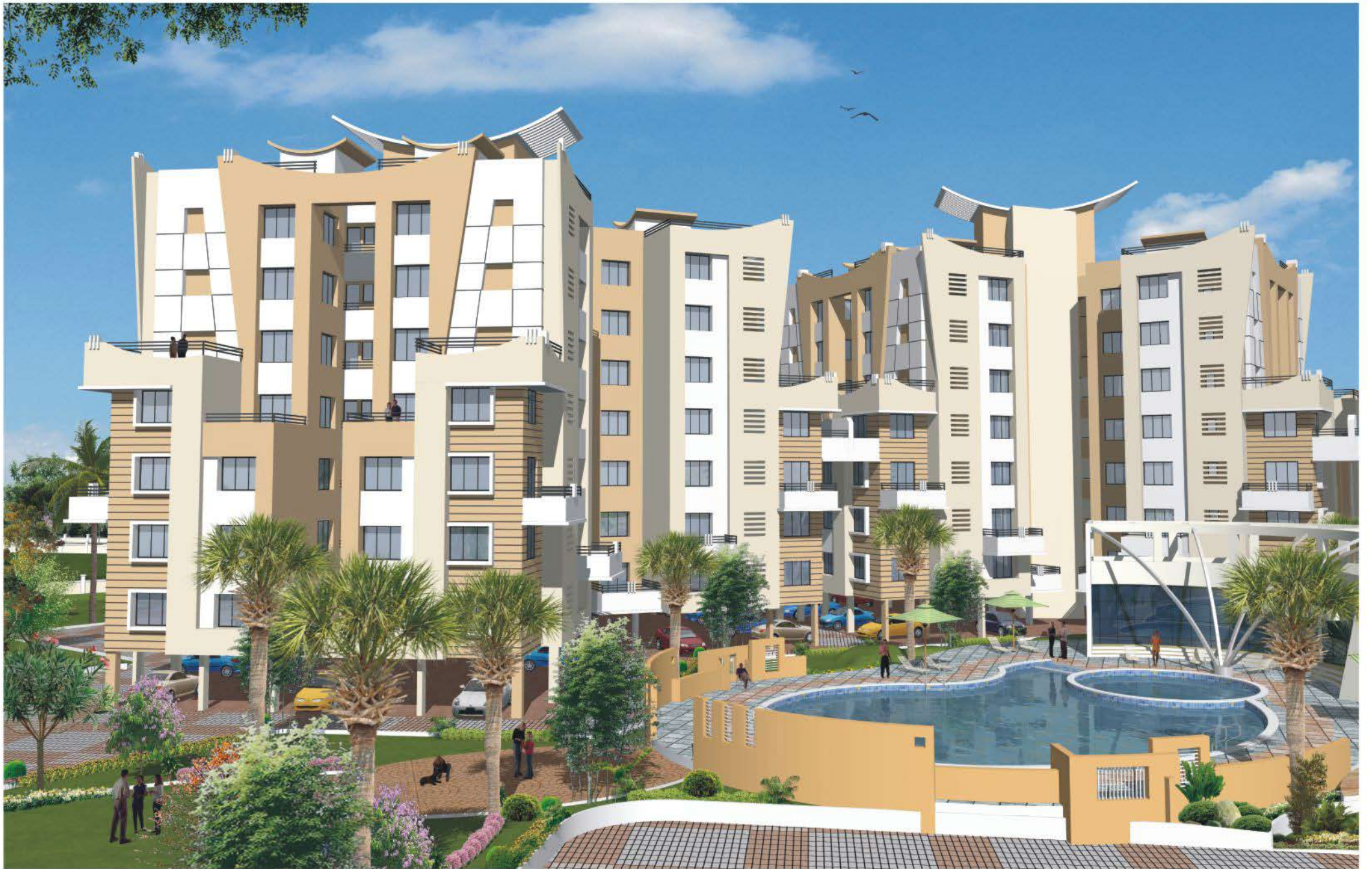
Proposed building elevation