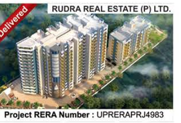
RUDRA BIDDHA ENCLAVE Ashapur, Varanasi