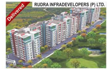
RUDRA GREENS Singhpur, Kanpur