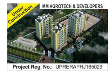
RUDRA GARDEN CITY (Phase-2) Near Rema Modh, P. Deendayal Upadhyay Nagar