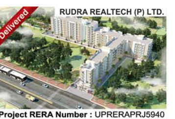
RUDRA GANGES Parao, Dandi, Varanasi