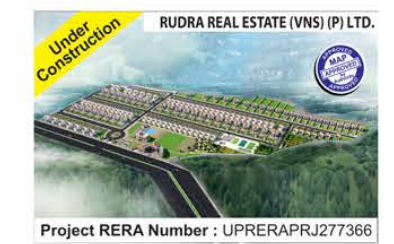
RUDRA DREAM COTTAGE Near Durga Mandir, Chunar