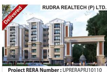
RUDRA MUKUND VILLAS Nati Imli, Varanasi