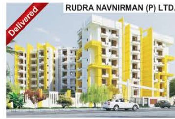
RUDRA ENCLAVE Dhanua, Rewa Road, Prayagraj