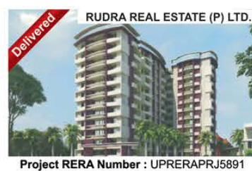
RUDRA BANKE BIHARI RESIDENCY Bhaktinagar, Pandeypur, Varanasi