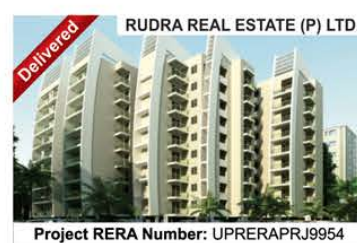
RUDRA LAXMIKUNJ Paharia, Varanasi