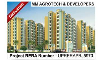
RUDRA GARDEN CITY (Phase-1) Near Rema Modh, P. Deendayal Upadhyay Nagar