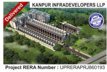
RUDRA SHUBHKAMNA G.T. Road, Amiliha, Kanpur