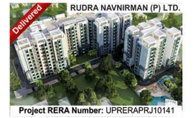
RUDRA NAVNIRMAN Naini, Prayagraj