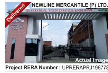
RUDRA VINDHYA DHAM Bathua Chauraha, Near Sitla Mata Mandir, Mirzapur