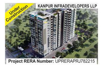
RUDRA SOLITAIRE Near G.D. Goenka School, Mainawati Marg, Azad Nagar, Kanpur