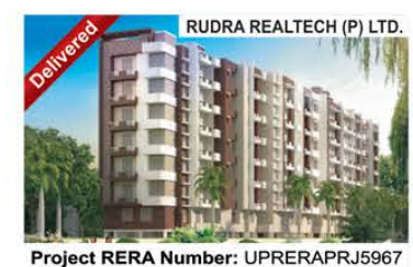
RUDRA ROYAL Chandpur, Varanasi