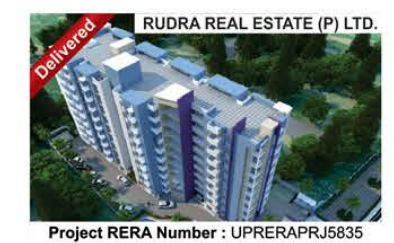
RUDRA AWADH RESIDENCY Shivpur, Varanasi