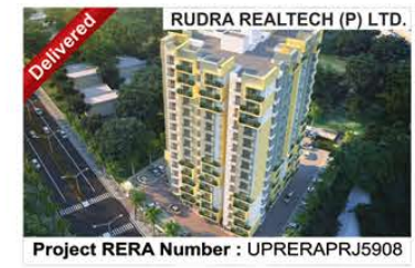
RUDRA AISHWARYAM Shivpur, Varanasi