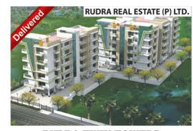
RUDRA TWIN TOWERS New Berry Road, Lucknow