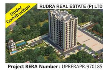
RUDRA SAUBHAGYAM (Phase-1) Harahua (Airport Road)-Rameshwaram Road, Varanasi