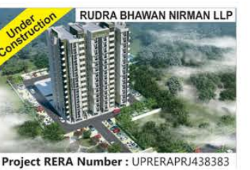
RUDRA AADHARSHILA (Phase-1) Rohaniya, Gangapur Road, Varanasi