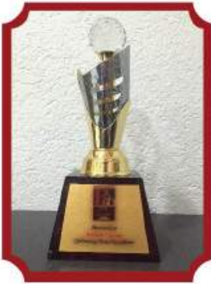
BRAND EXCELLENCE AWARD REAL ESTATE