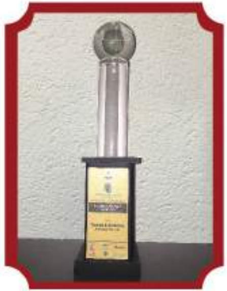
RESIDENTIAL PROPERTY OF THE YEAR - REAL ESTATE