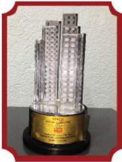
RESIDENTIAL PROPERTY OF THE YEAR - REAL ESTATE