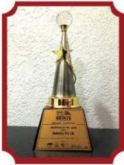
DEVELOPER OF THE YEAR LUXURY REAL ESTATE