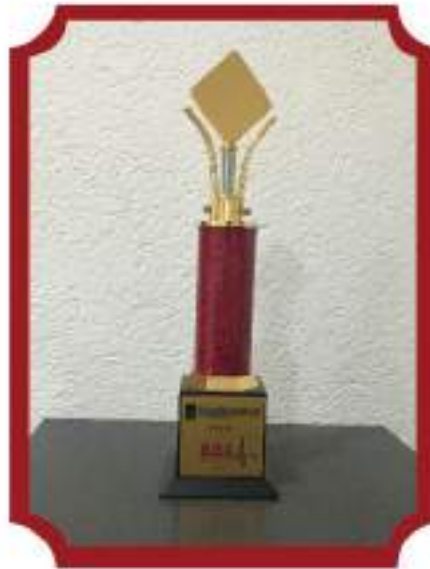
NATIONAL HEALTH AWARDS REAL ESTATE