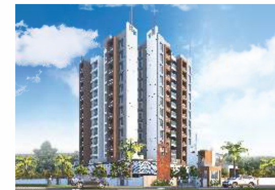
TIRUPATI REGALIA Phase 1 Vishrantwadi, Pune