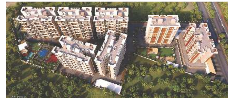
SAI TIRUPATI GREENS Charholi