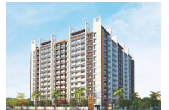
TIRUPATI REGALIA Phase 2 Vishrantwadi, Pune