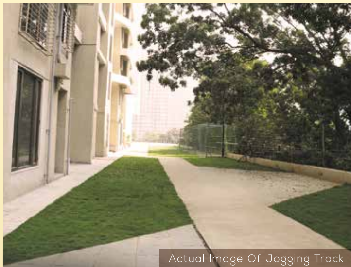
Actual Image Of Jogging Track