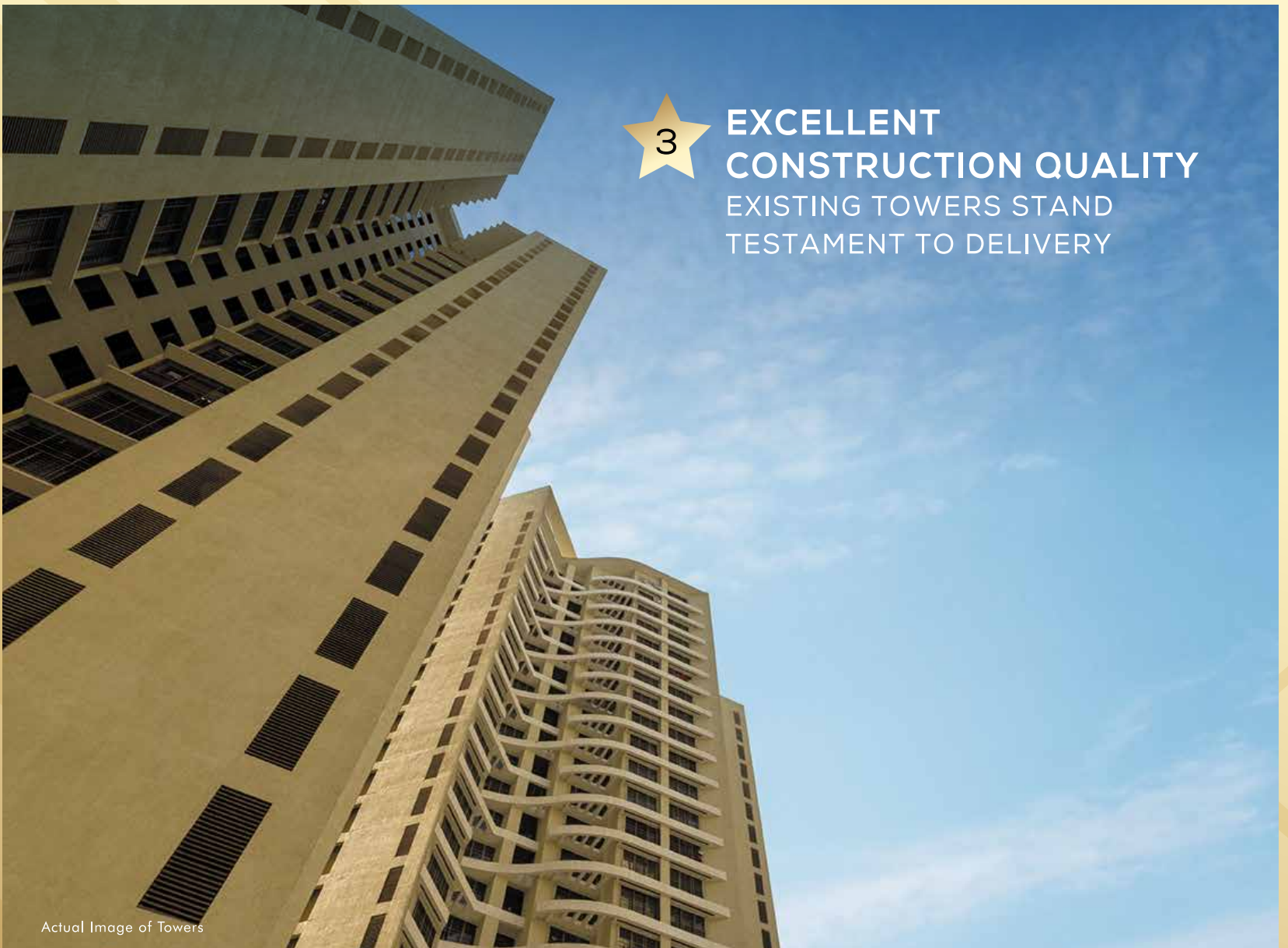
Actual Image of Towers