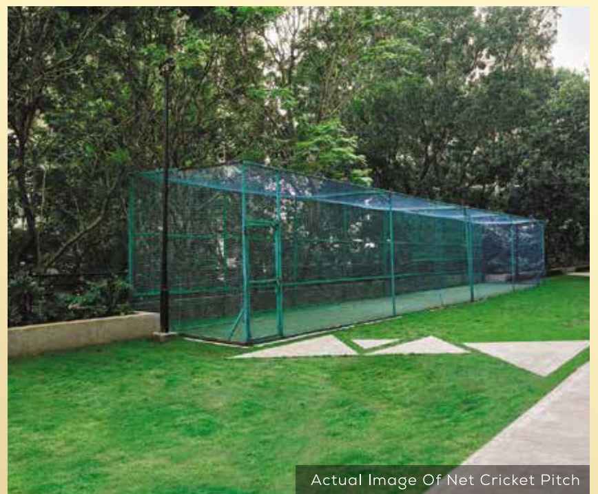
Actual Image Of Net Cricket Pitch