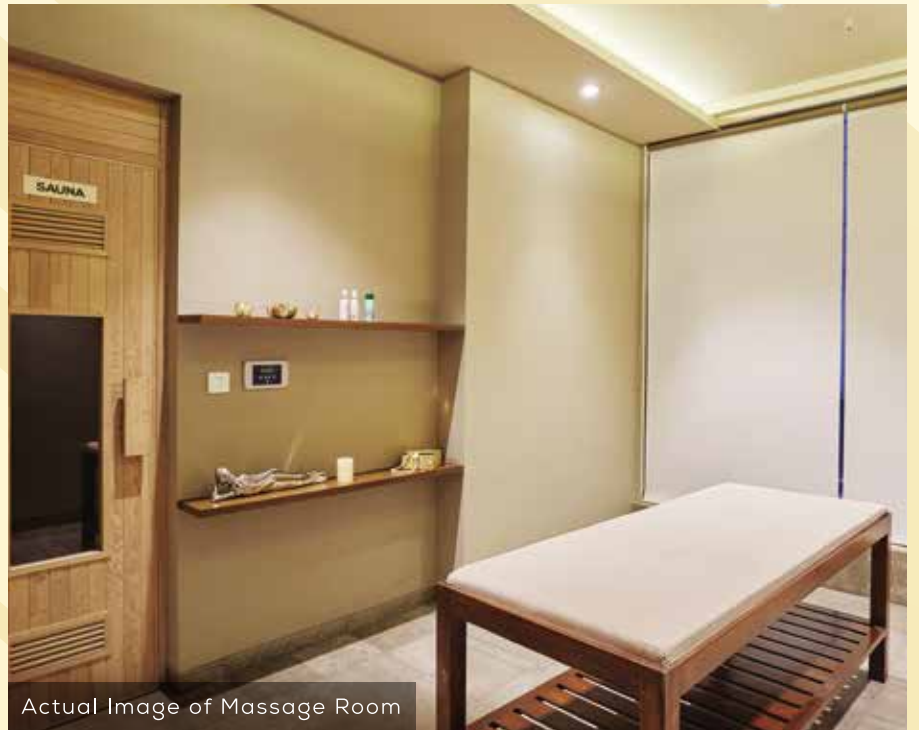
Actual Image of Massage Room