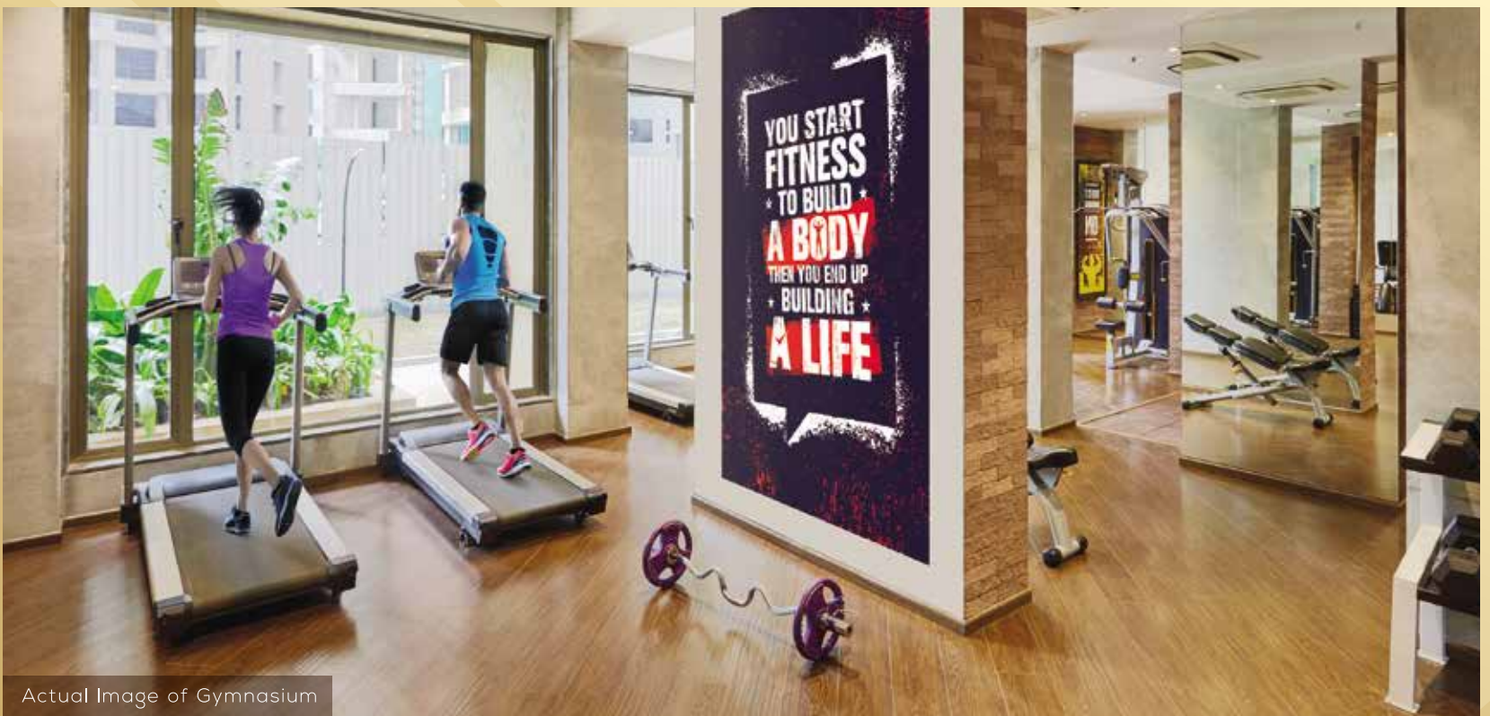
Actual Image of Gymnasium