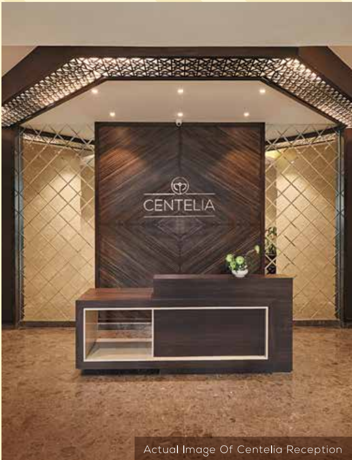
Actual Image Of Centelia Reception