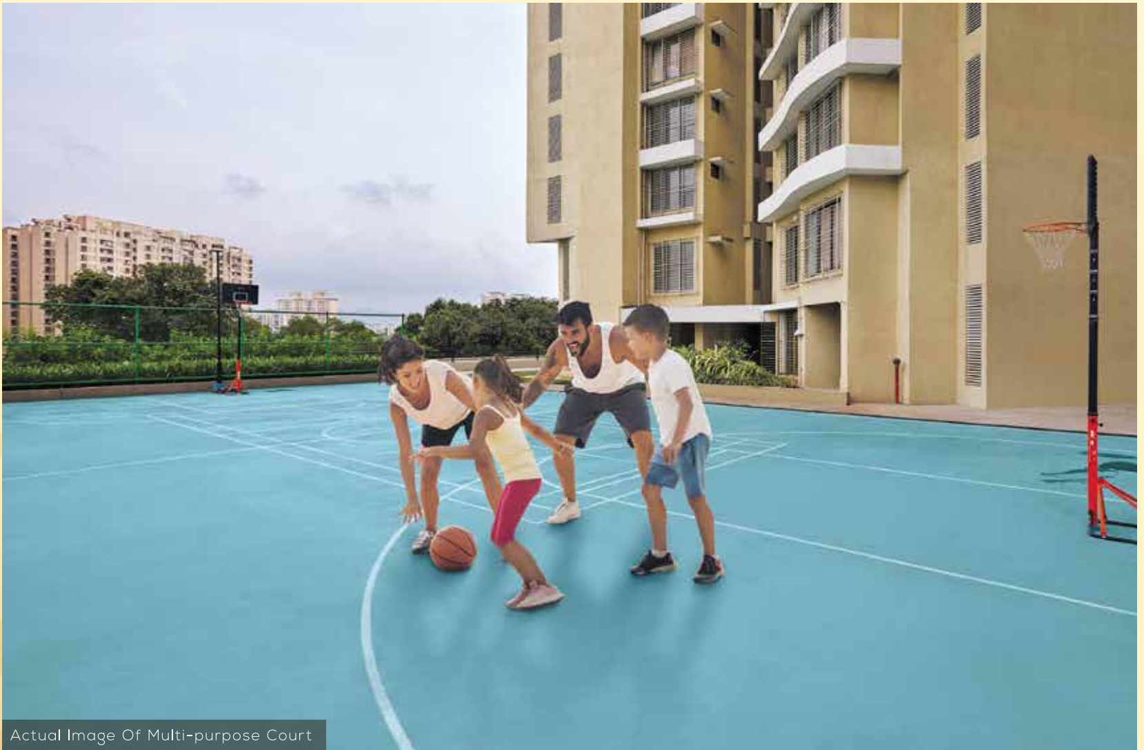
Actual Image Of Multi-purpose Court