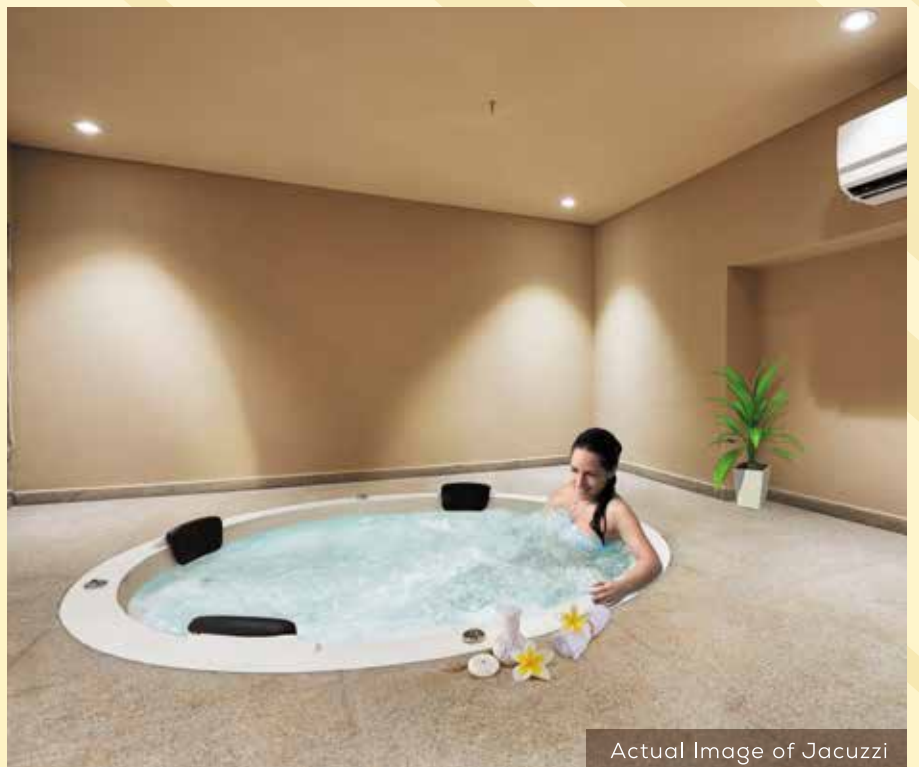
Actual Image of Jacuzzi