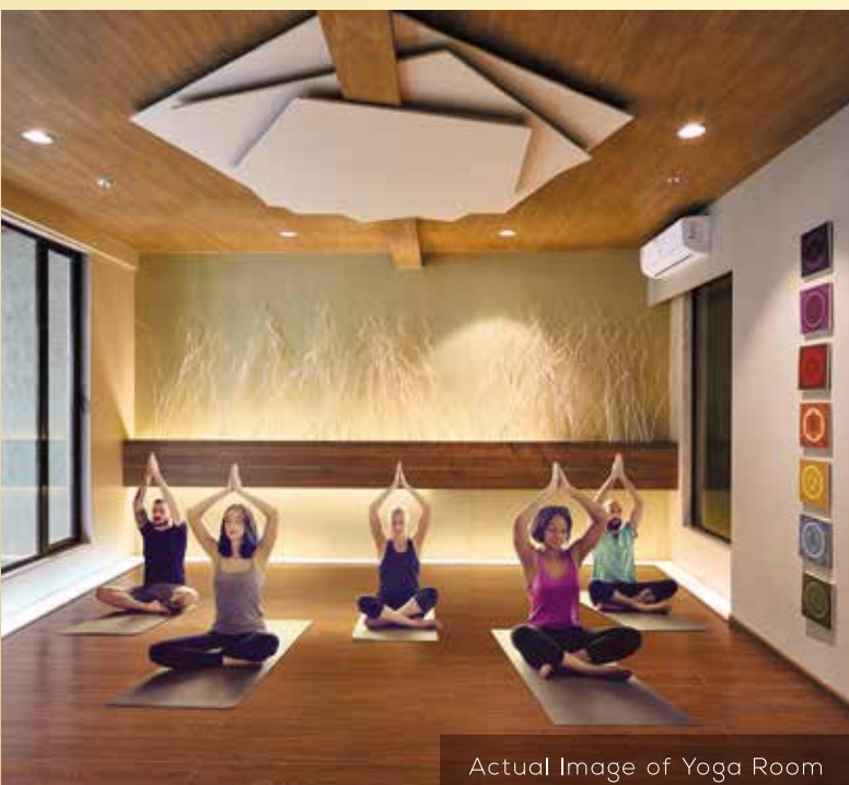
Actual Image of Yoga Room