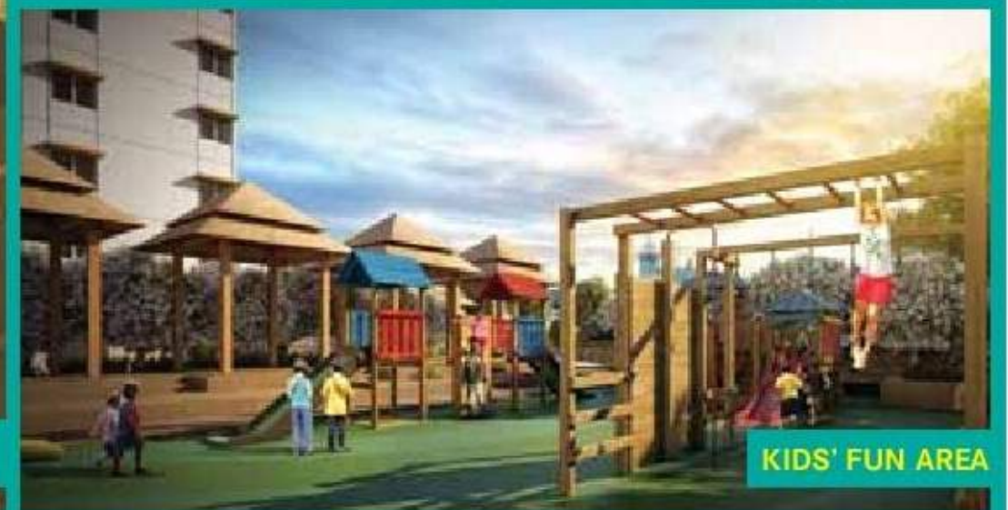
KIDS' FUN AREA