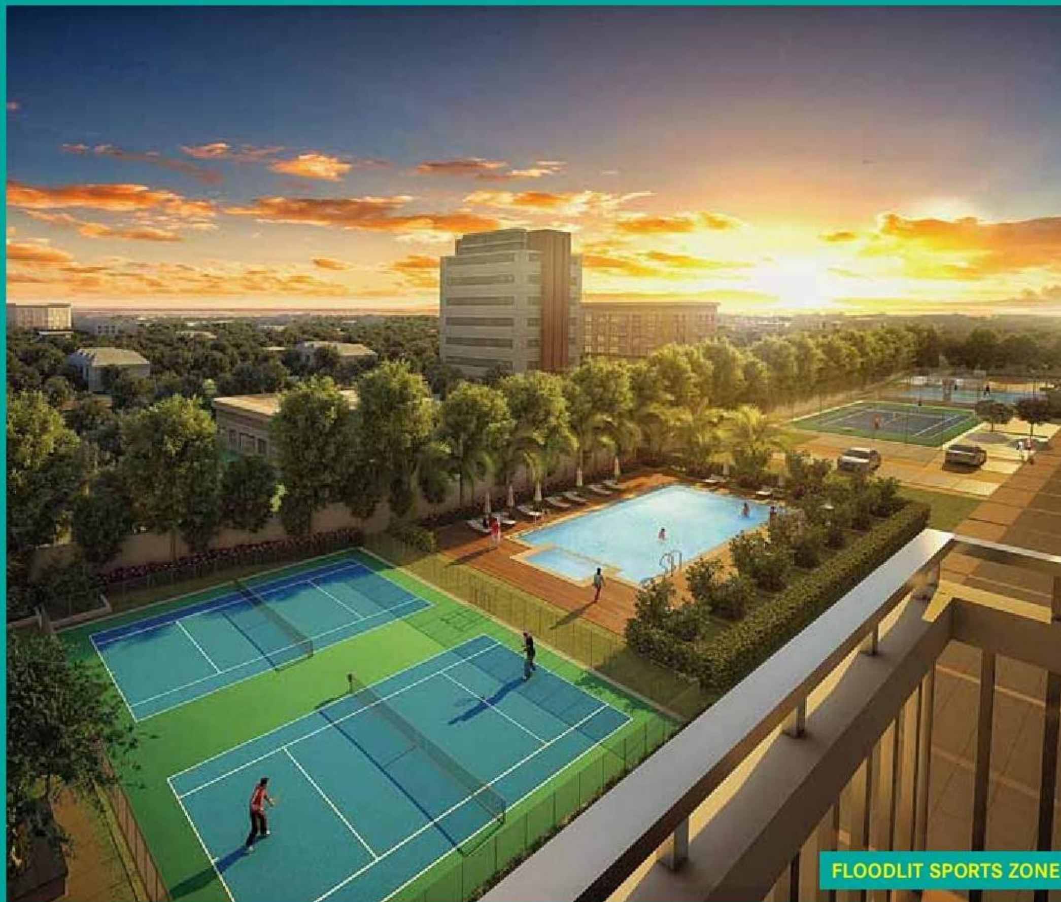
FLOODLIT SPORTS ZONE