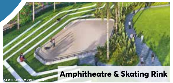
Amphitheatre & Skating Rink