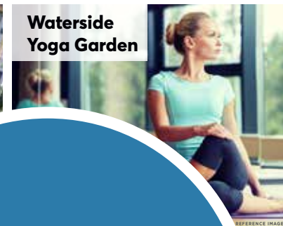
Waterside Yoga Garden