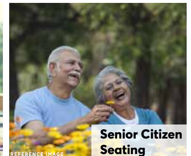
Senior Citizen Seating