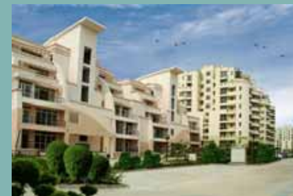
Eldeco Sylvan View Sec.93A, Expressway, Noida