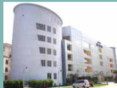
Eldeco Studio Sec. 93A, Expressway, Noida