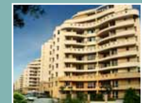
Eldeco Utopia*, Expressway, Noida