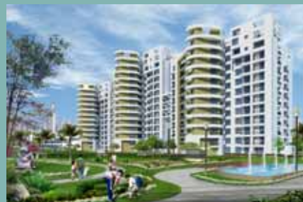
Eldeco Amantran Sec. 119, Noida