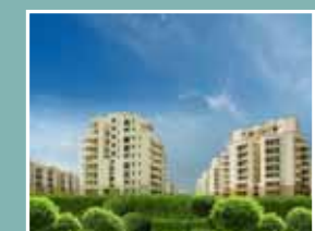
Eldeco Utopia*, Expressway, Noida