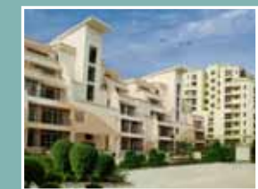
Eldeco Utopia*, Expressway, Noida