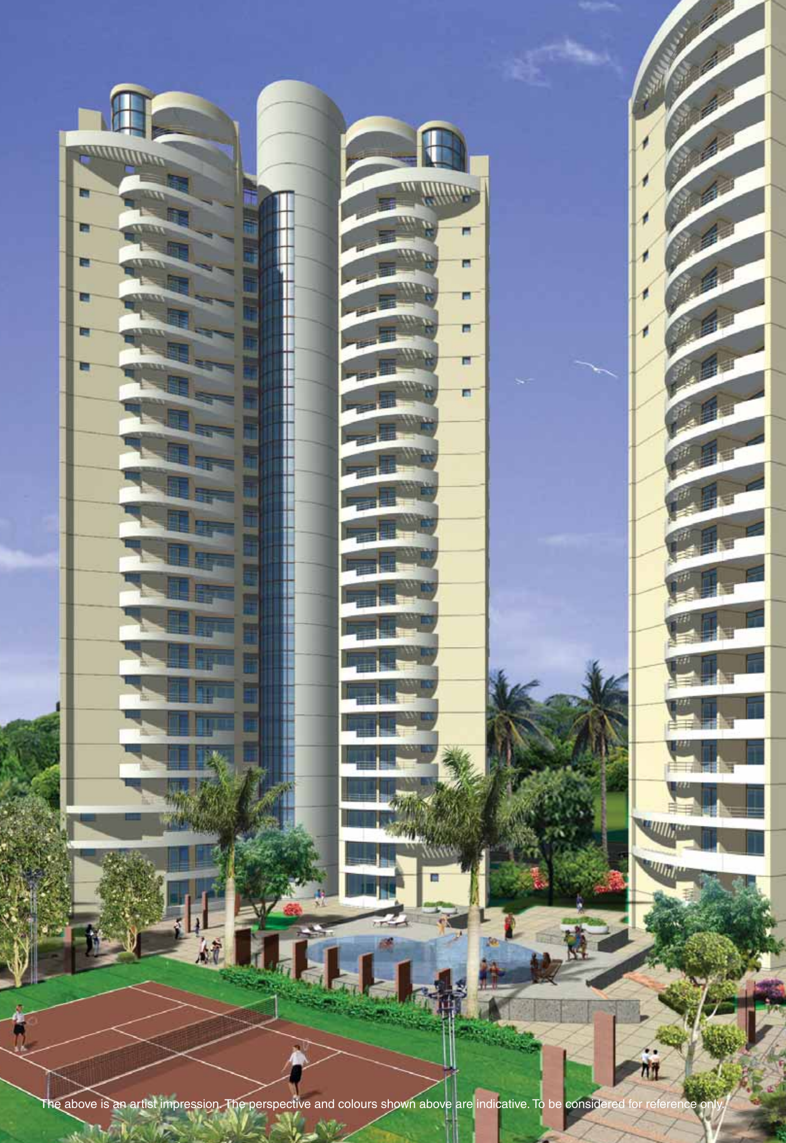
The above is an artist impression. The perspective and colours shown above are indicative. To be considered for reference only.