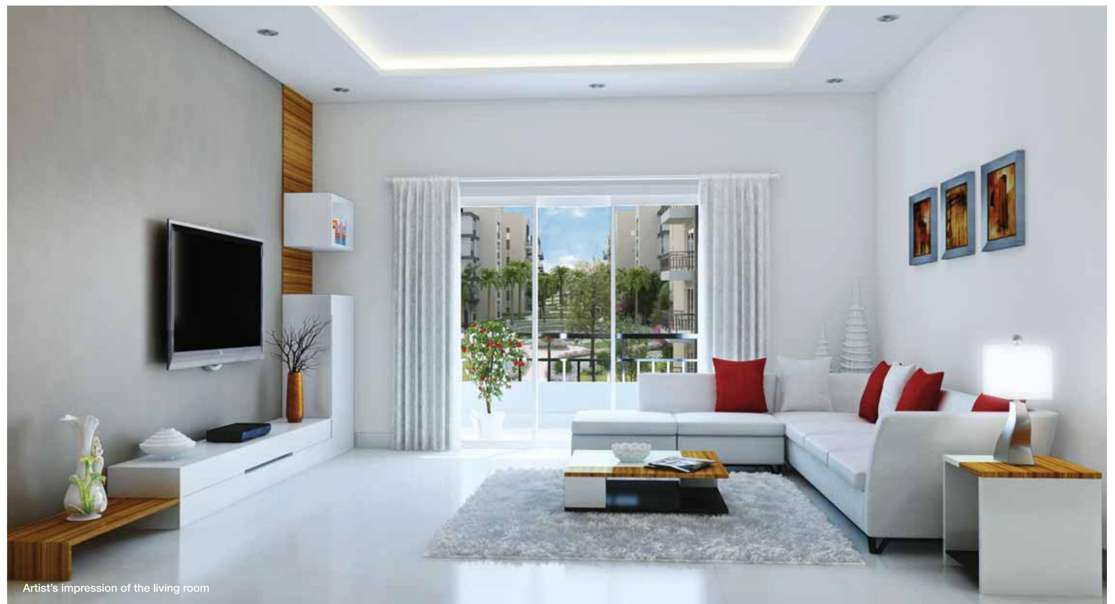
Artist's impression of the living room