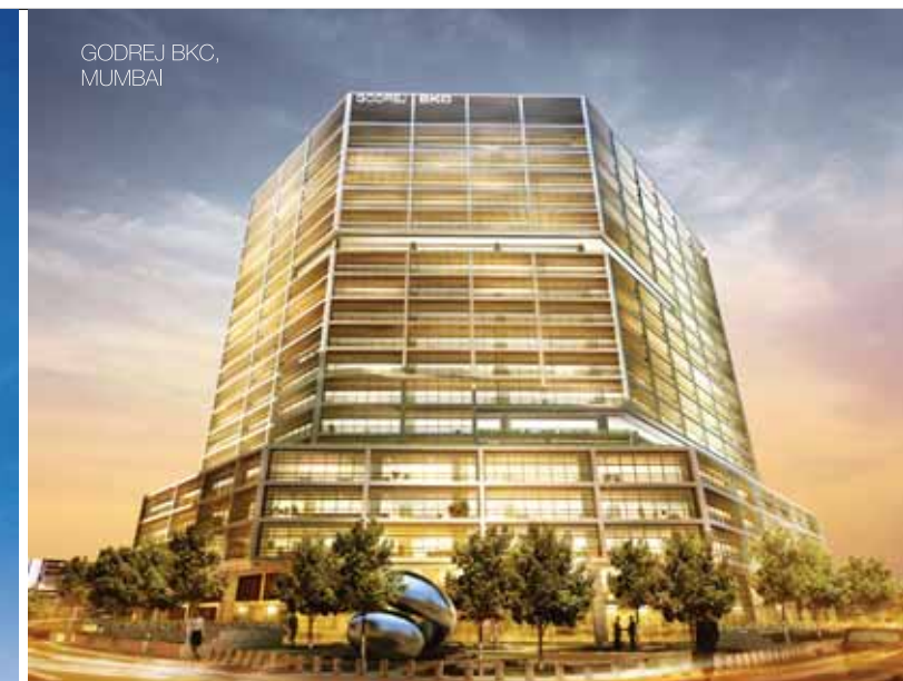
GODREJ BKC, MUMBAI