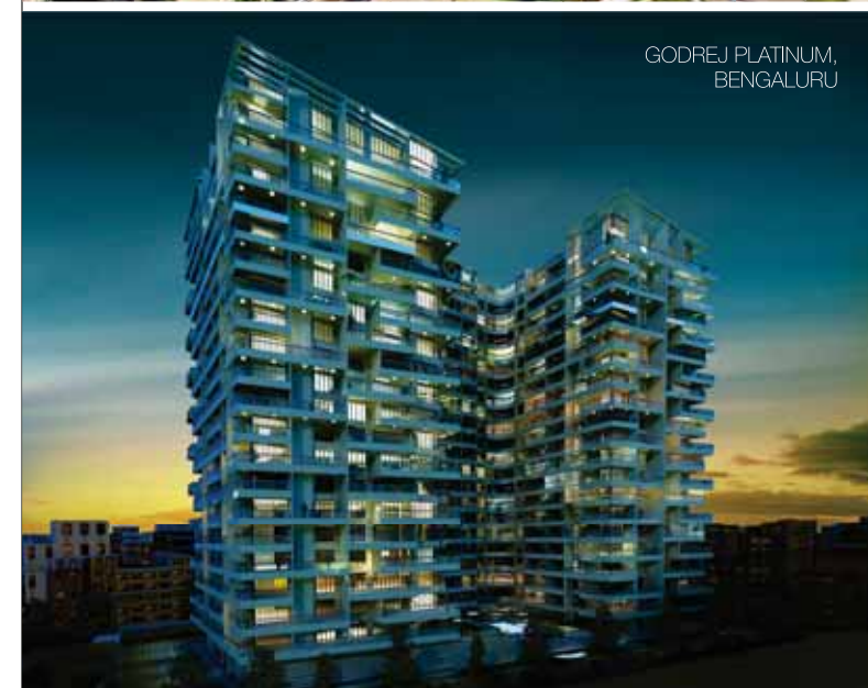
GODREJ PLATINUM, BENGALURU