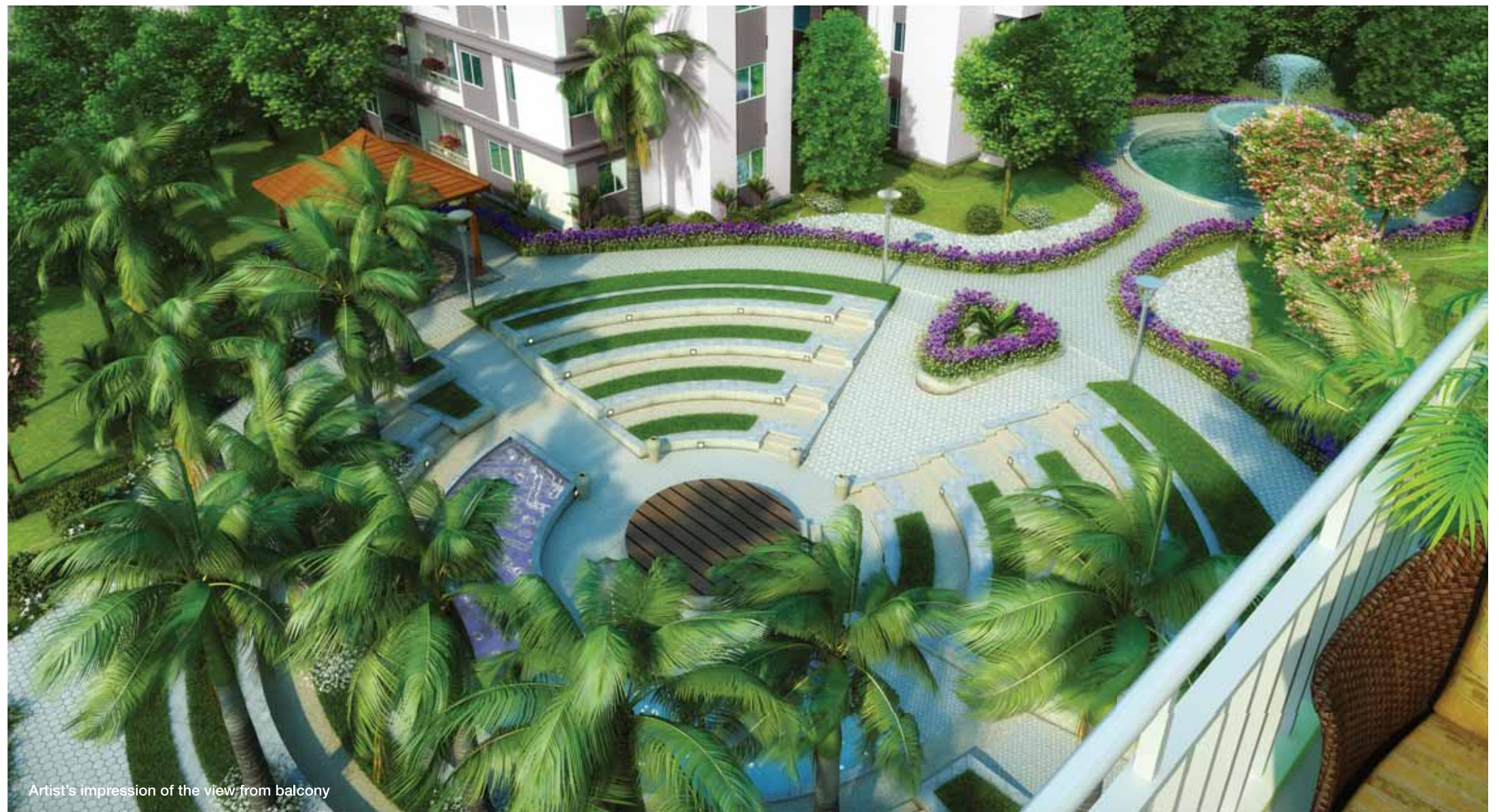
Artist's impression of the view from balcony