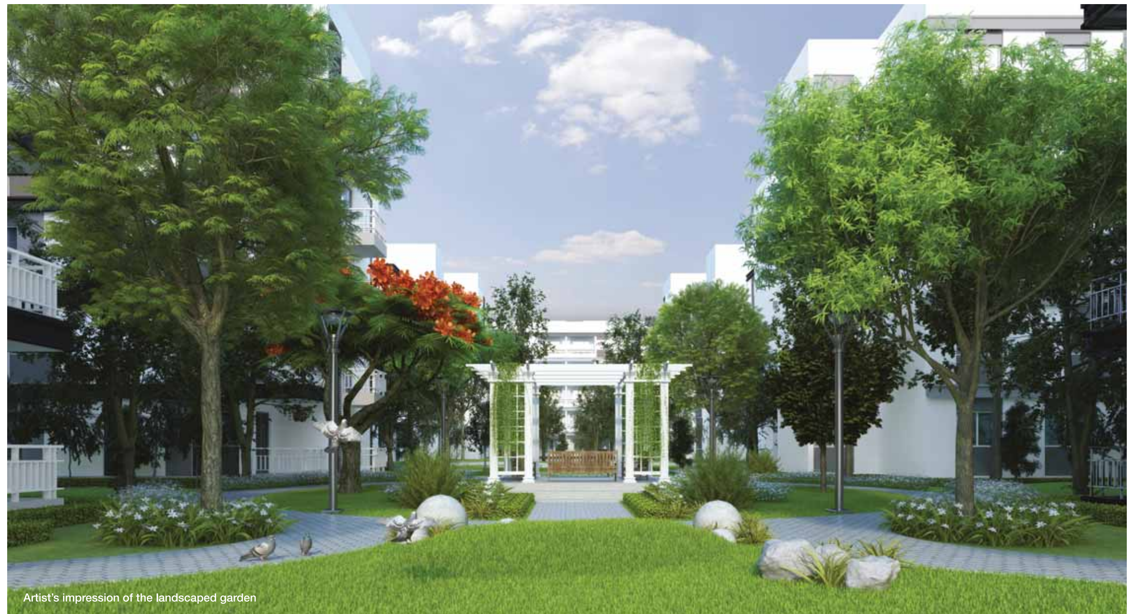
Artist's impression of the landscaped garden