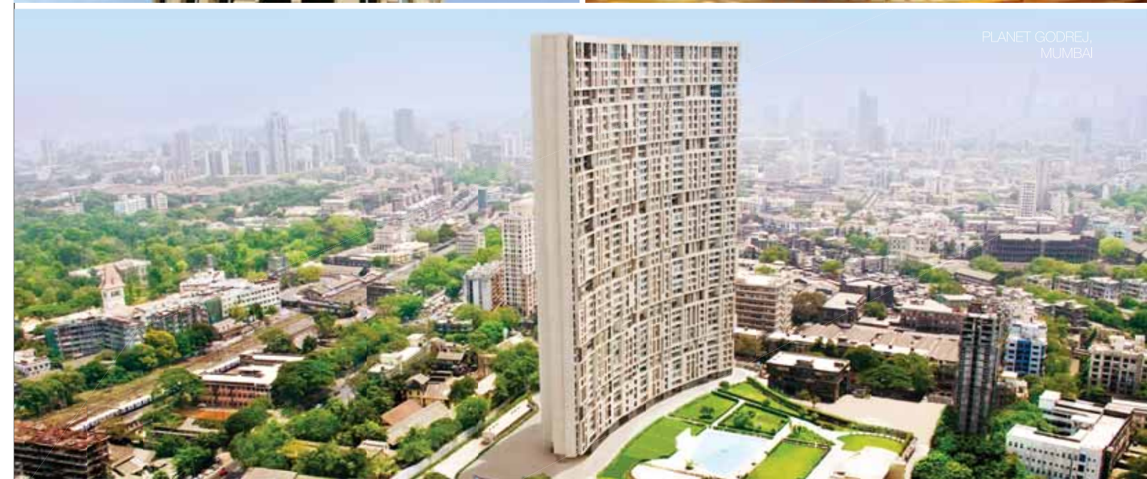
PLANET GODREJ, MUMBAI