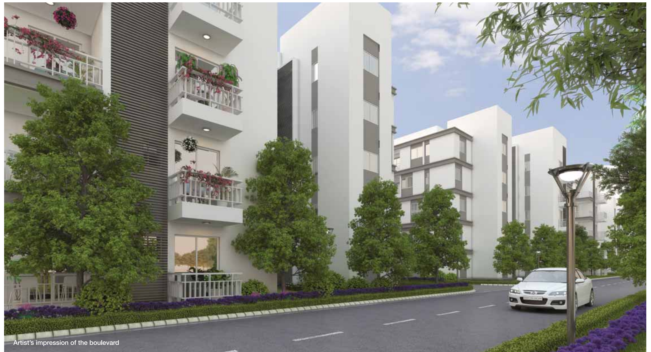
Artist's impression of the boulevard