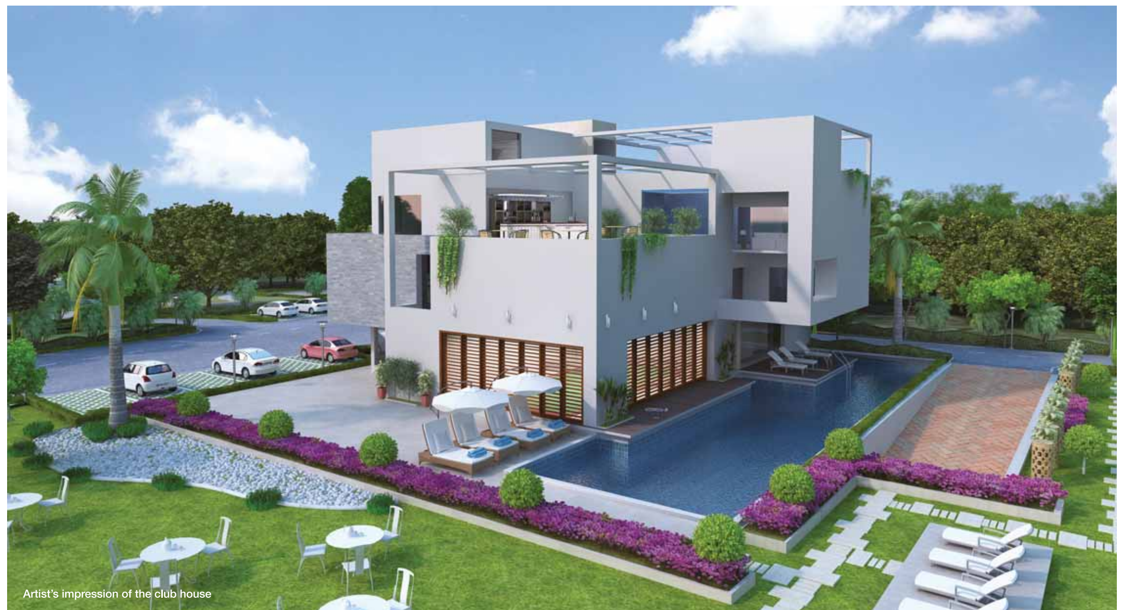
Artist's impression of the club house