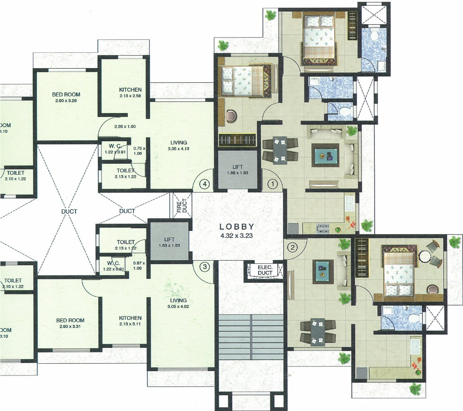
WING - B