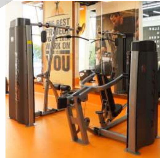
Fitness Masterclass with Gym Instructor