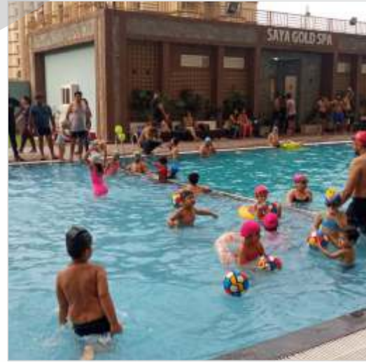
The Water Garden