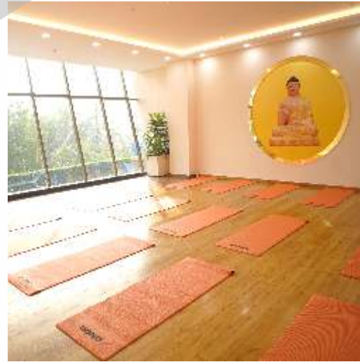
Wellness Marterclass with Yoga Instructor