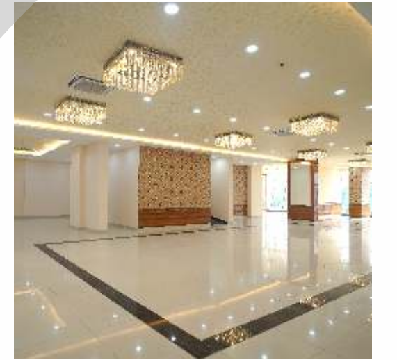
The Gold Ballroom PartyHall