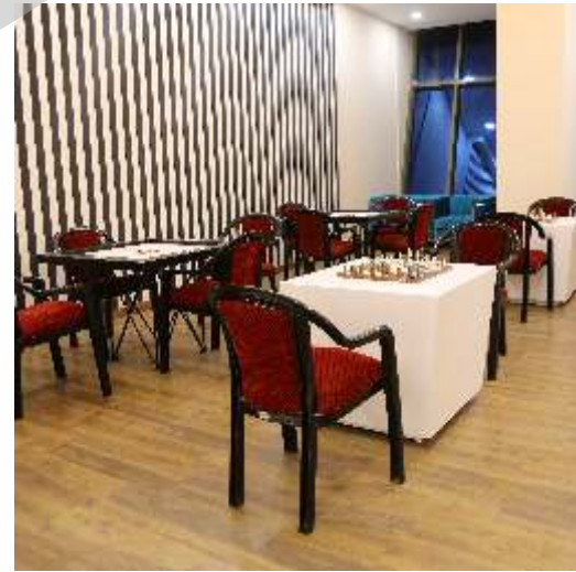
The Saya Gold Club