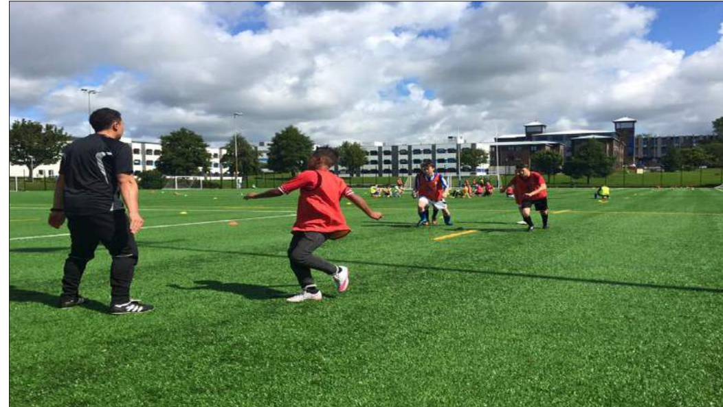
Proposed Play Ground