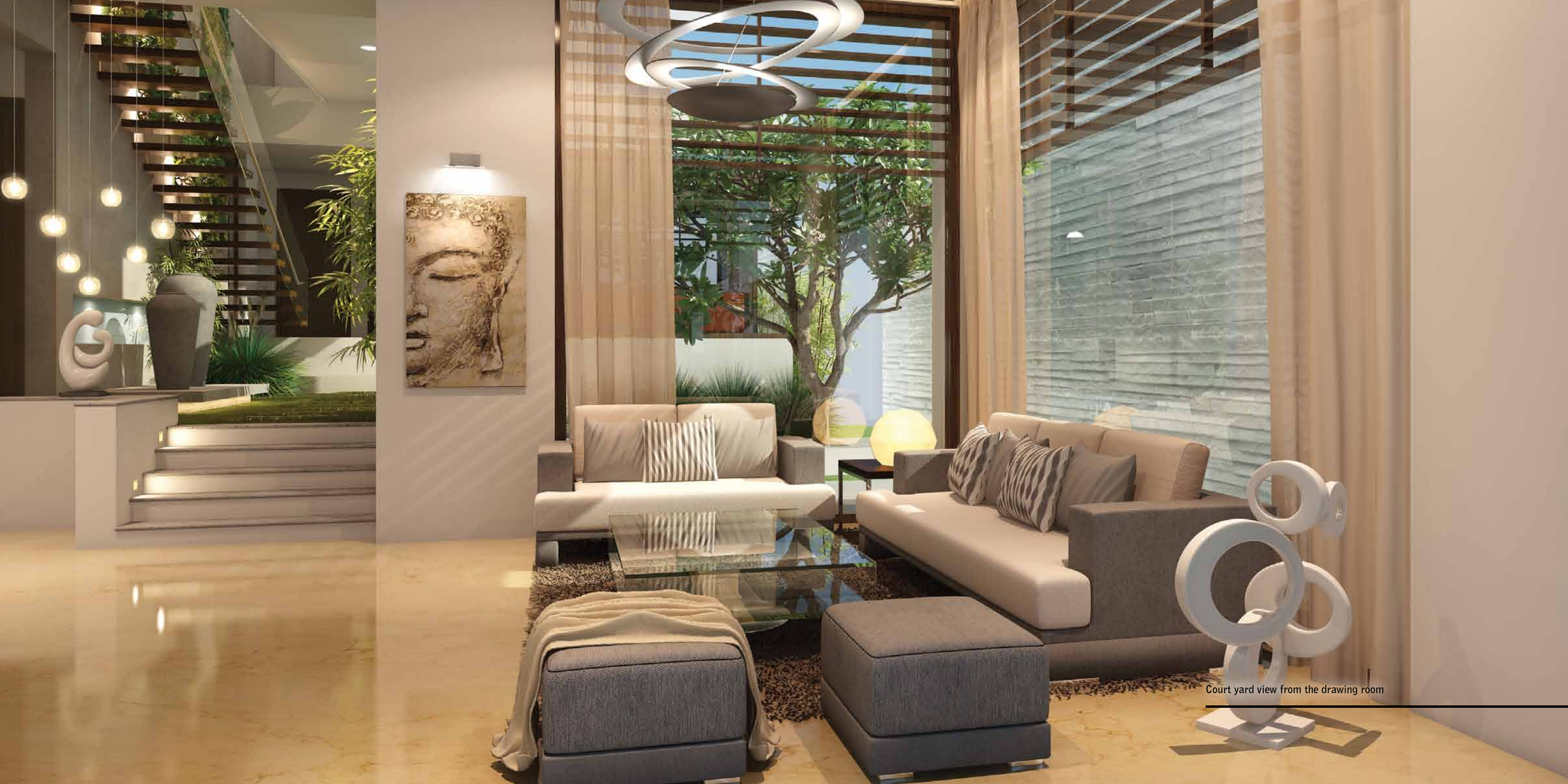
Court yard view from the drawing room