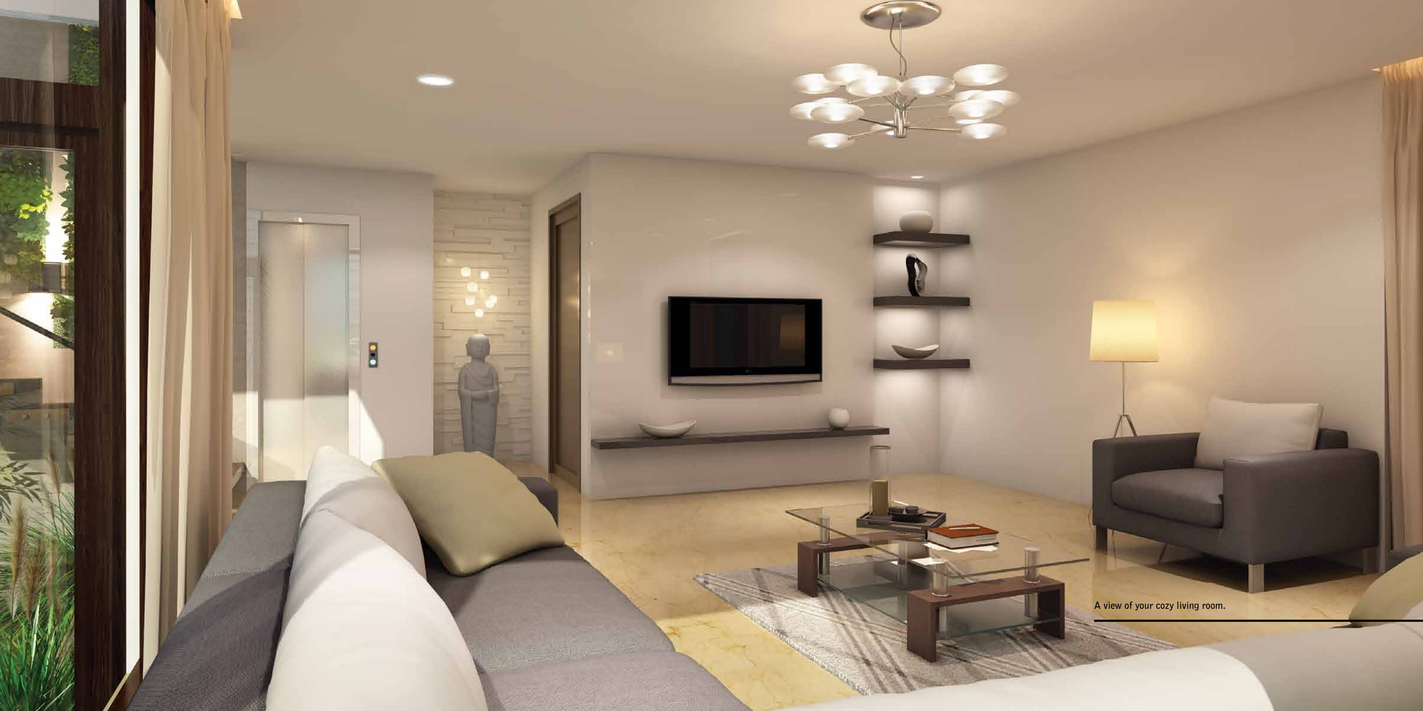
A view of your cozy living room.