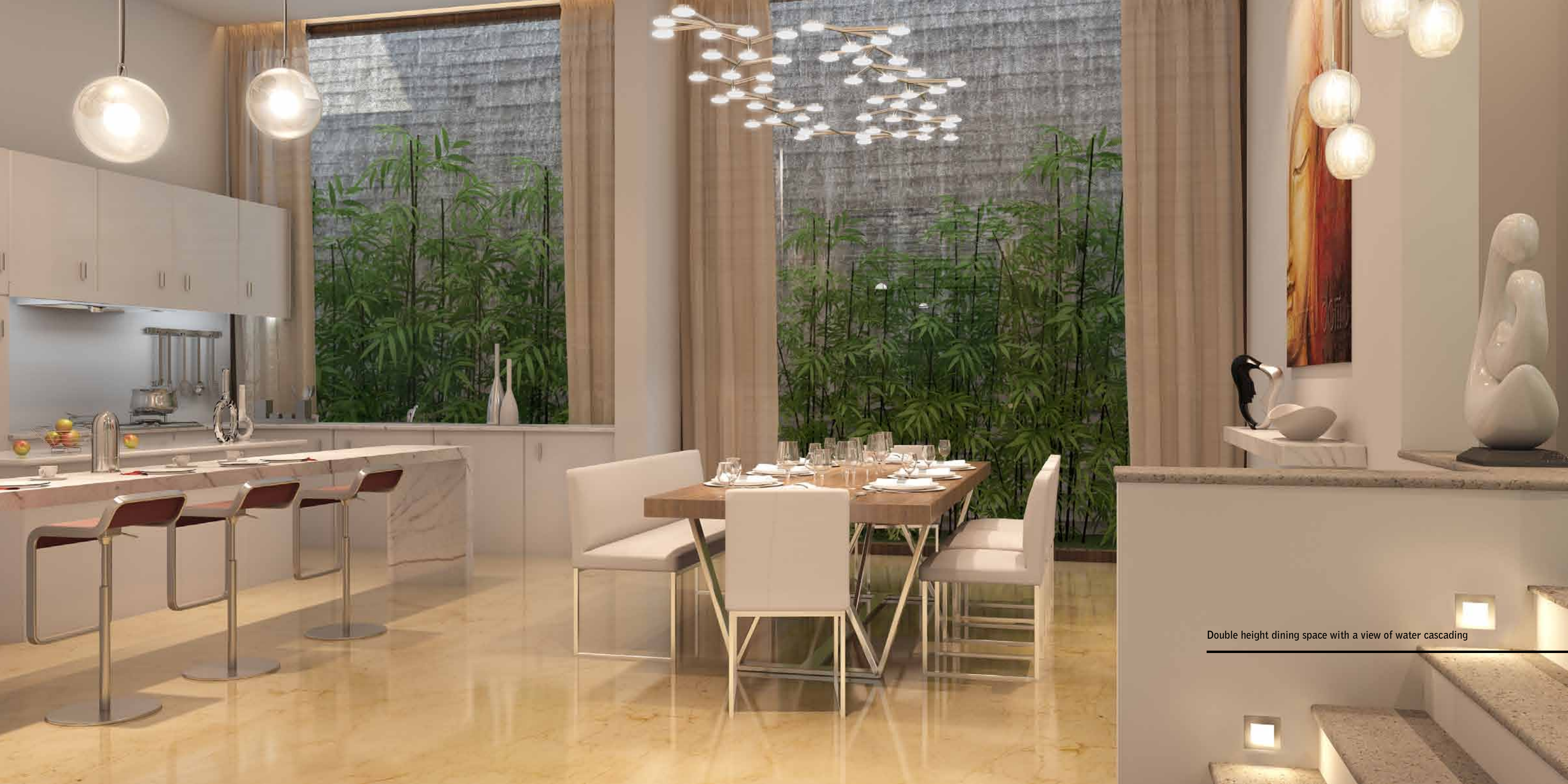
Double height dining space with a view of water cascading