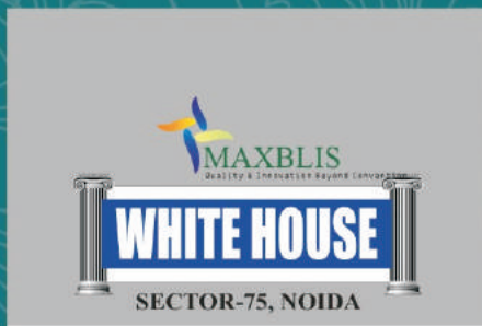
White House, Sector - 75, Noida