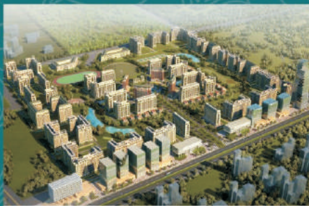
Golf City Sector - 75, Noida