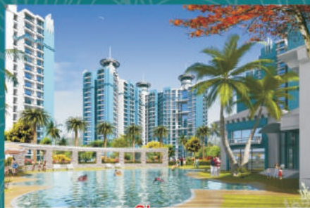
Glory Sector-46, Noida