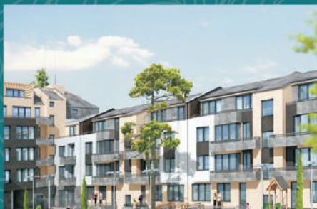
Aranya Vihar, Patna