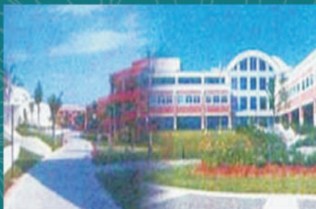
Hi-Tech City, Jaipur