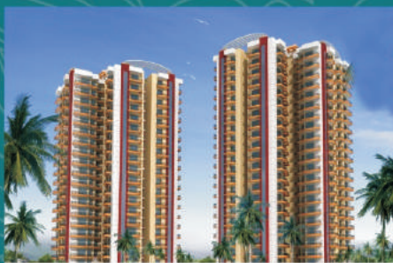
Grace Sector - 61, Noida