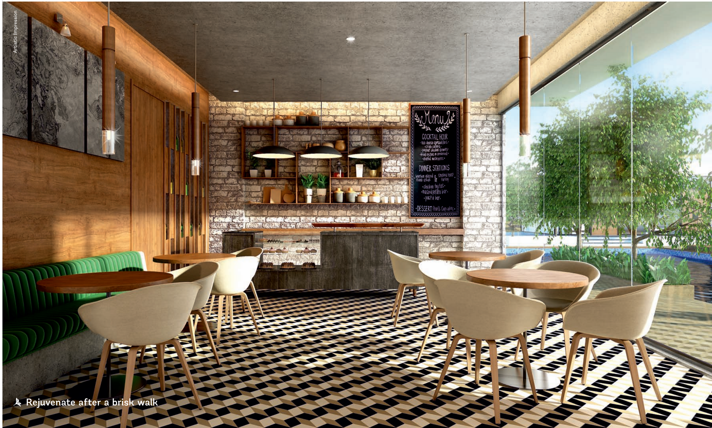
Rejuvenate after a brisk walk