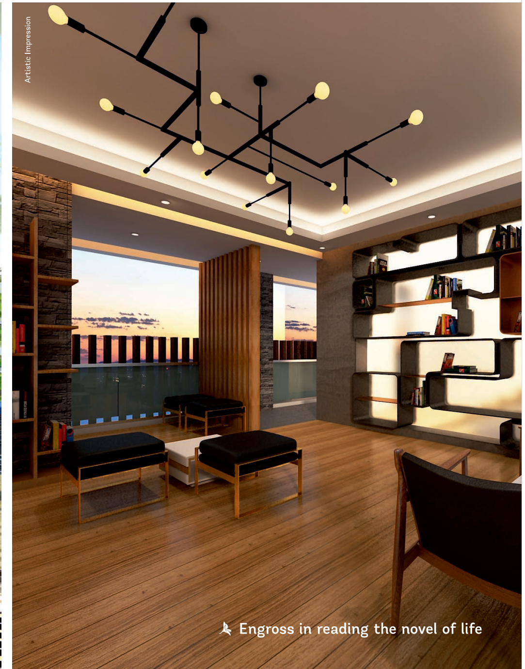
Engross in reading the novel of life