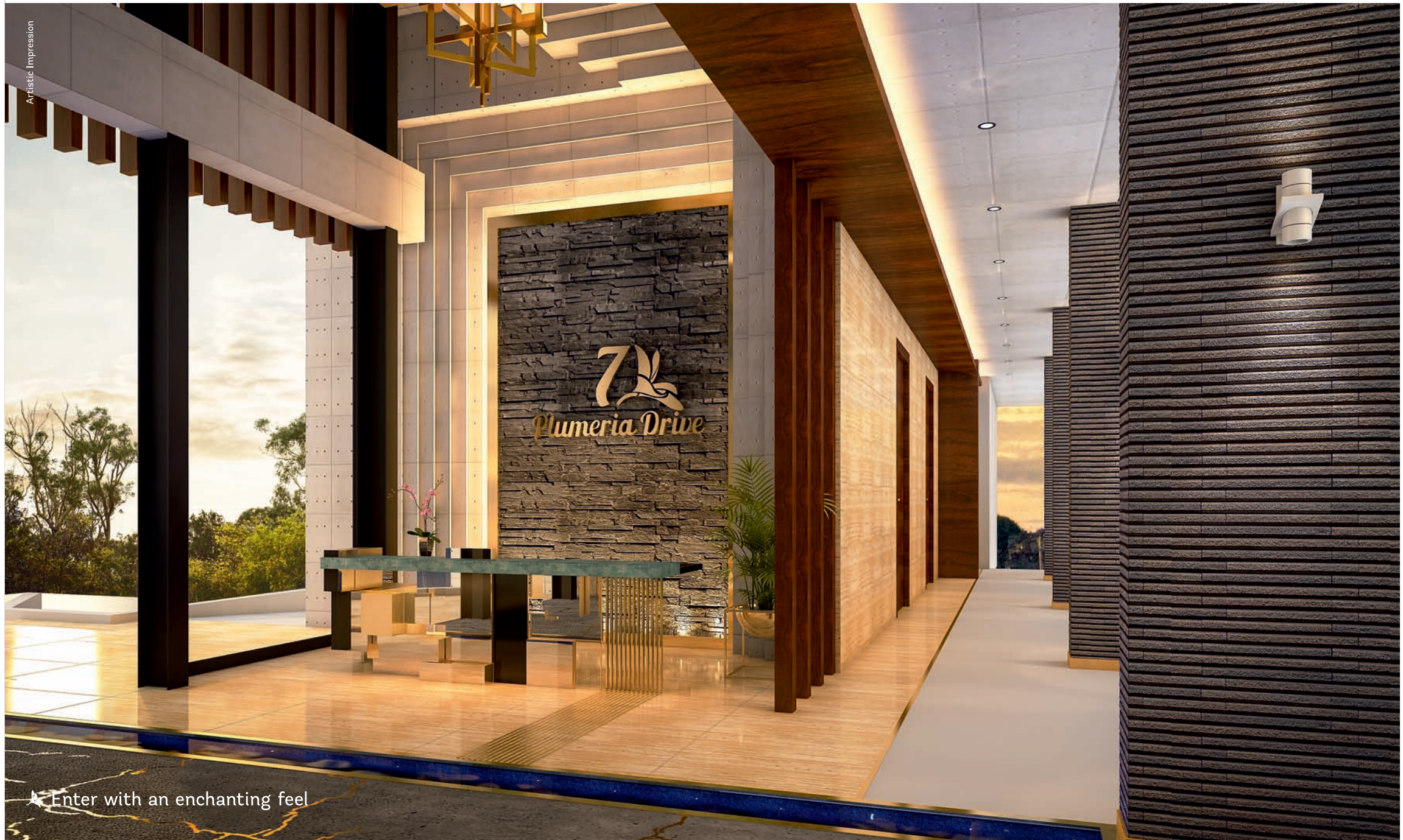
Artistic Impression Enter with an enchanting feel