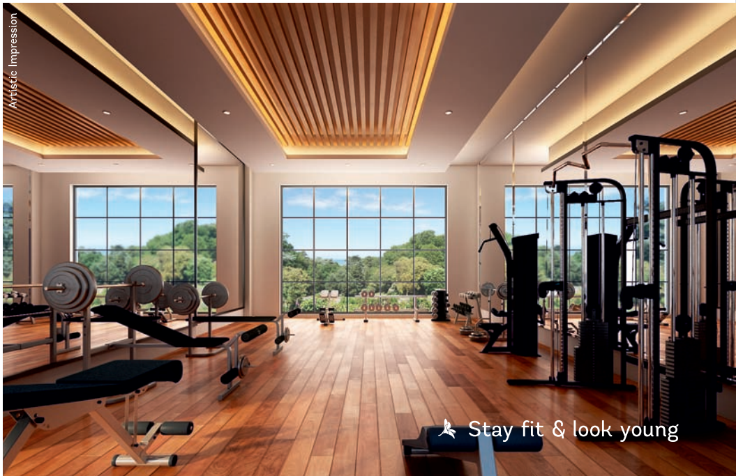
Artistic Impression Stay fit & look young