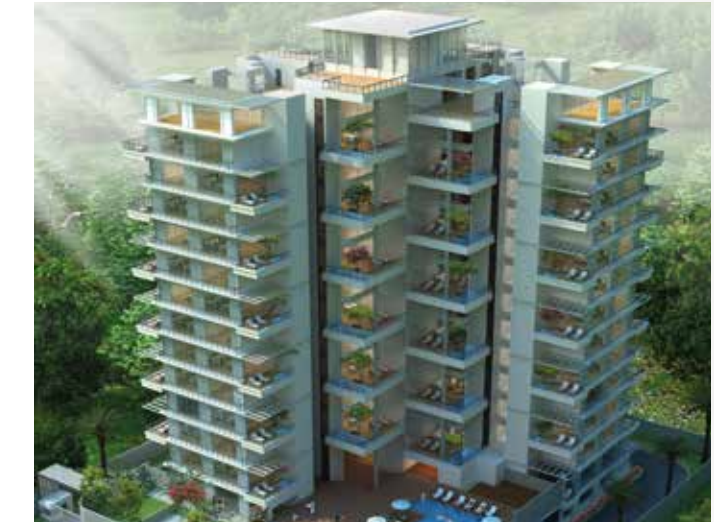
Ajmera Aria, Pune