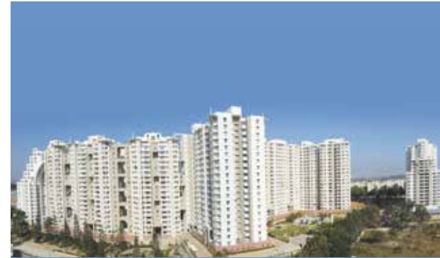
Ajmera Infinity, Electronics city