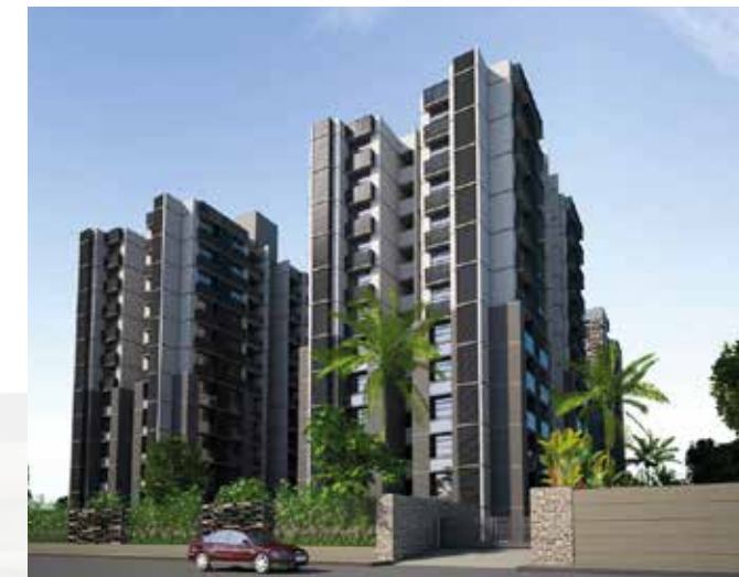
Ajmera Enigma, Ahmedabad