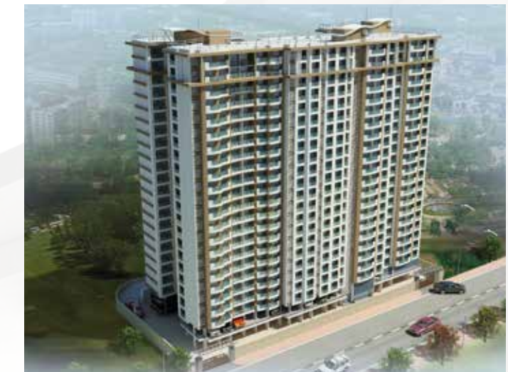
Ajmera Pristine, Mumbai