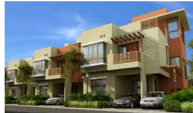
Ajmera Villows, Electronics city