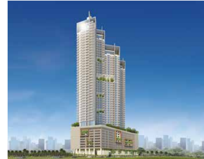
Ajmera Aeon, Mumbai