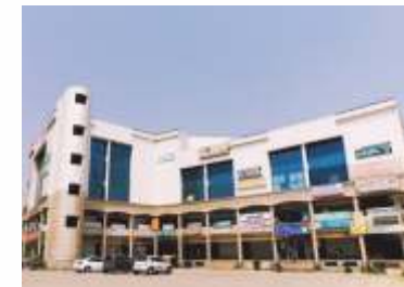
Krishna Apra Park Plaza Greater Noida