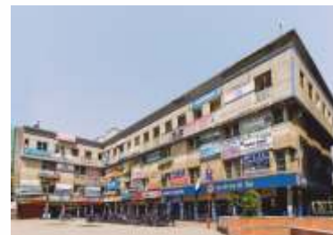
Krishna Apra Alpha Plaza Greater Noida