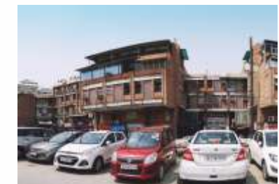
Krishna Apra Plaza New Delhi