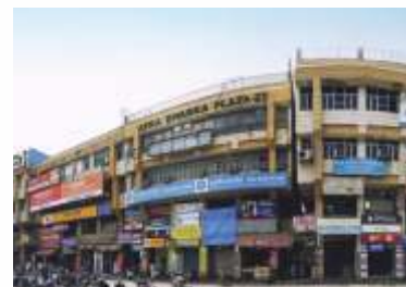
Krishna Apra Dwarka Plaza II New Delhi