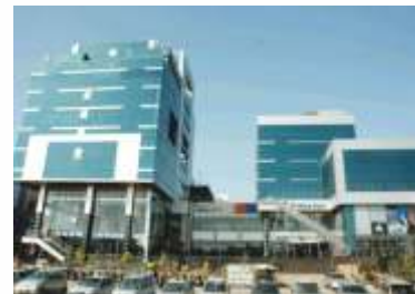
Krishna Apra Business Square New Delhi