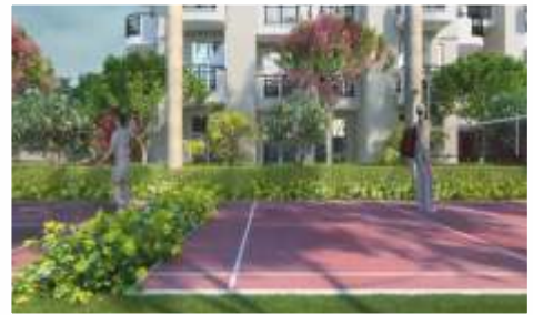
MULTI PURPOSE COURT