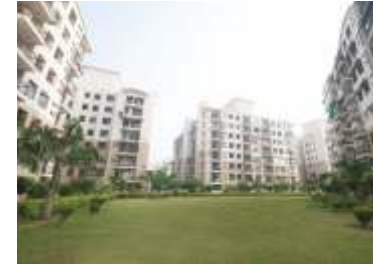
Krishna Apra Residency Sector 61, Noida