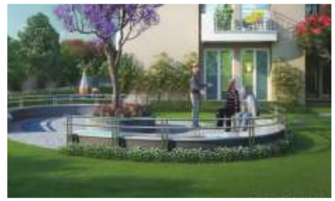
ELDER SITTING AREA