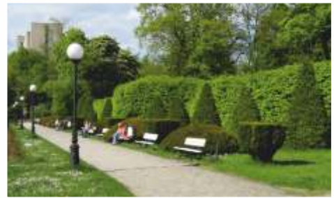
7.5 ACRE AUTHORITY PARK