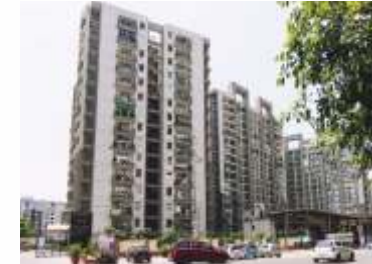
Krishna Apra Sapphire Indrapuram