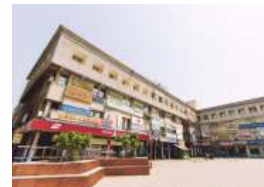
Krishna Apra Golf View Plaza Greater Noida