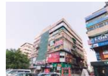
Krishna Apra Plaza Sector 18, Noida