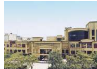
Krishna Apra D'Mall Indrapuram