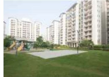
Krishna Apra Gardens Indrapuram