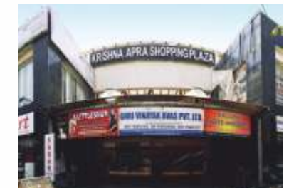
Krishna Apra Shopping Plaza Indrapuram