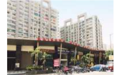
Krishna Apra Sapphire Plaza Indrapuram