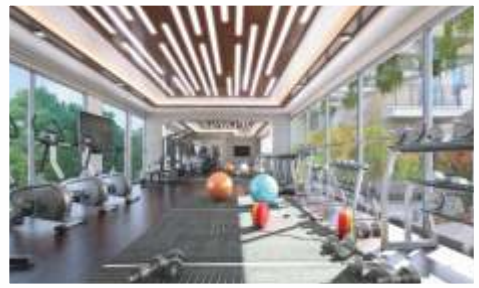
CLUB GYM & SAUNA