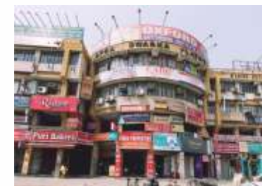
Krishna Apra Dwarka Plaza I New Delhi