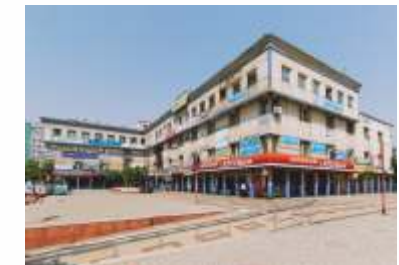
Krishna Apra Royal View Plaza Greater Noida