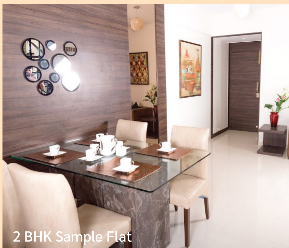
2 BHK Sample Flat

Be it 1 BHK or 2 BHK, there's never a compromise on space