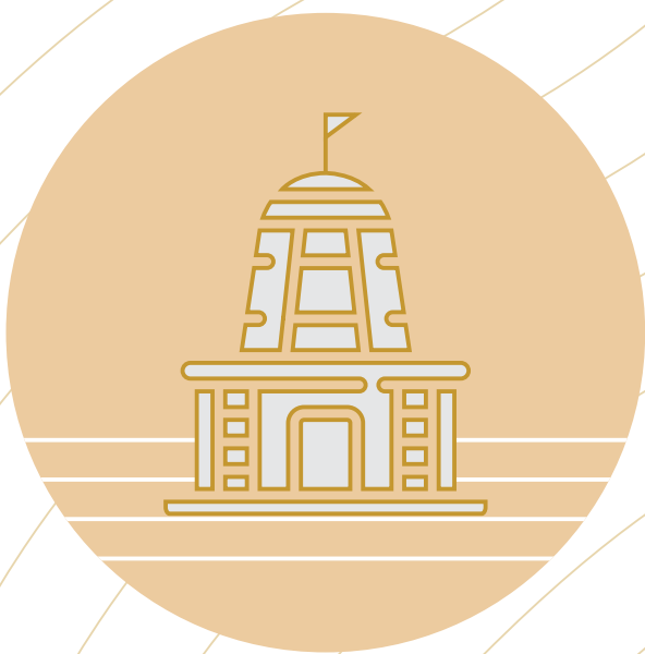
Temple within the premise