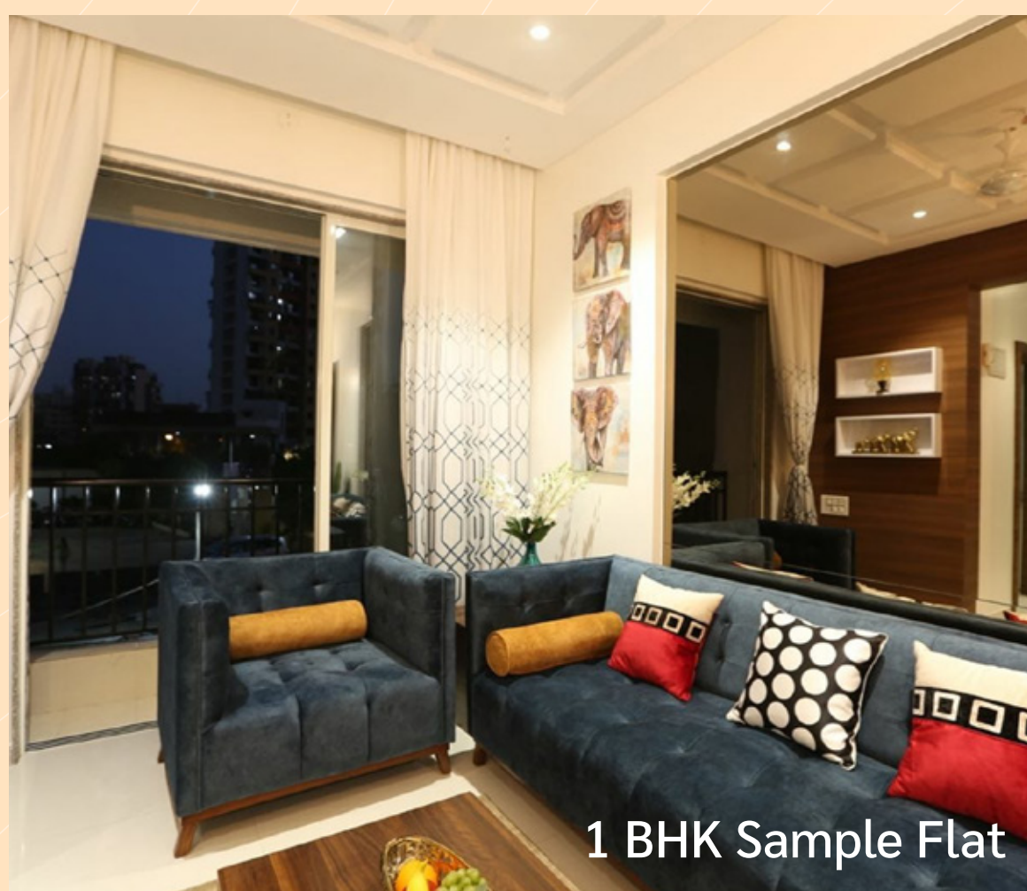
1 BHK Sample Flat

One remarkable view. Two remarkable residences