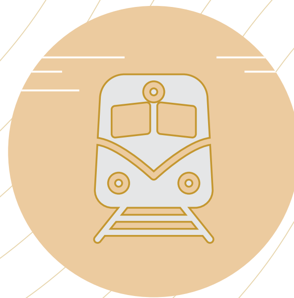
Close to Kalyan Station