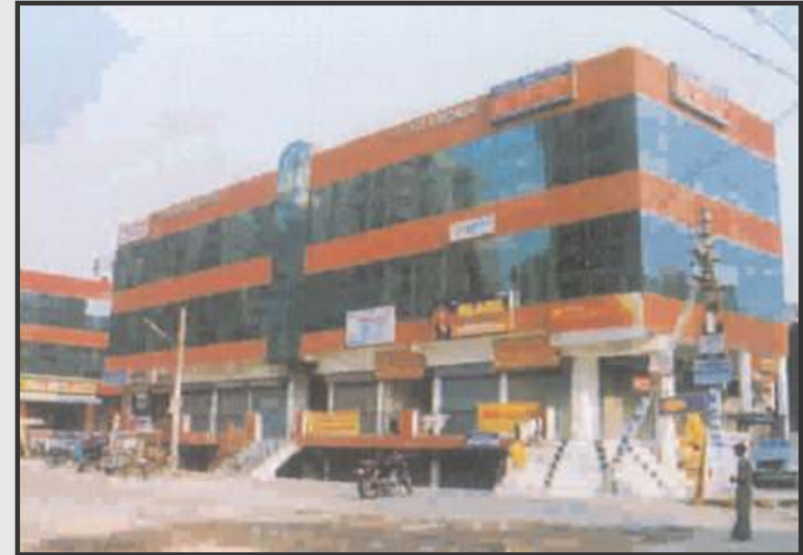
Jyoti Arcade Plot No- N, Jaipuria Enclave, Kaushambi, GZB