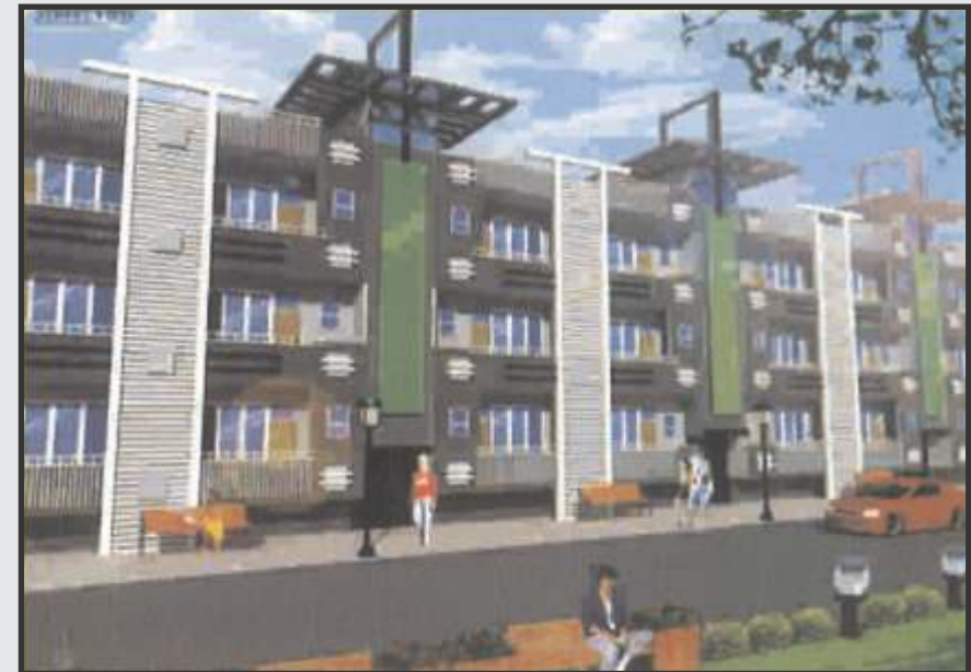
Jyoti Super Village Khasra No. 1181, 1183, Village - Noor Nagar, Raj Nagar Ext., Meerut Road