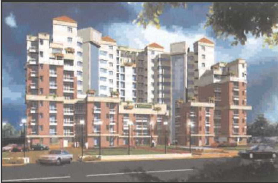
Jyoti Super Gardenia 2 Mall Road, Ashiana Khand - II, Indirapuram, GZB