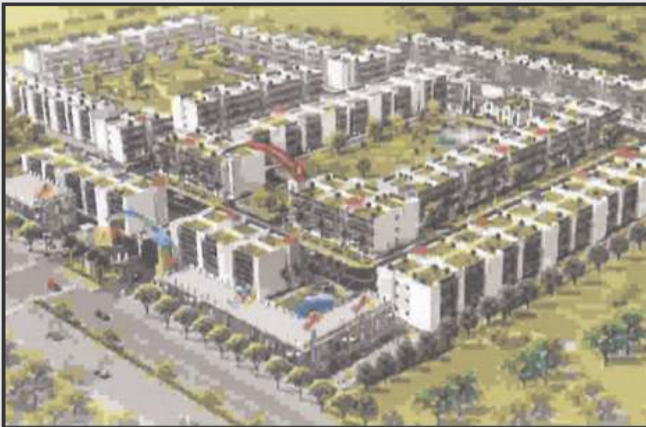
Jyoti Super Village Khasra No. 1181, 1183, Village - Noor Nagar, Raj Nagar Ext., Meerut Road