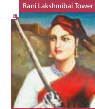
RANI LAKSHMIBAI (19 November 1828 – 18 June 1858)