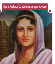
RANI KELADI CHENNAMMA (1671-1696)