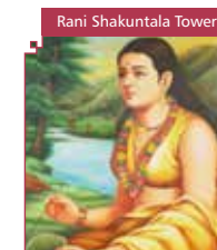
RANI SHAKUNTALA (Immortal)