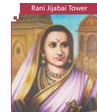
RANI JIJABAI (JANUARY 12, 1598 - JUNE 17, 1674)