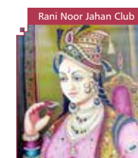
RANI NOOR JAHAN (1577-1645)