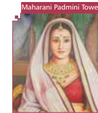
MAHARANI PADMINI (1220 - 1303 CE)

The day I became The Queen, The day I moved to Palace Heights