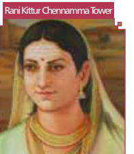
RANI KITTUR CHENNAMMA (October 23, 1778 - February 21, 1829)