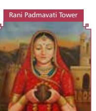
RANI PADMAVATI (1280-1303)