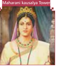
MAHARANI KAUSALYA (Immortal)