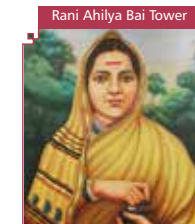
RANI AHILYA BAI HOLKER (31 May 1725 – 13 August 1795)