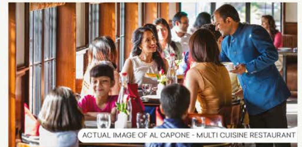
ACTUAL IMAGE OF AL CAPONE - MULTI CUISINE RESTAURANT