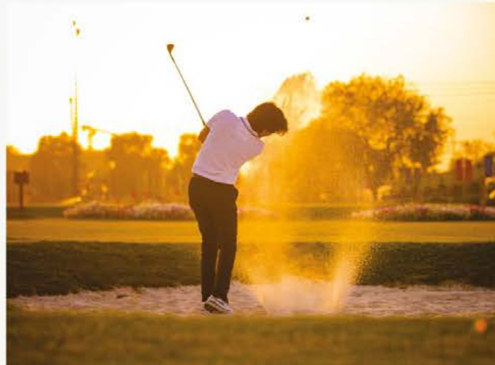
ACTUAL IMAGES OF DAY & NIGHT GOLF ACADEMY