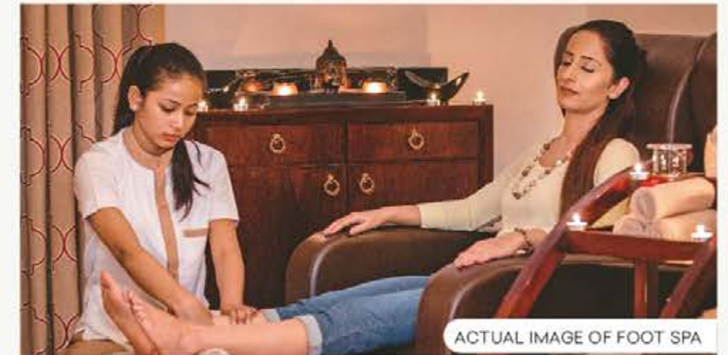
ACTUAL IMAGE OF FOOT SPA