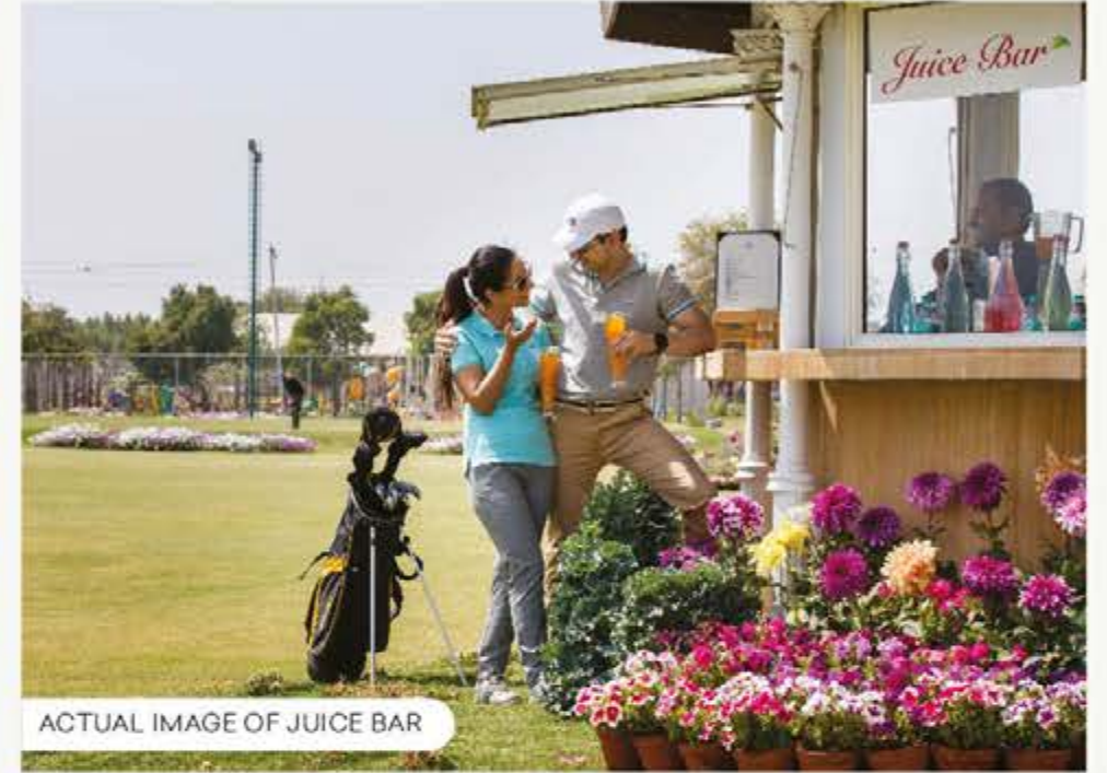
ACTUAL IMAGE OF JUICE BAR