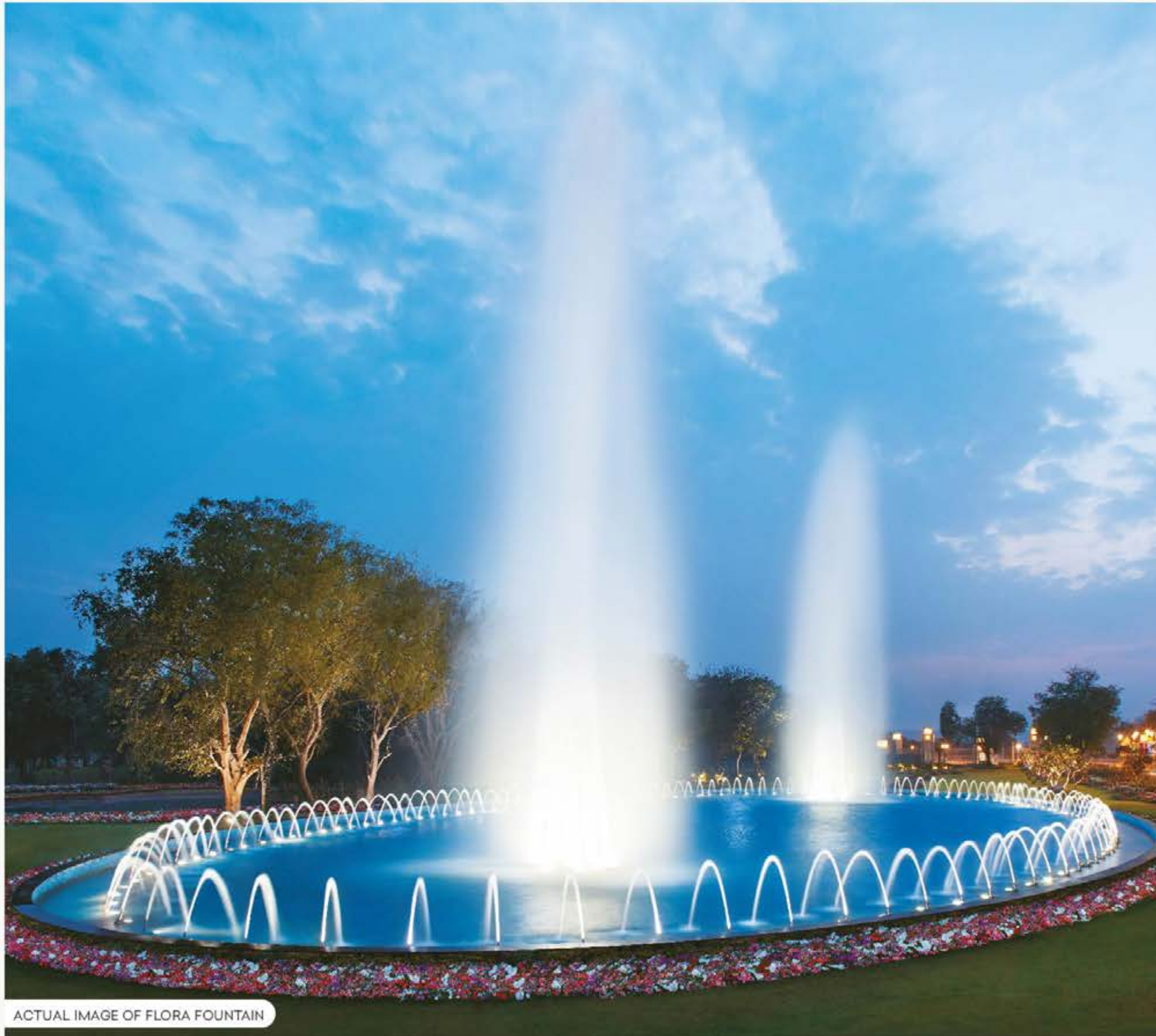
ACTUAL IMAGE OF FLORA FOUNTAIN