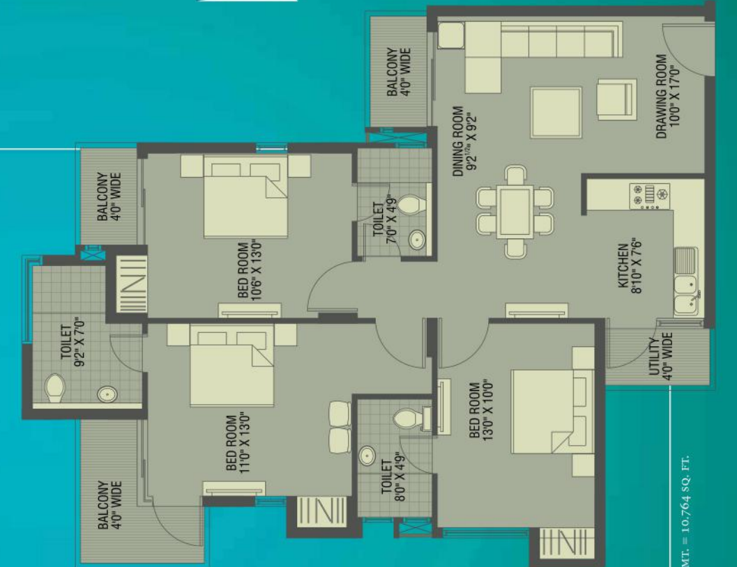
UNIT 3 & UNIT 4 IN TOWER C 3 BHK - TYPE 2 TOTAL SUPER AREA - 1553 Sq. Ft.