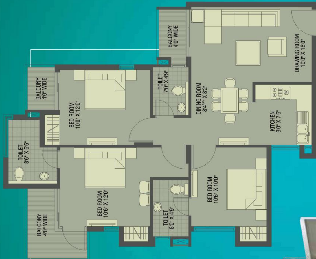
UNIT 3 & UNIT 4 IN TOWER D 3 BHK - TYPE 1 TOTAL SUPER AREA - 1370 Sq. Ft.