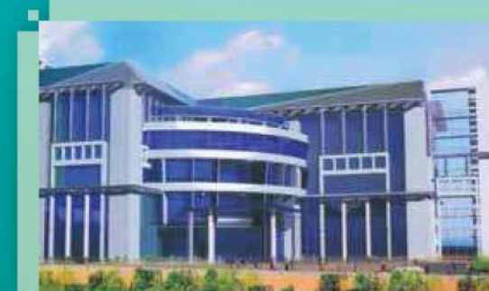
RATAN SQUARE - LUCKNOW