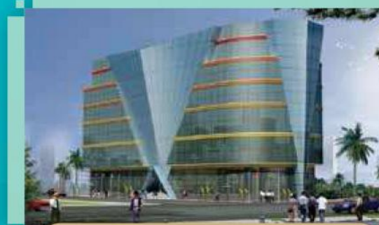
RATAN ZONE - KANPUR