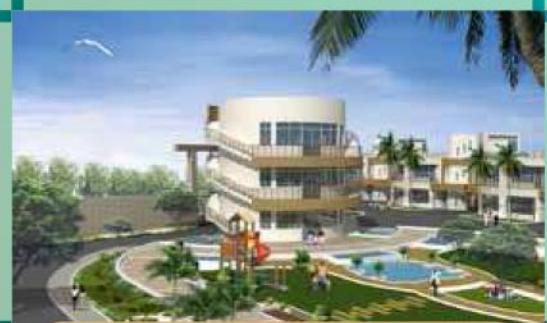
RATAN TARANG - KANPUR