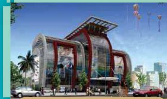
RATAN UNIQUE - KANPUR