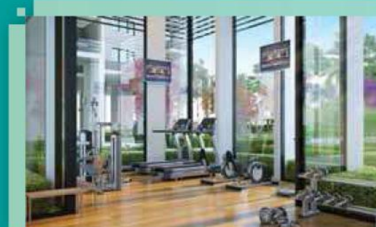
WELL EQUIPPED GYM