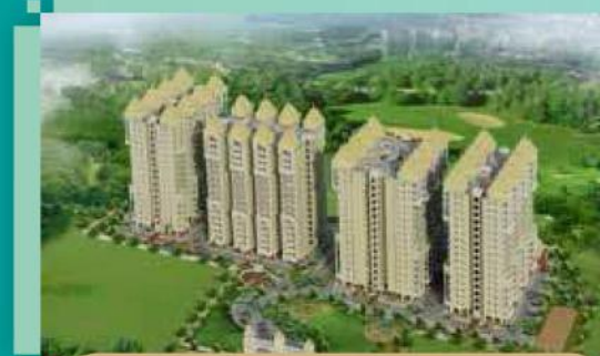
RATAN PLANET - KANPUR