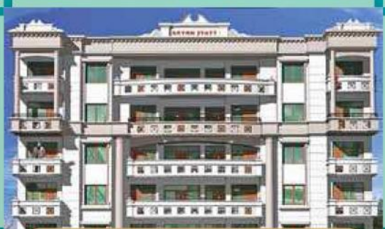
RATAN JYOTI - KANPUR