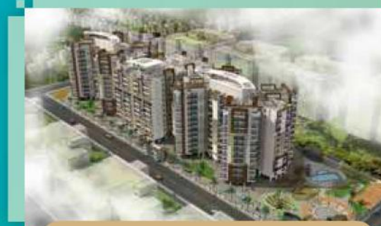
RATAN GALAXY - LUCKNOW