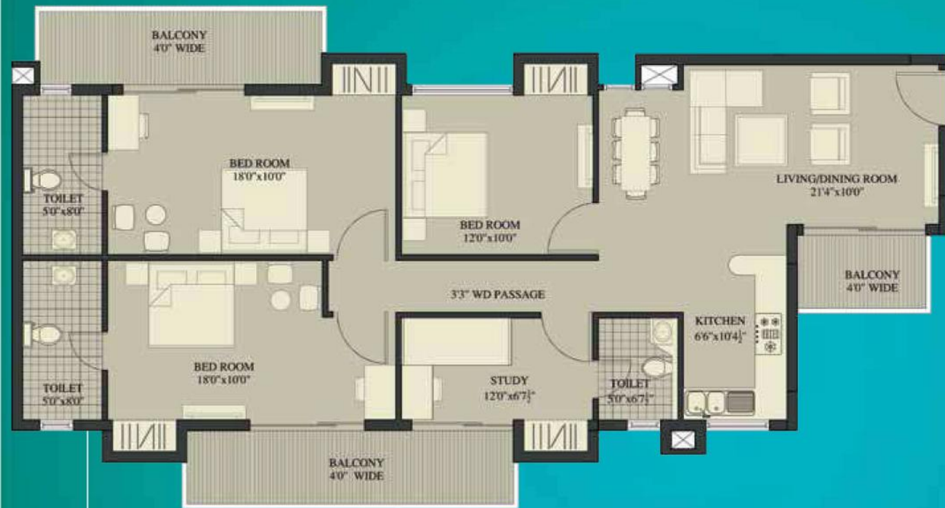
UNIT 3 & UNIT 4 IN TOWER C 3 BHK - TYPE 2 TOTAL SUPER AREA - 1846 Sq. Ft.