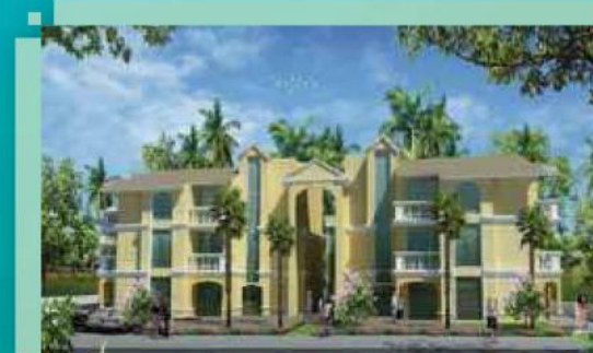
RATAN EXOTICA - GOA