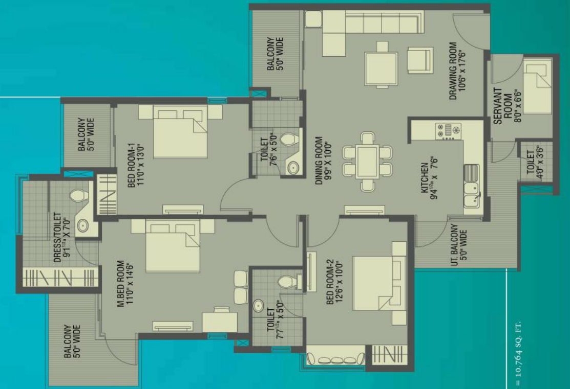
UNIT 3 & UNIT 4 IN TOWER A & B 3 BHK - Servant TOTAL SUPER AREA - 1874 Sq. Ft.