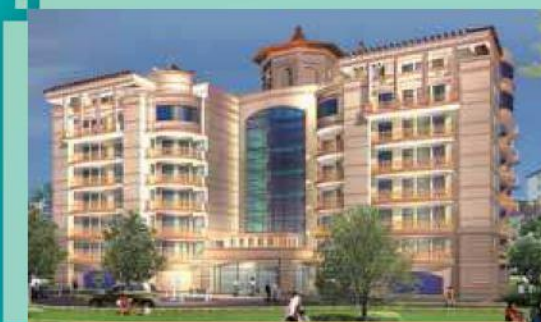
RATAN PRESIDENCY - KANPUR