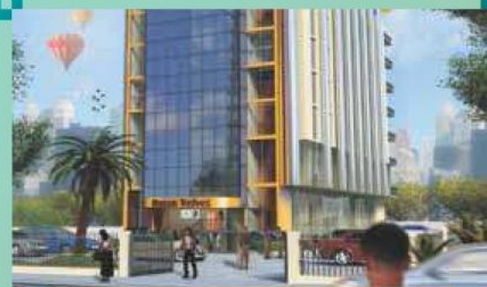
RATAN VELVET - KANPUR