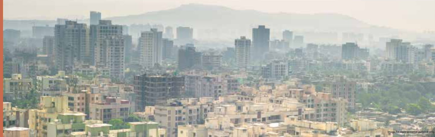
Image for representative purpose only.