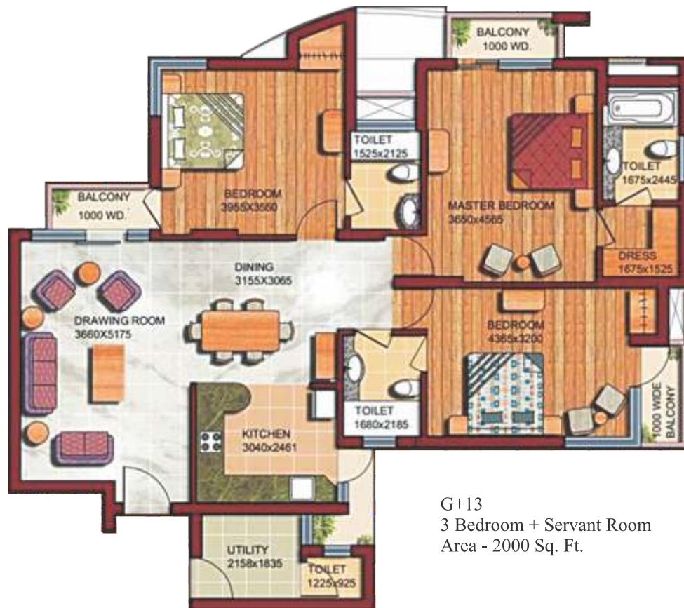
G+13 3 Bedroom + Servant Room Area - 2000 Sq. Ft.