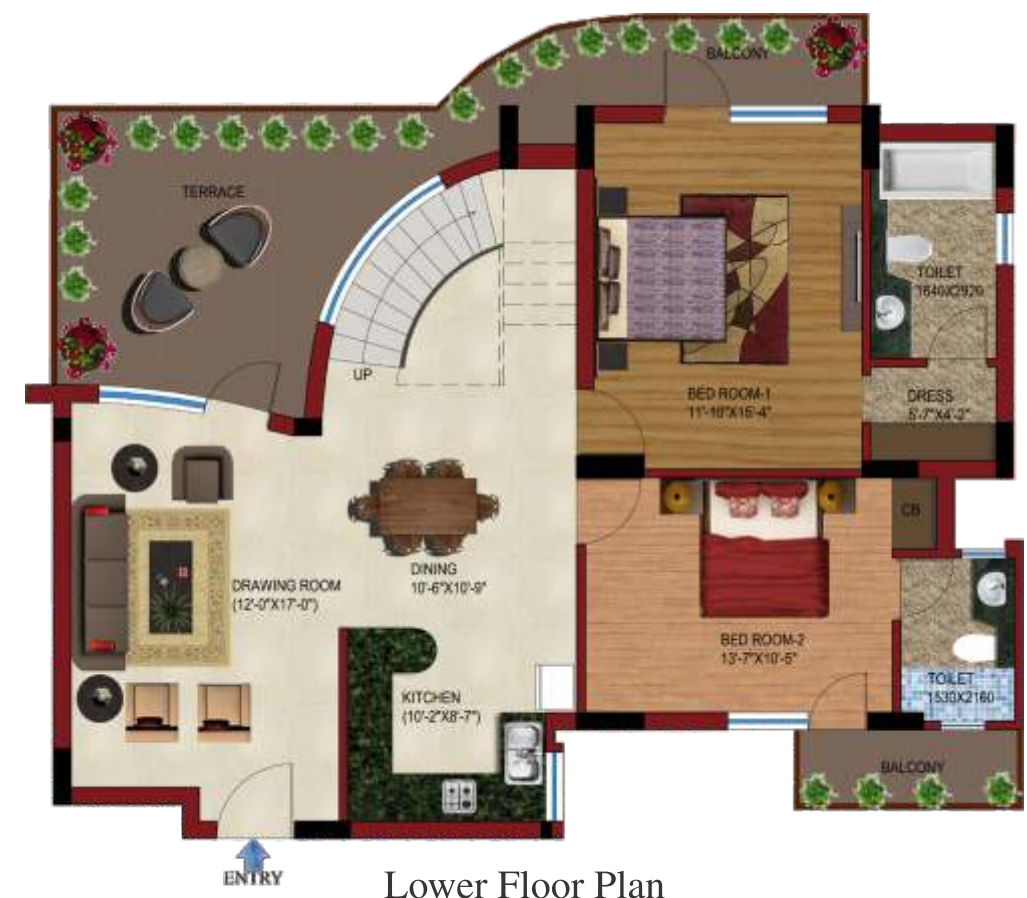
Lower Floor Plan

Darius 5 Super Area - 2920 sq. ft. Terrace Area - 447 sq. ft.