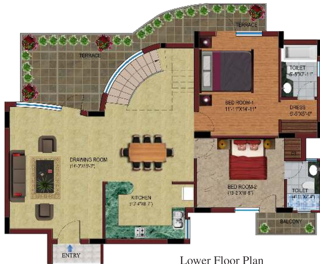
Lower Floor Plan

Darius 7 Super Area - 3080 sq. ft. Terrace Area - 541 sq. ft.