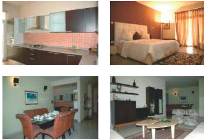
Actual project shots

Life stands above the ordinary at Czar Suites. Elegant and well appointed 2/3/4 BHK apartments that seamlessly converge the best of aesthetics and amenities. Rich interiors, premium specifications and specious planning make each apartment a sterling example of comfort and convenience. Living here is definitely a special experience.