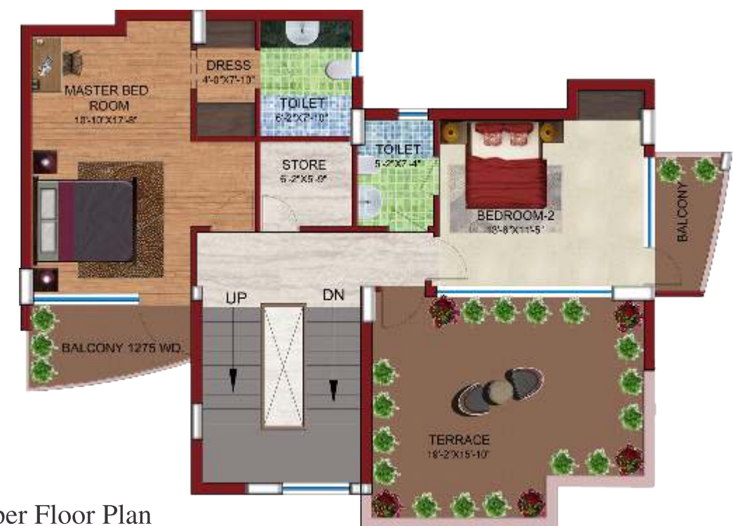
Upper Floor Plan