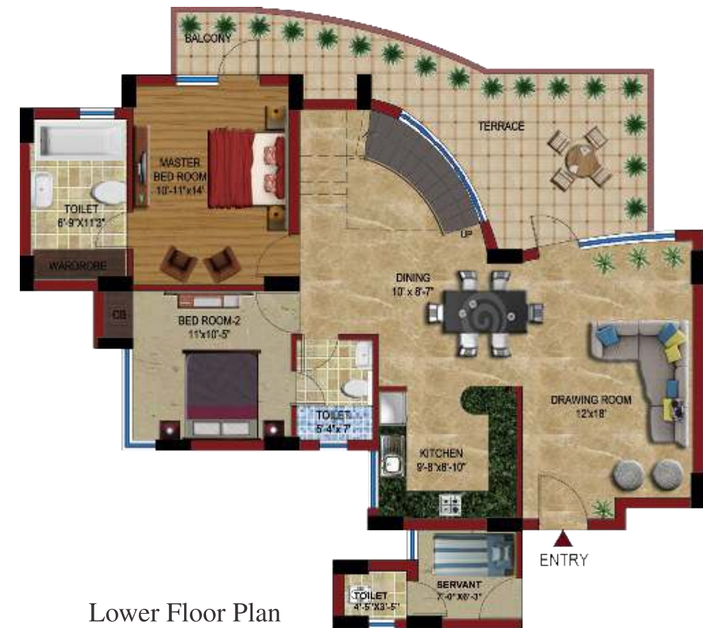
Lower Floor Plan

Darius 7 Super Area - 3080 sq. ft. Terrace Area - 541 sq. ft.