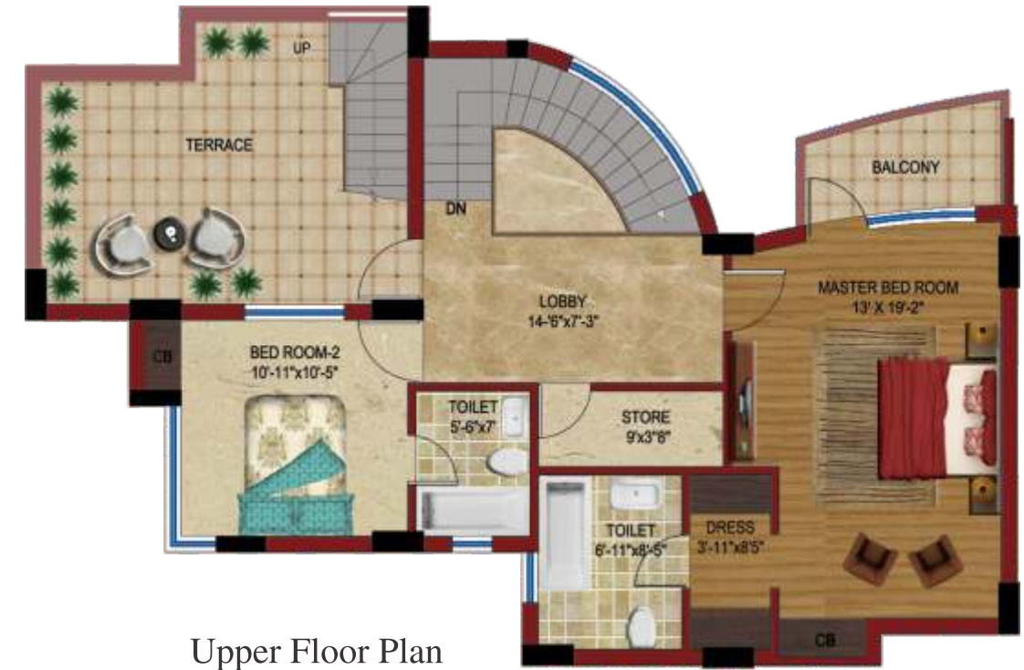
Upper Floor Plan