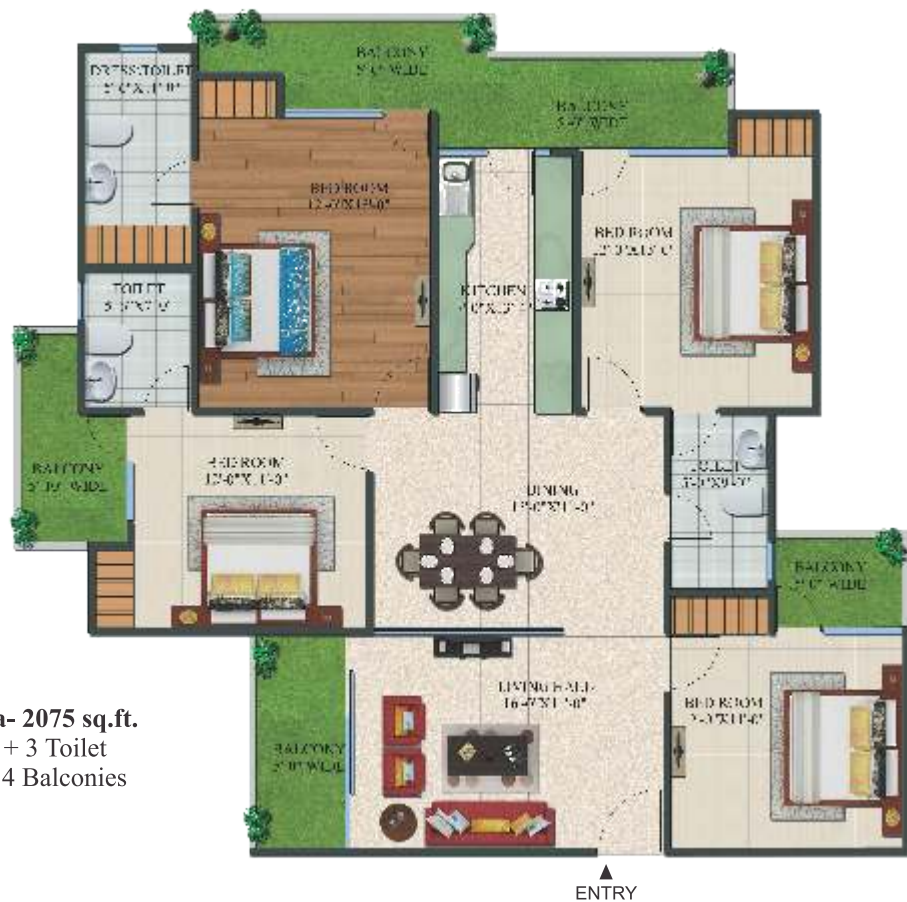
Super Area- 2075 sq.ft. 4 Bedroom + 3 Toilet + Dining + 4 Balconies