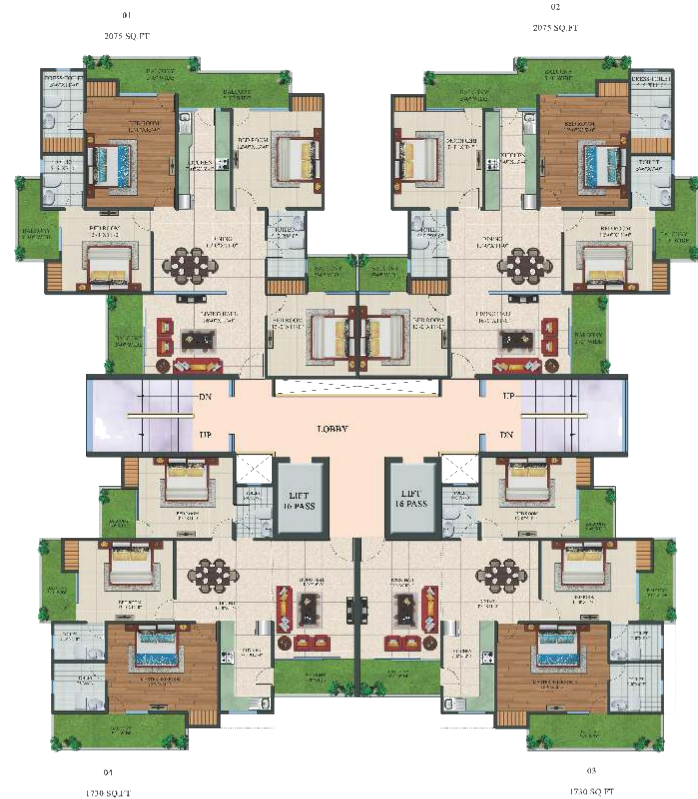
01 2075 SQ.FT