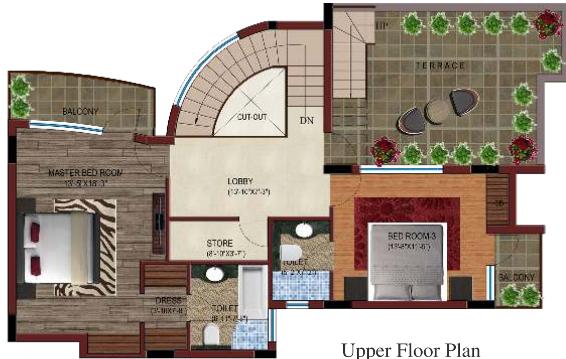
Upper Floor Plan