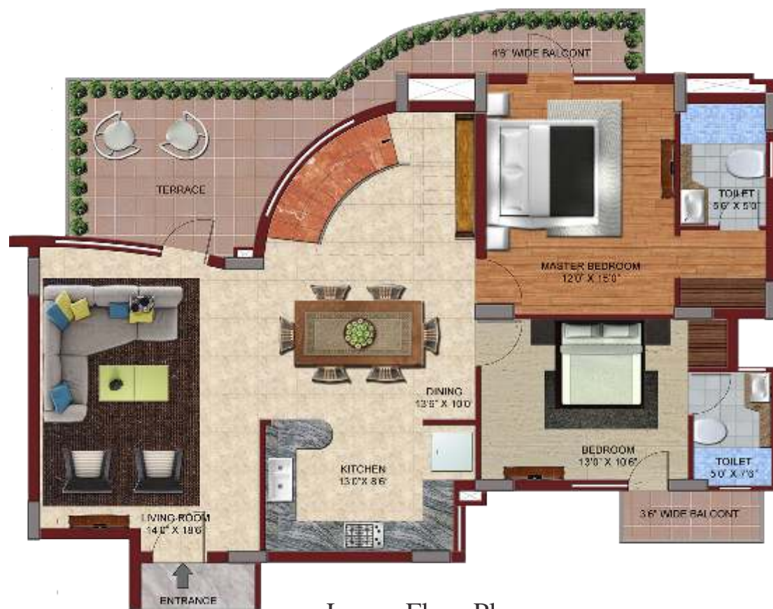
Lower Floor Plan

Darius 5 Super Area - 2920 sq. ft. Terrace Area - 447 sq. ft.