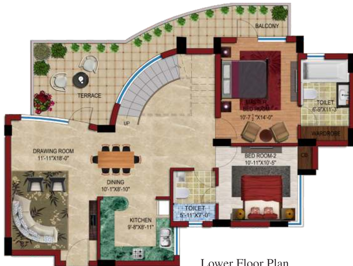
Lower Floor Plan

Darius 8 (without servant) Super Area - 2915 sq. ft. Terrace Area - 480 sq. ft.