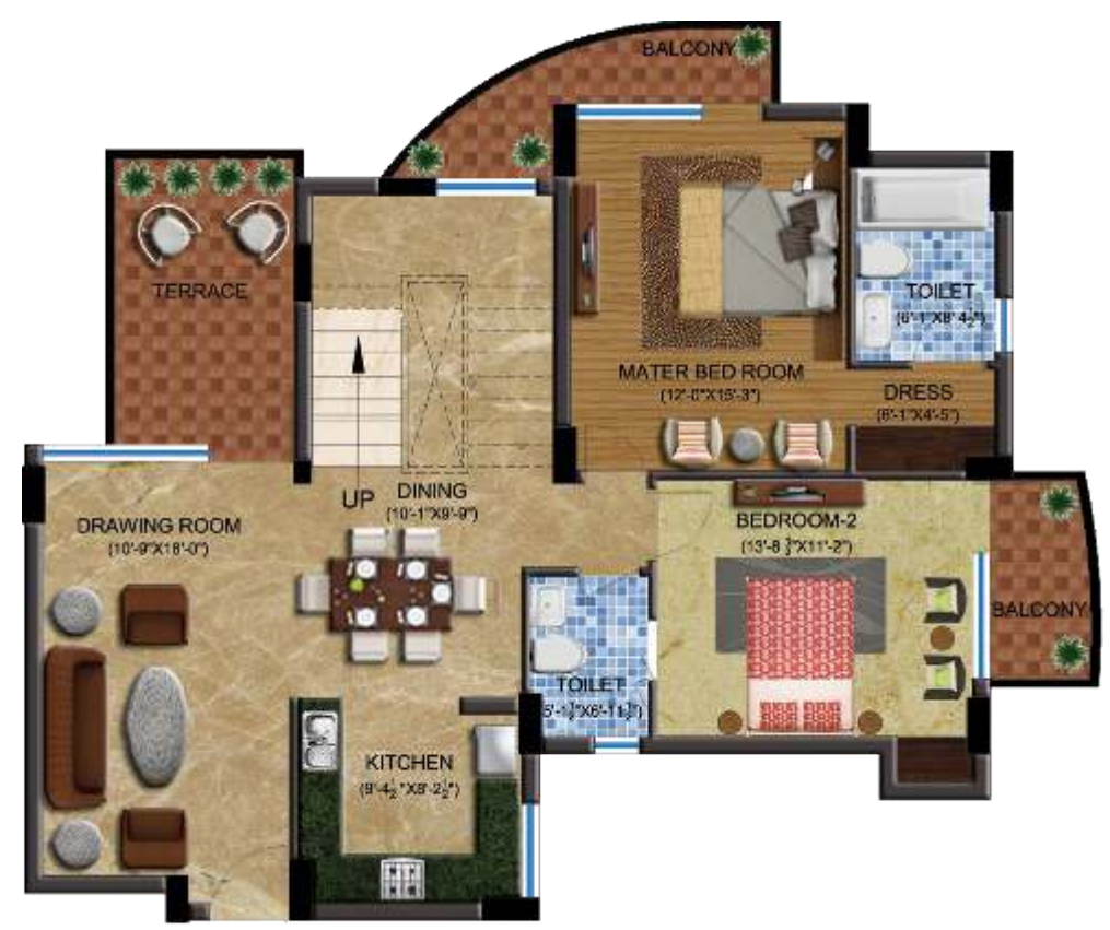
Lower Floor Plan

Arthur 1 Super Area - 3417 sq. ft. Terrace Area - 1048 sq. ft.