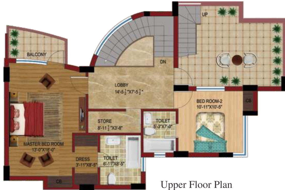
Upper Floor Plan