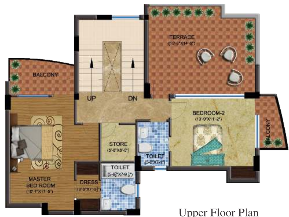
Upper Floor Plan