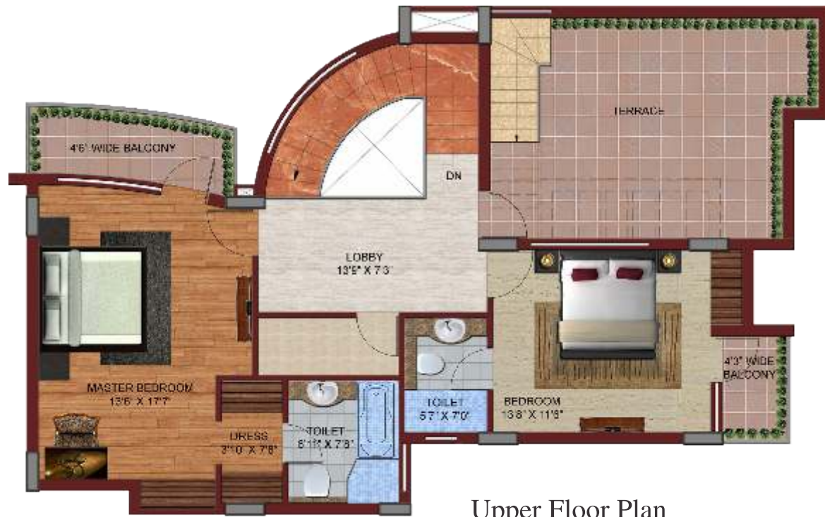
Upper Floor Plan