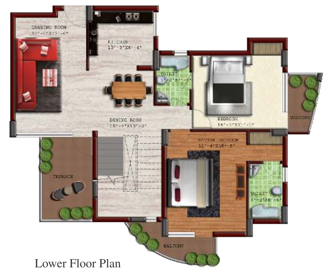
Lower Floor Plan

Arthur 1 Super Area - 3417 sq. ft. Terrace Area - 1048 sq. ft.