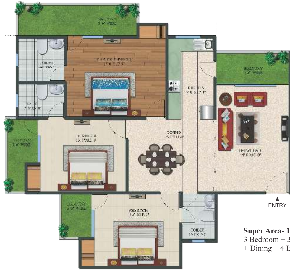
Super Area- 1730 sq.ft. 3 Bedroom + 3 Toilet + Dining + 4 Balconies