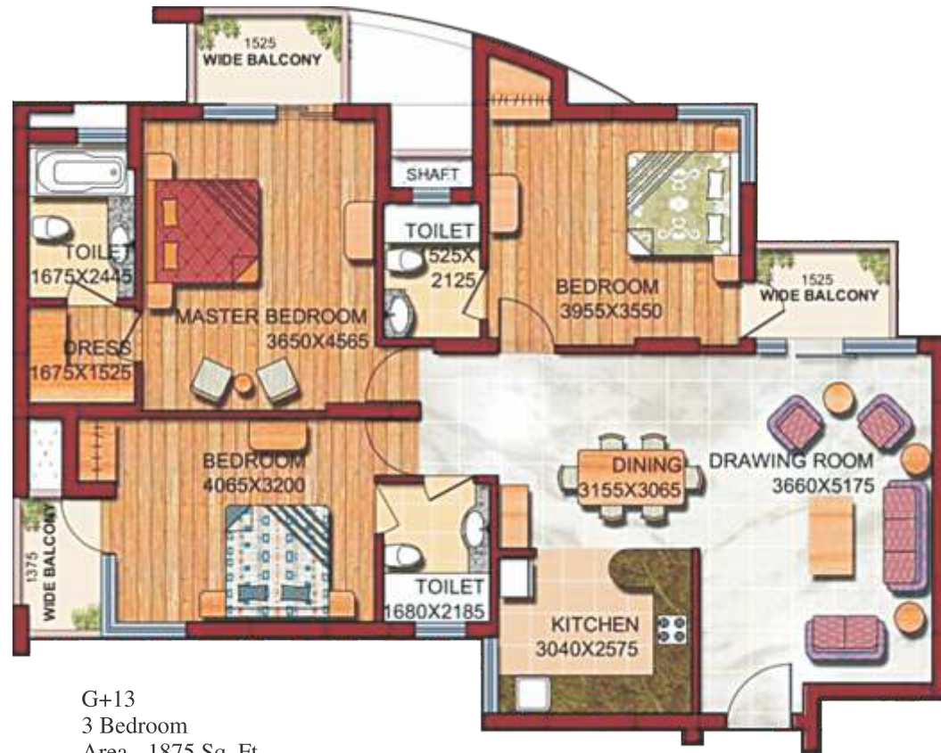
G+13 3 Bedroom Area - 1875 Sq. Ft.