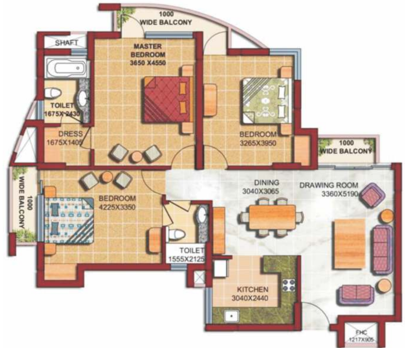
G+13 3 Bedroom, Area - 1775 Sq. Ft.