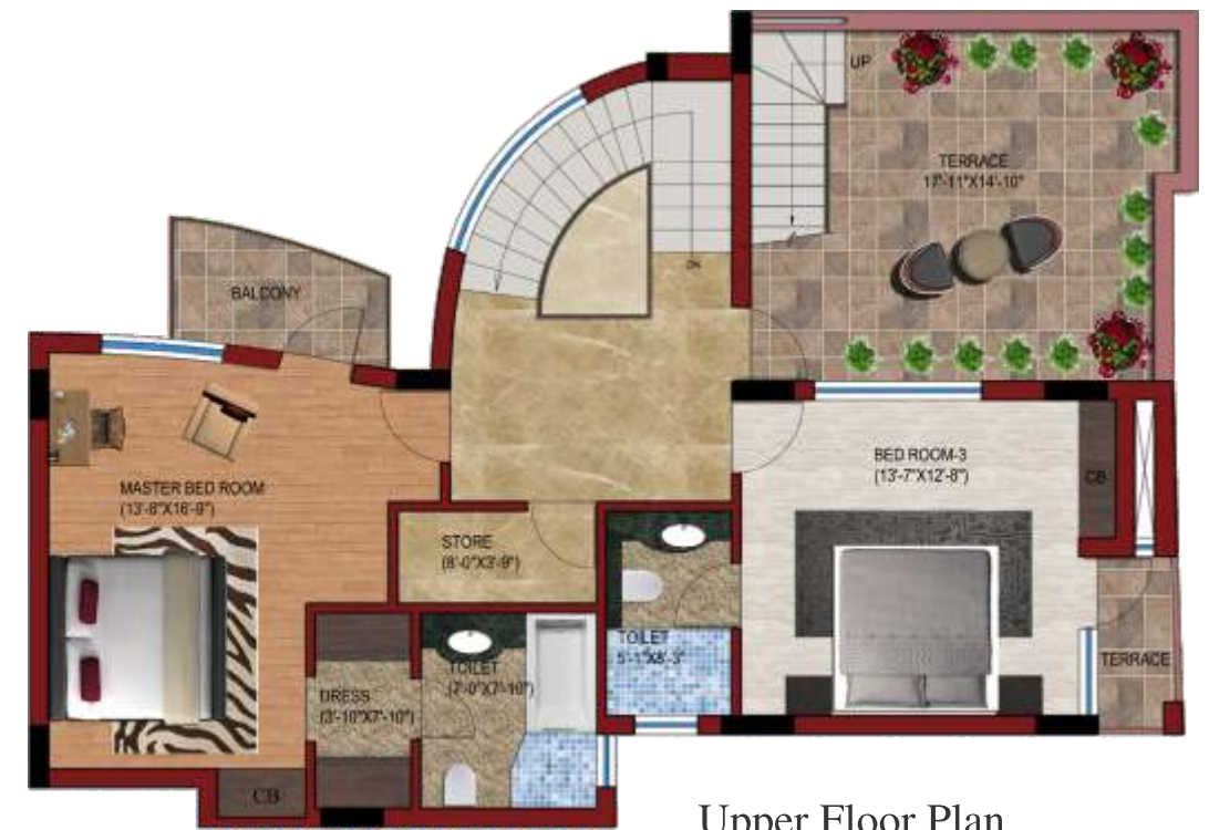
Upper Floor Plan