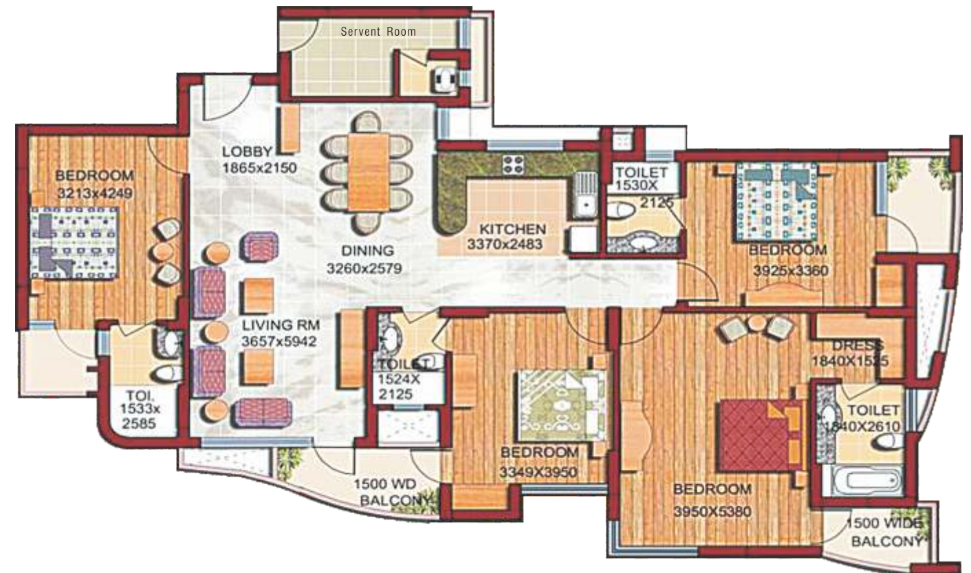
G+13 4 Bedroom + Servant Room Location: Unit No. 1 & 4 in Darius Six Area - 2490 Sq. Ft.