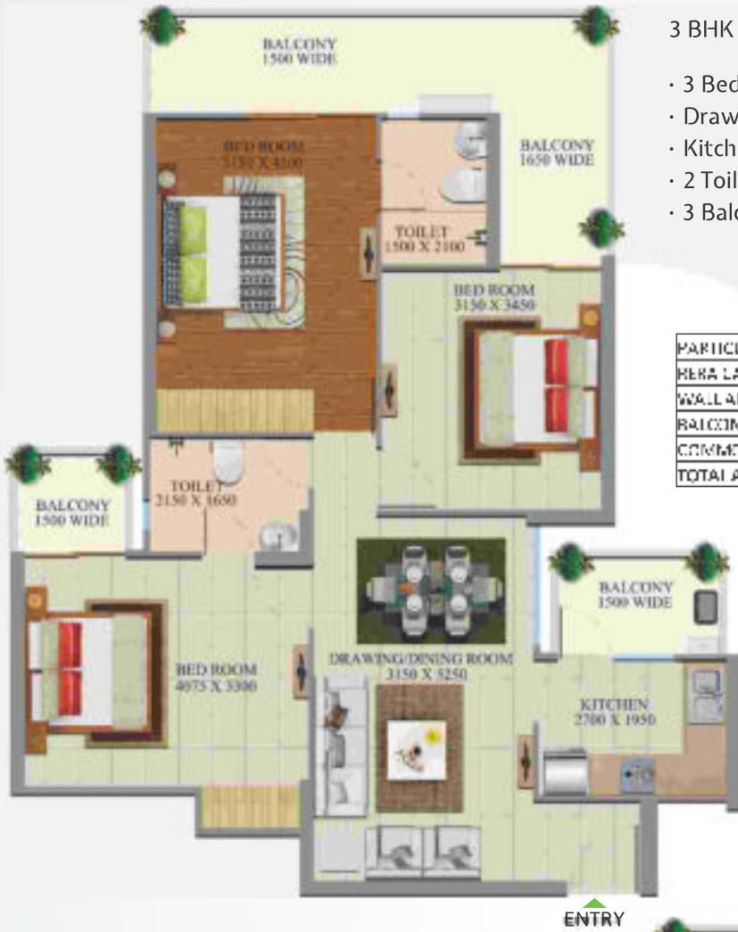
3 BHK 1490 Sq. Ft.