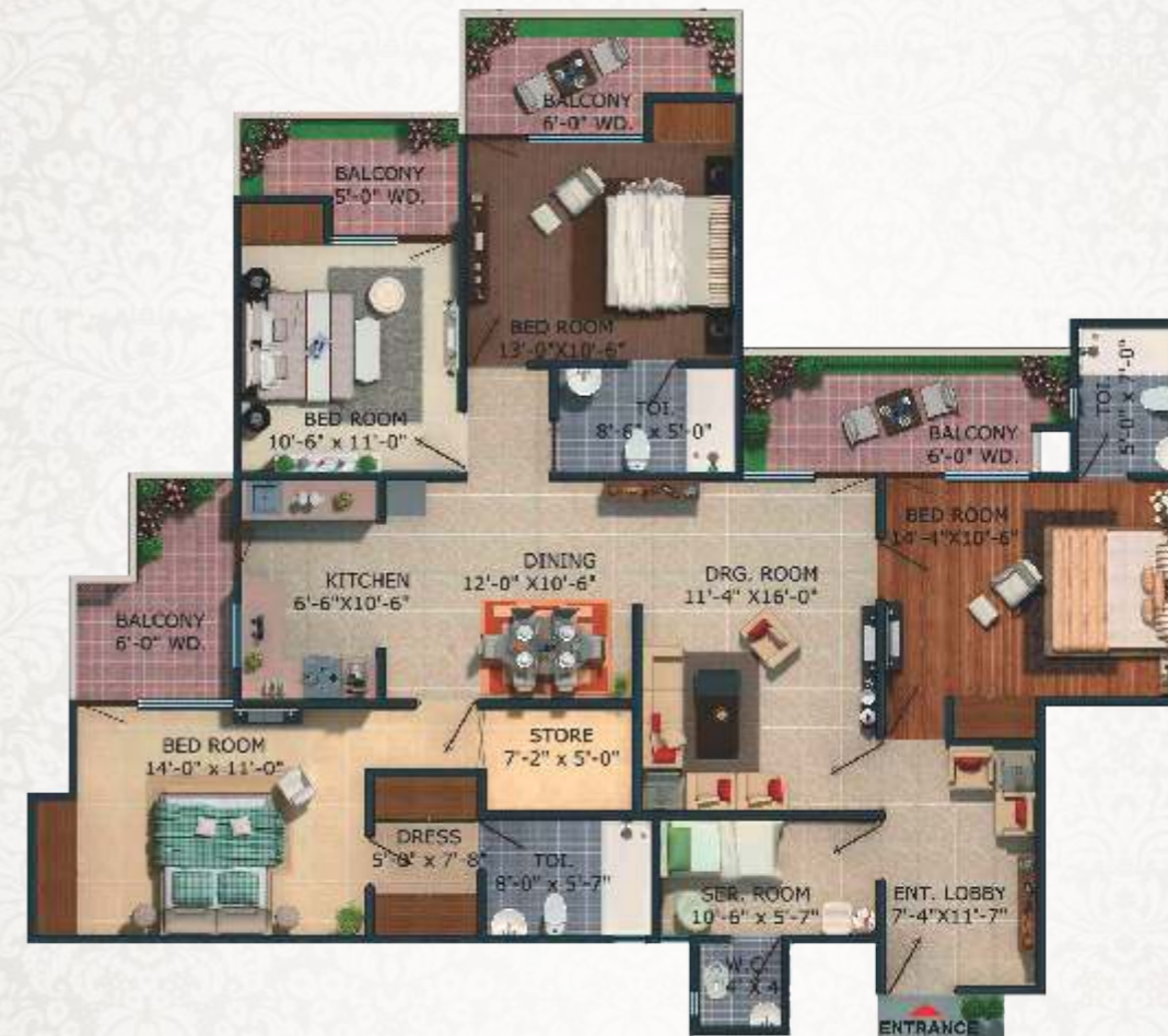
SUPER AREA - 2364 sq. ft. 4 Bedroom + 4 Toilets + Dining + Foyer + Dress + Servant room + 4 Balcony