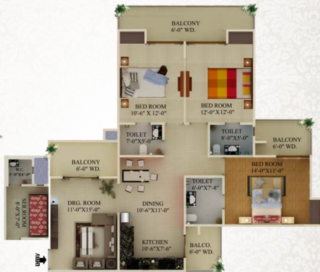
SUPER AREA - 1906 sq. ft. 3 Bedroom + 3 Toilets + Kitchen + Dining + Drawing + 4 Balcony