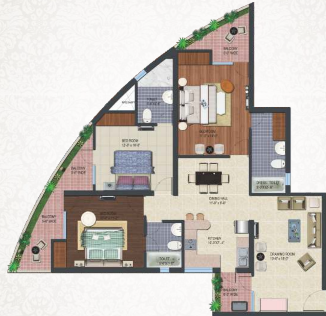
SUPER AREA - 1725 sq. ft. 3 Bedroom + 3 Toilets + Kitchen + Dining + Drawing + Dress + 4 Balcony