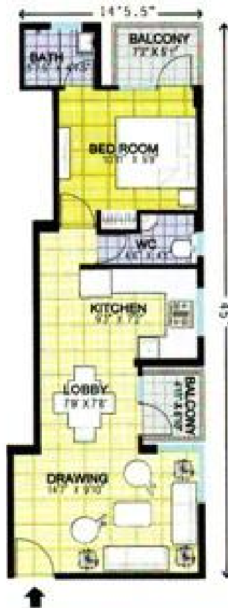
1 BHK Type - 2