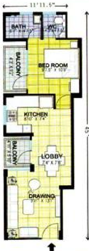
1 BHK Type - 1