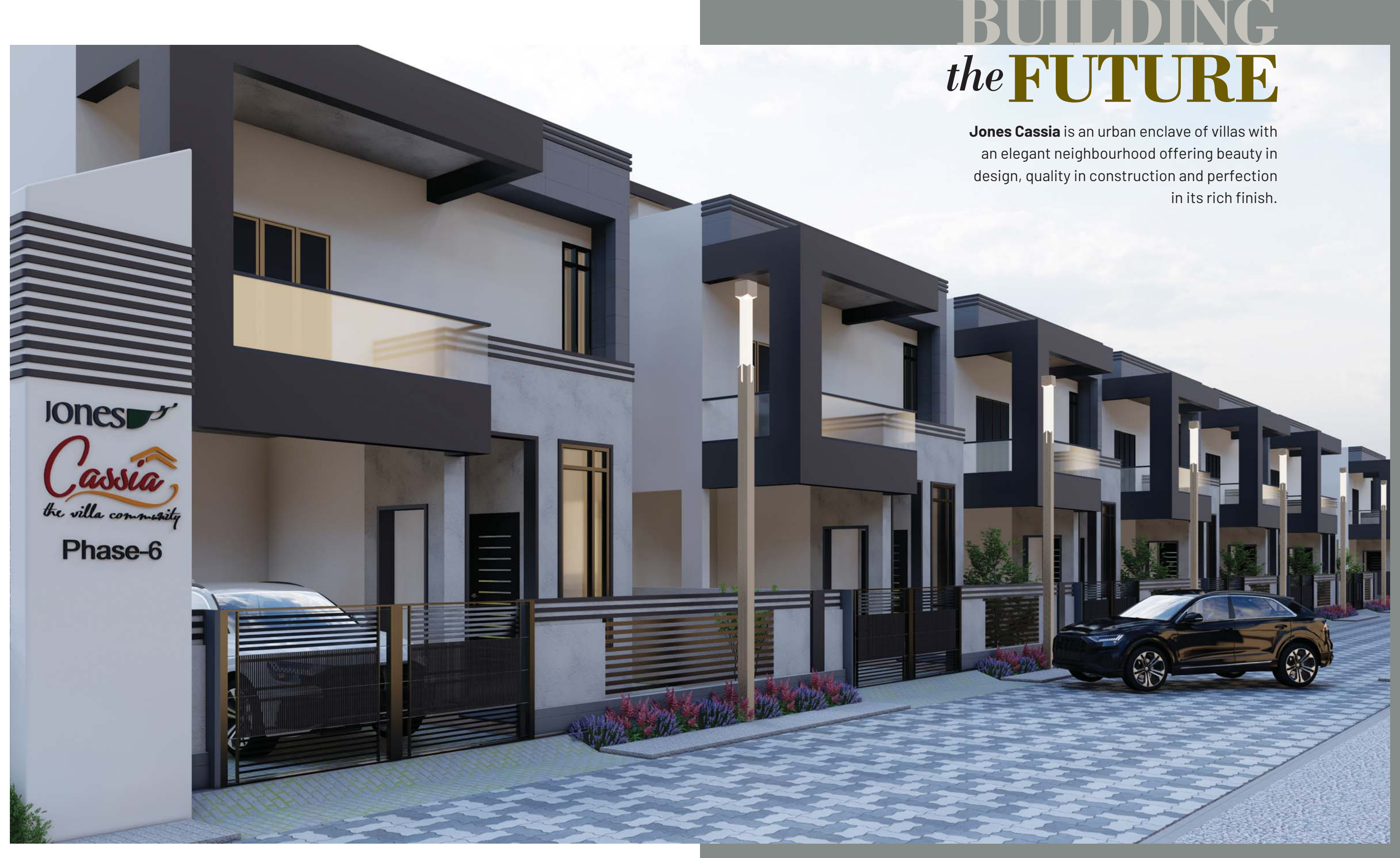
CASSIA - PHASE 6