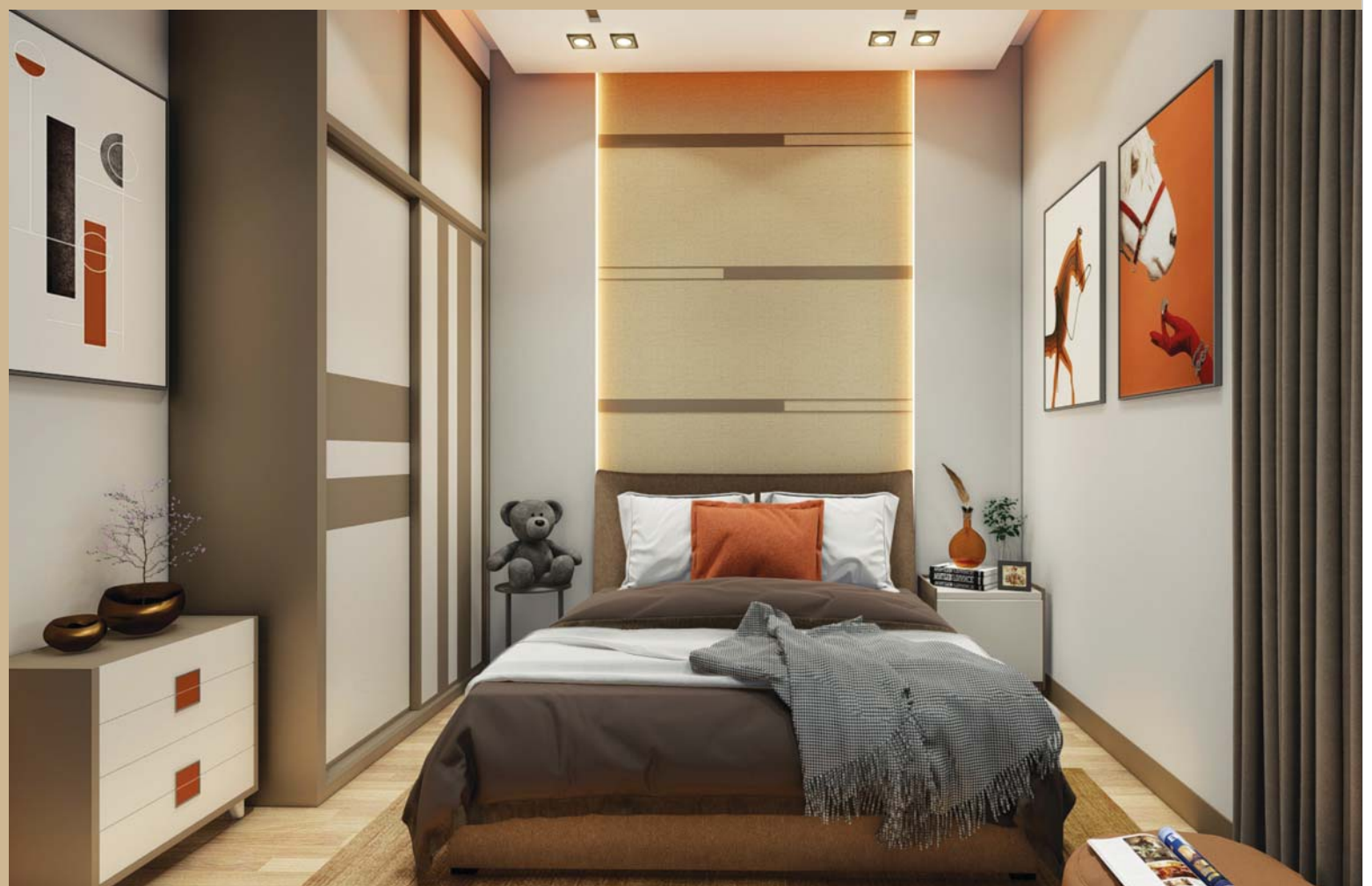
This brochure is purely conceptual and does not constitute a legal document. Visual representations are not to be taken as representations of fact, and do not form part of an offer or contract. The management of Jones Foundations Pvt Ltd reserves the right to add, delete or alter any specifications mentioned here.