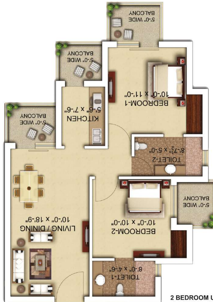
2 BEDROOM UNIT PLAN PROPOSED SALEABLE AREA : 83.61 SQ.MT/900 SQ. FT