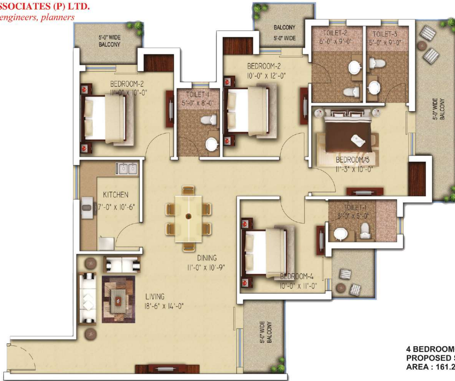
4 BEDROOM+3 TOI UNIT PLAN PROPOSED SALEABLE AREA : 161.2 SQ.MT/ 1735 SQ. FT