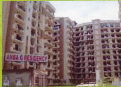
AMBA G RESIDENCY, INDIRAPURAM