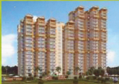
PALM HEIGHTS, RAJ NAGAR EXTN.