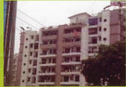
JKG HEIGHTS, VASUNDHARA