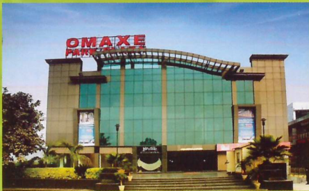
PARK PLAZA, INDIRAPURAM