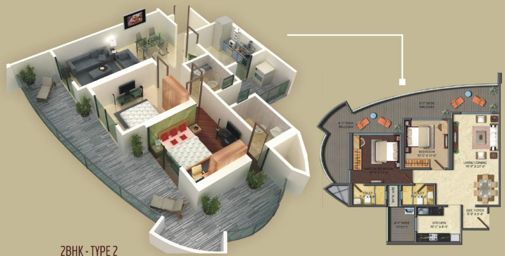
2BHK - TYPE 2