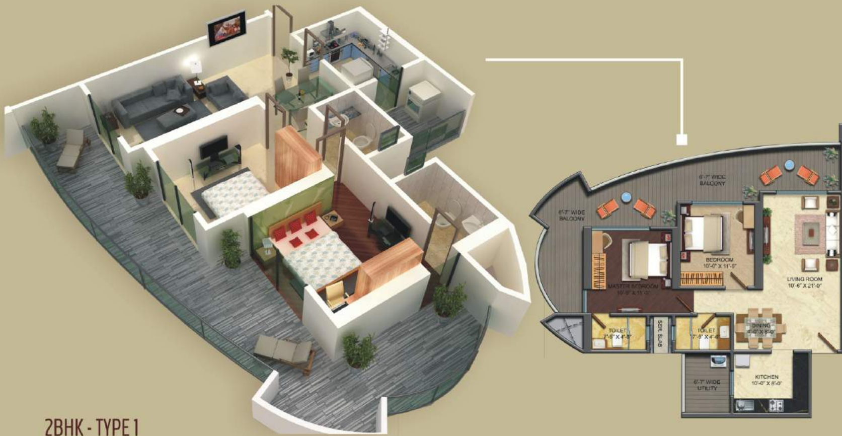
2BHK - TYPE 1