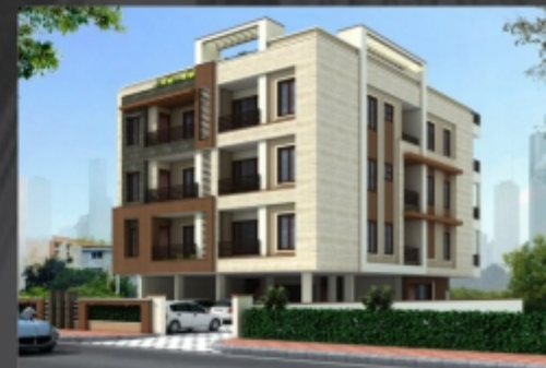
Kripa Residency, Adharsh Nagar, Jaipur