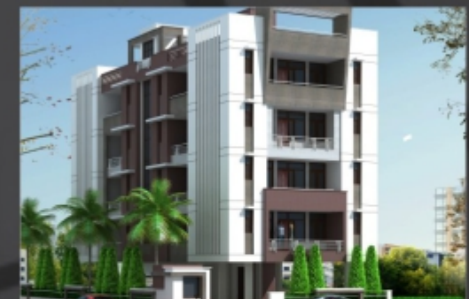
Om Enclave, Janta Colony, Jaipur