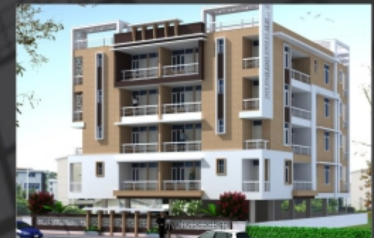
Vasundhara, Civil lines, Jaipur