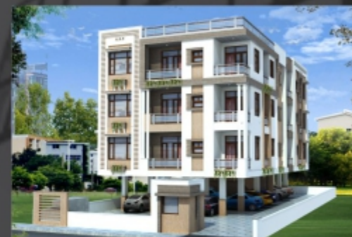
Chandraprabha, C-scheme, Jaipur