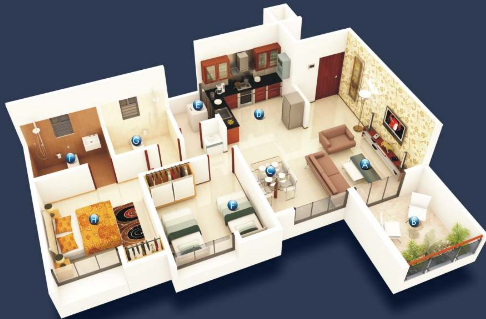
2 BHK Apartment