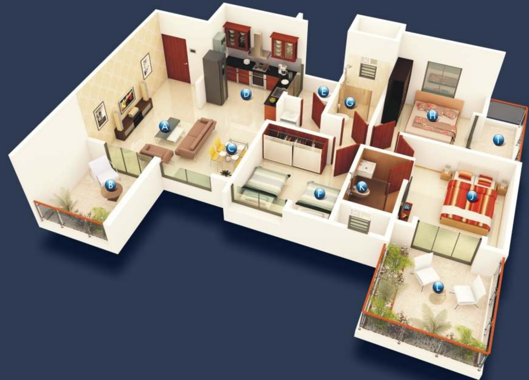
2.5 BHK Apartment