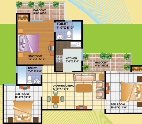
TYPE - II 2 BHK + 2 TOILET SUPER AREA : 800 sq.ft.