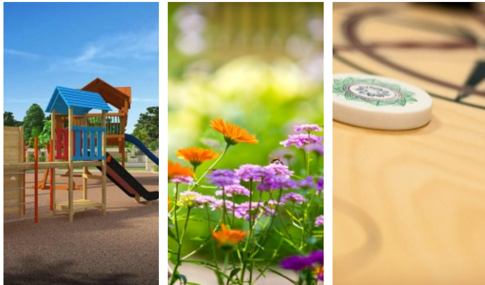
Children's play area | Indoor games | Garden area | Power back up Gypsum finished walls | POP in living room | Decorative main door Sewage treatment plant