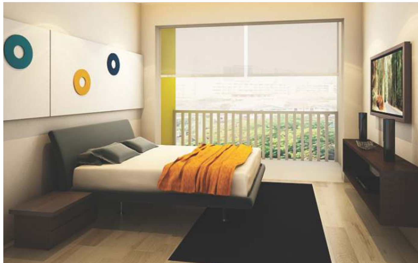
A Cozy Bedroom