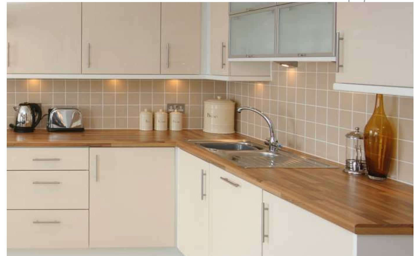
Modern Fittings in Kitchen