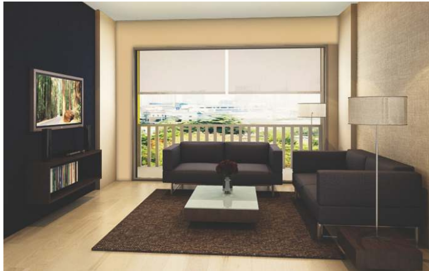
Airy Living Room

Every inch of this apartment is intelligently laid out with the smallest of your requirements. The bedroom is an extension of the affluent design. Experience pure freshness with natural light and air pouring in your home. Simplicity of form and thoughtful design has made the apartments to live your lifestyle.