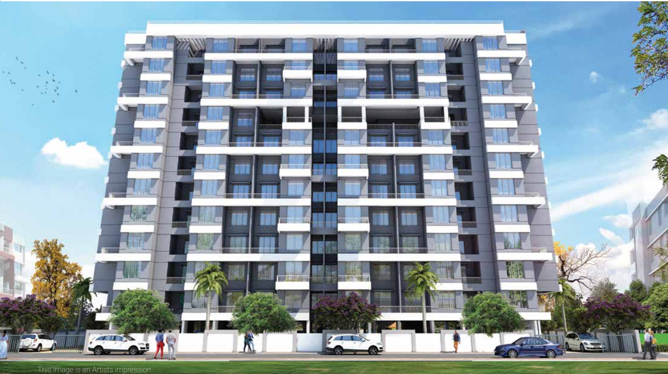
This image is an Artists impression

While designing out every amenity and feature in this project, we have kept you and your family members at the center. Our thoughts and creativity has revolved around you.