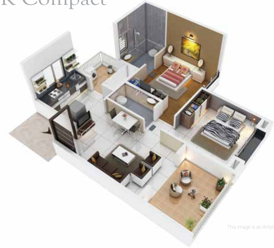
2 BHK Compact