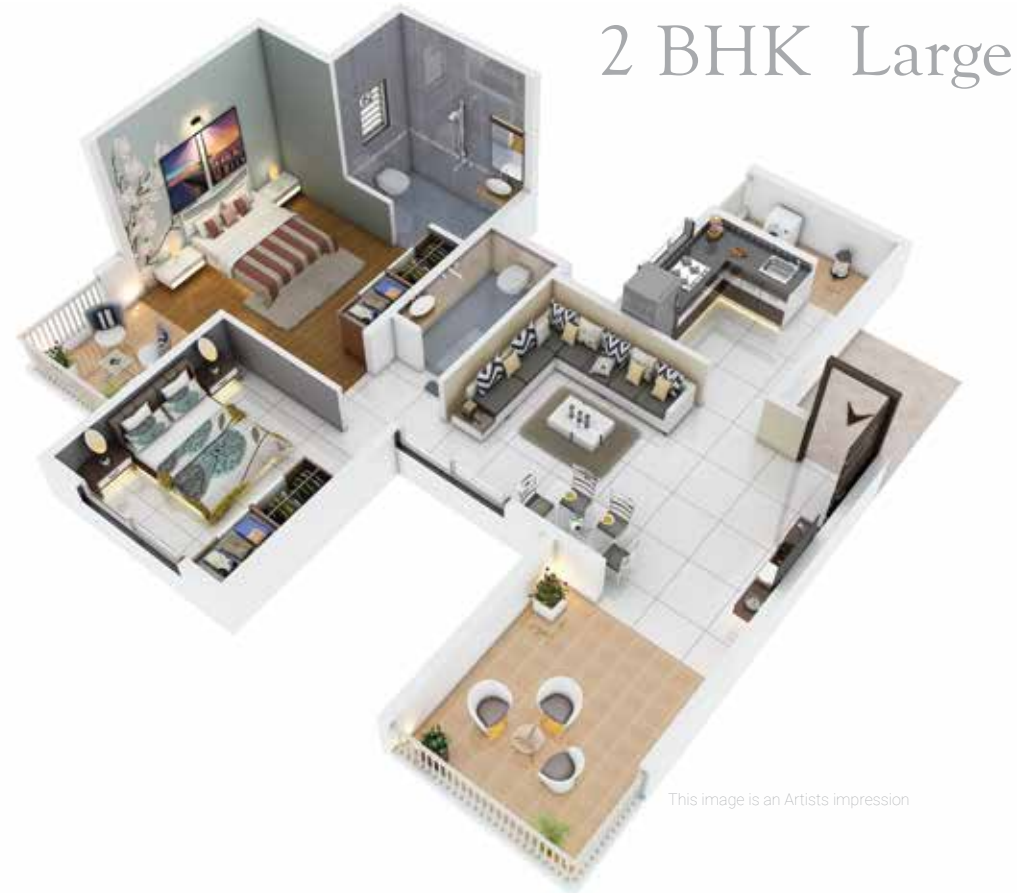
2 BHK Large