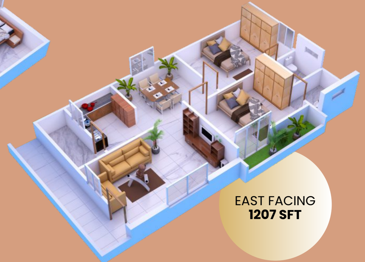
EAST FACING 1207 SFT