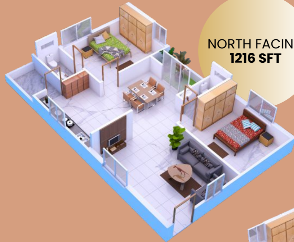
NORTH FACING 1216 SFT