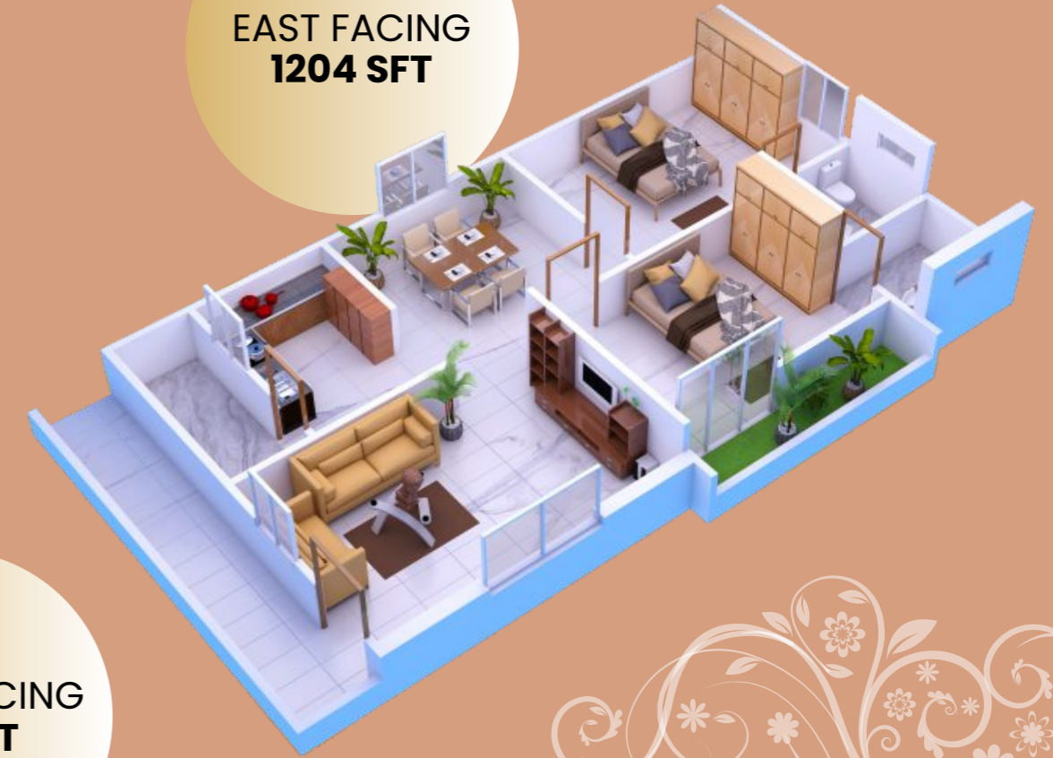
EAST FACING 1204 SFT