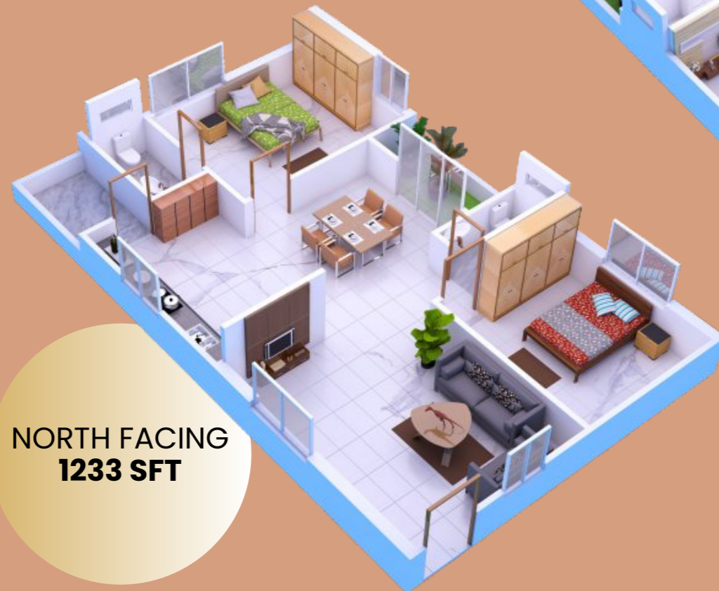
NORTH FACING 1233 SFT