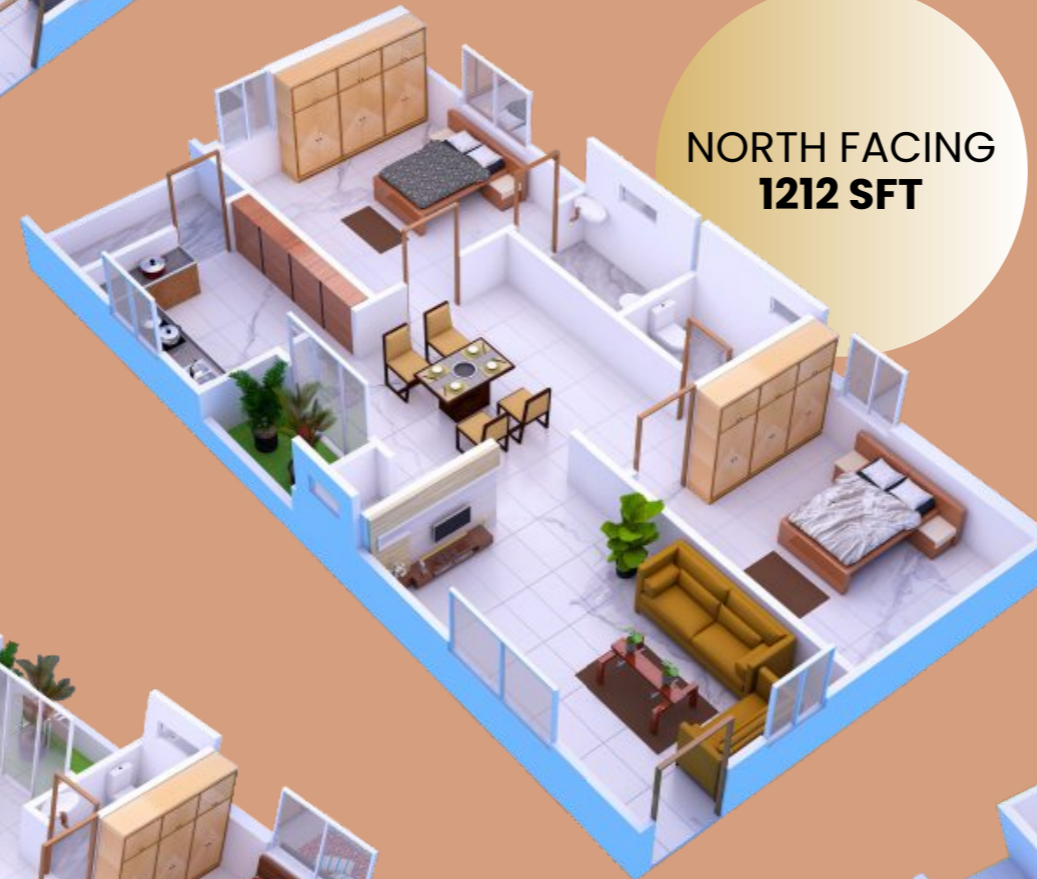
NORTH FACING 1212 SFT