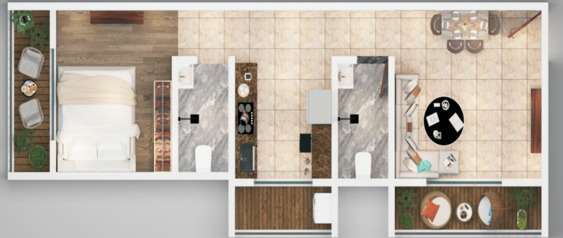
PRESTIGE GOLD SPACIOUS 1 BHK FLOOR PLAN