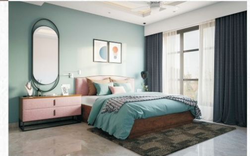
Branded vitrified Flooring In Entire flat & Power Powder coated Aluminium french windows