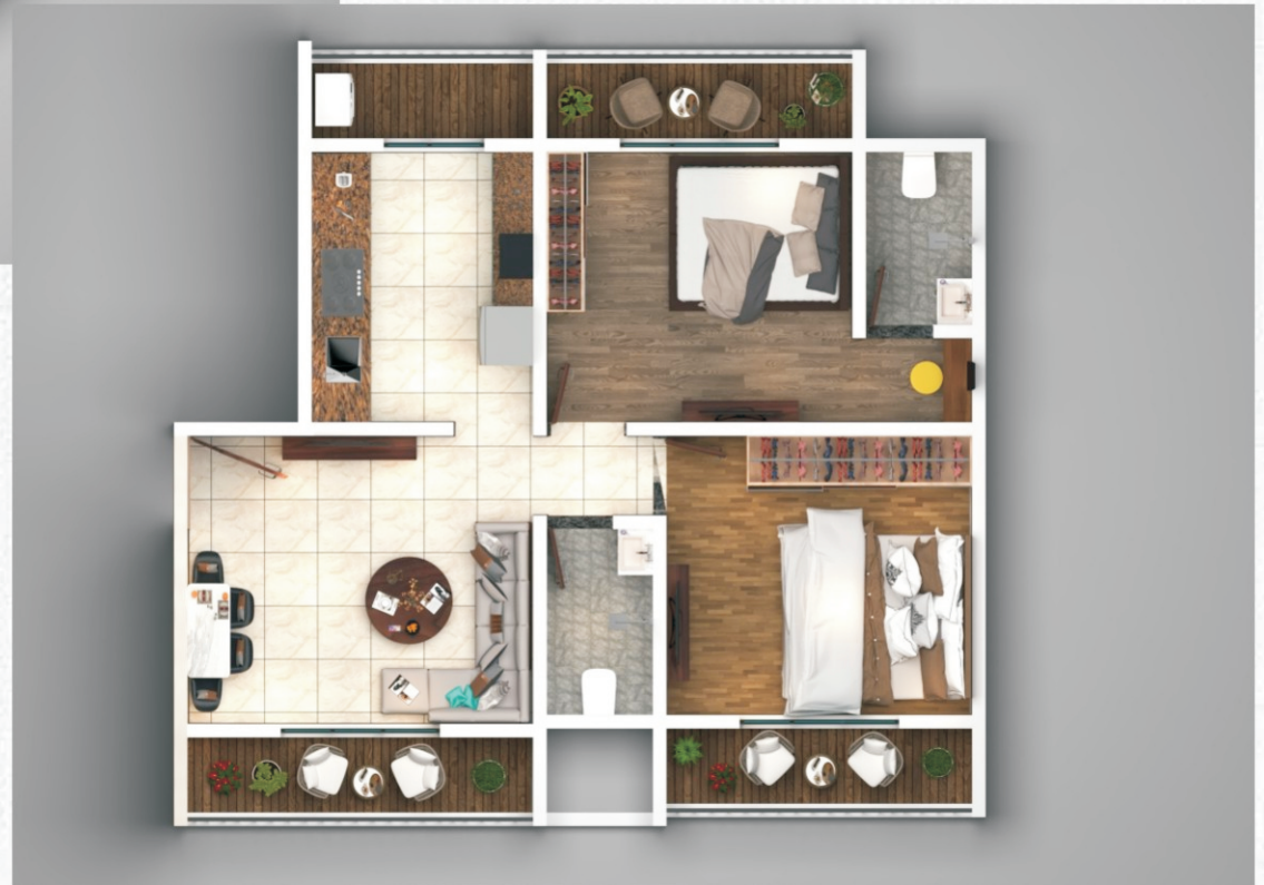
PRESTIGE GOLD SPACIOUS 2 BHK FLOOR PLAN