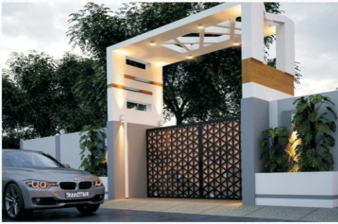
Decorative Entrance Gate