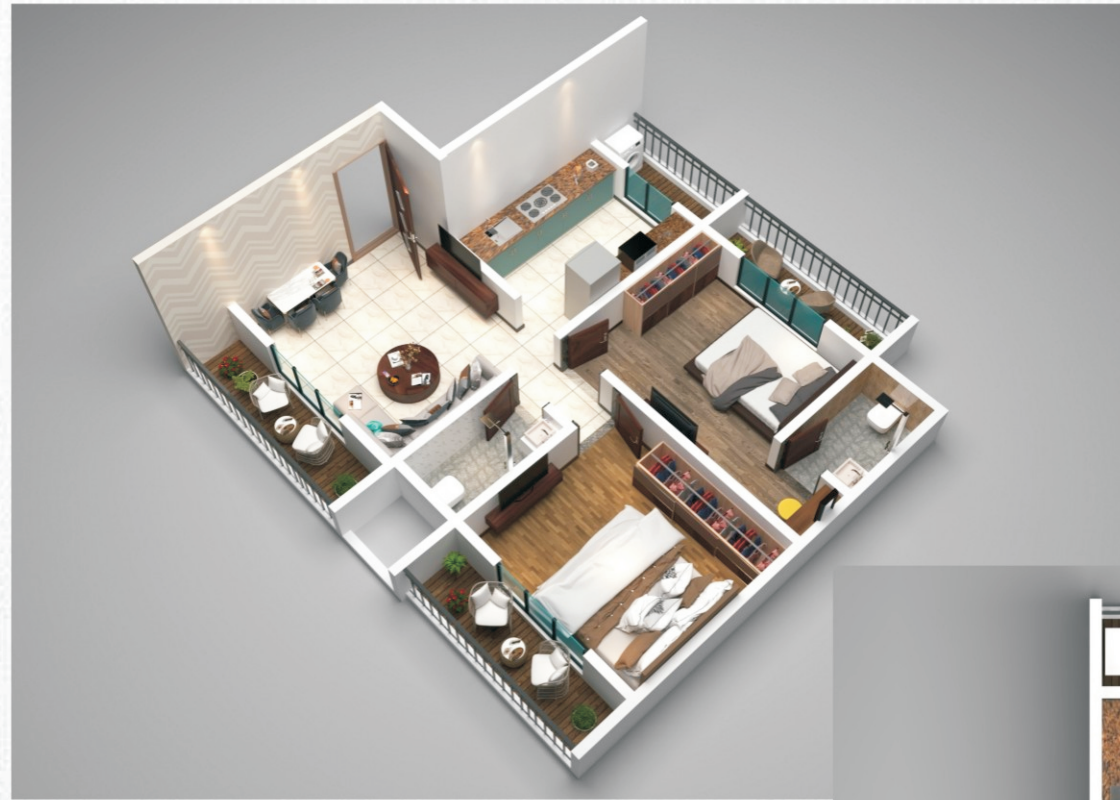
PRESTIGE GOLD SPACIOUS 2 BHK 3D VIEW