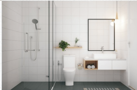
Designer bathroom with Branded Fittings