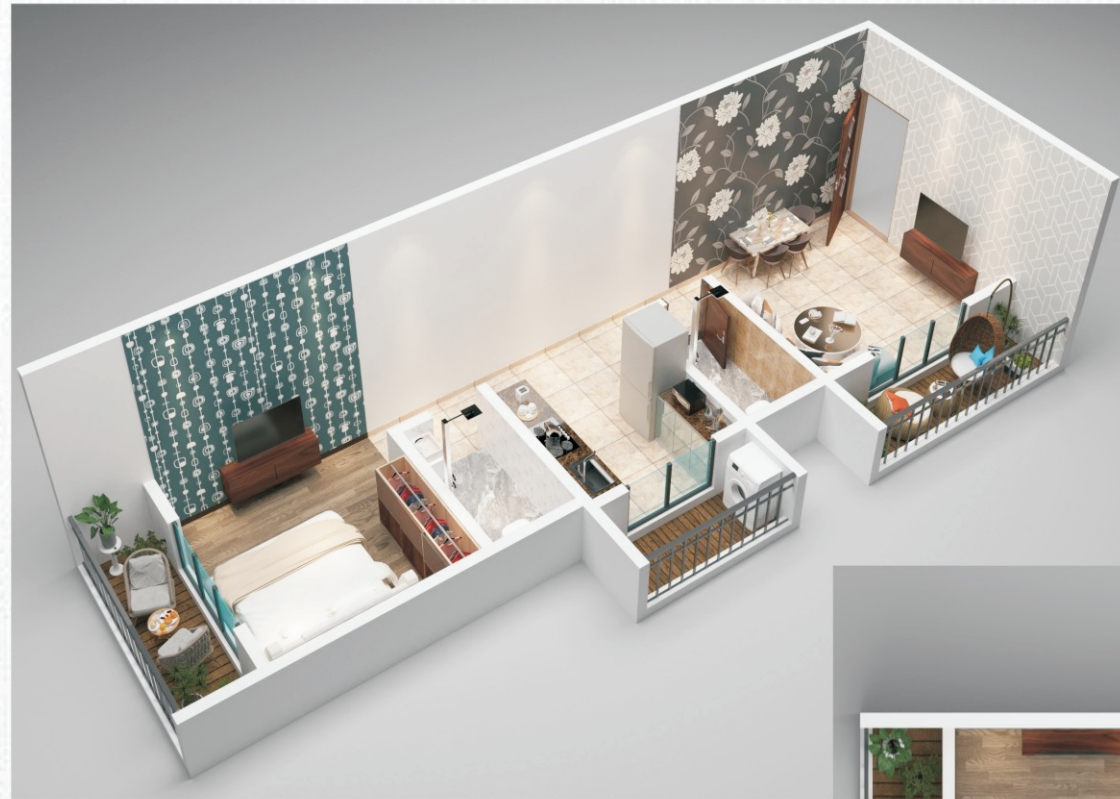
PRESTIGE GOLD SPACIOUS 1 BHK 3D VIEW