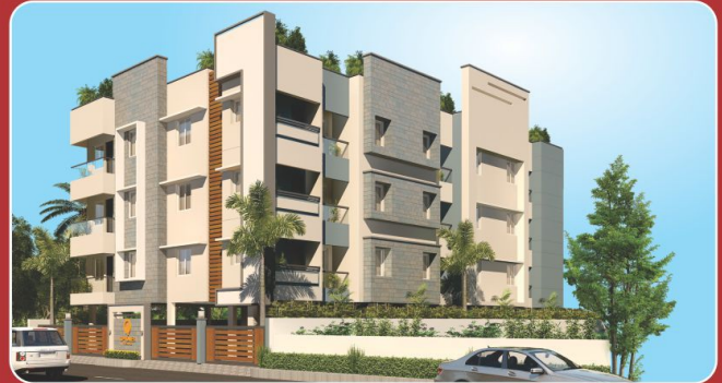
GP Imperial Korattur (North)