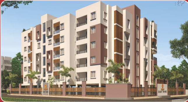
GP East Wind Padur-OMR