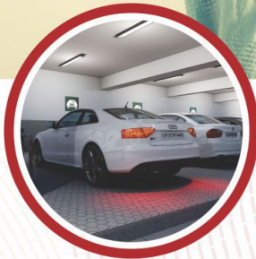
Covered Car Parking