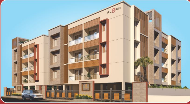
GP Flora - Ruby & Emerald Porur Garden