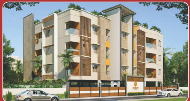
GP Peach Blossom Korattur (North)