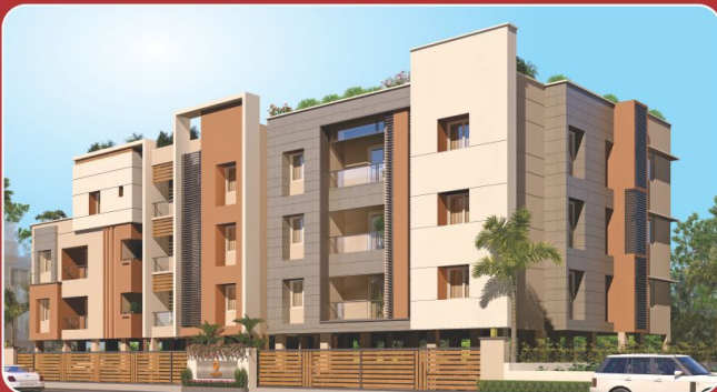
GP Fern Breeze Ambattur