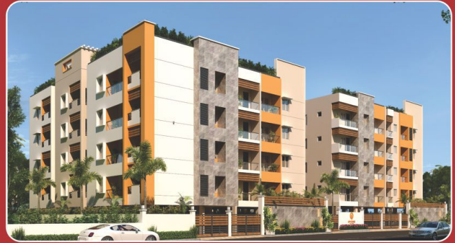
GP Valencia - Diamond Ayanambakkam