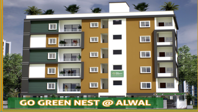
GO GREEN NEST @ ALWAL