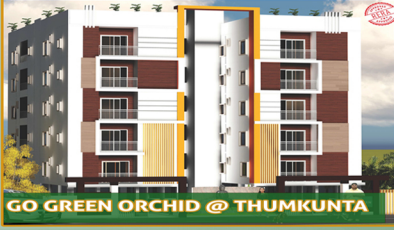
GO GREEN ORCHID @ THUMKUNTA