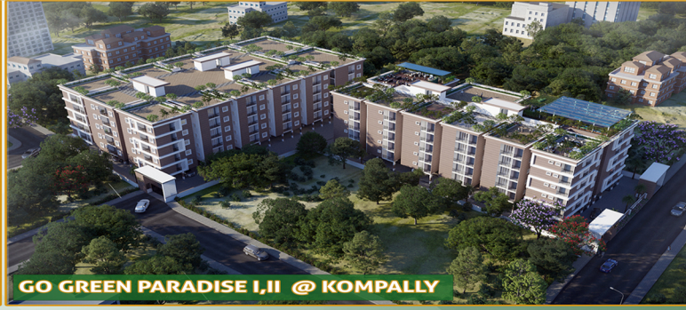
GO GREEN PARADISE I, II @ KOMPALLY