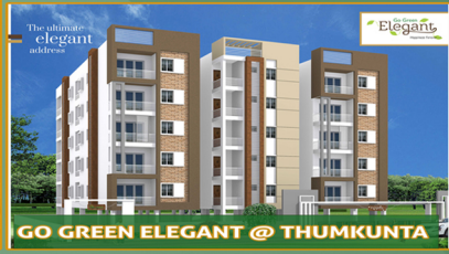
GO GREEN ELEGANT @ THUMKUNTA