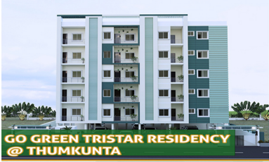
GO GREEN TRISTAR RESIDENCY @ THUMKUNTA