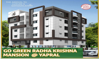
GO GREEN RADHA KRISHNA MANSION @ YAPRAL