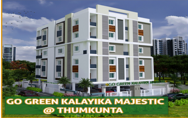
GO GREEN KALAYIKA MAJESTIC @ THUMKUNTA