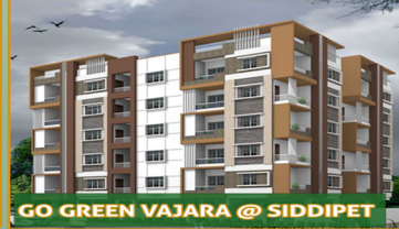
GO GREEN VAJARA @ SIDDIPET