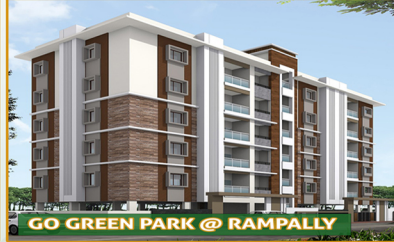
GO GREEN PARK @ RAMPALLY