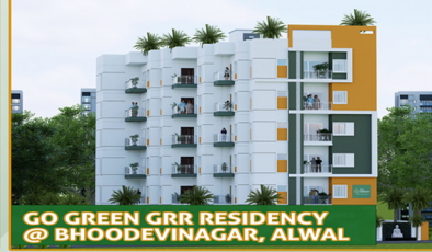
GO GREEN GRR RESIDENCY @ BHOODEVINAGAR, ALWAL