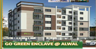
GO GREEN ENCLAVE @ ALWAL