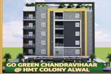
GO GREEN CHANDRAVIHAAR @ HMT COLONY ALWAL