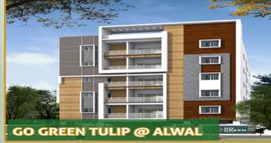
GO GREEN TULIP @ ALWAL