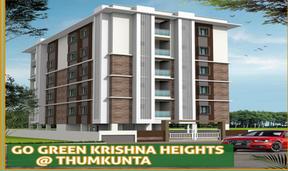
GO GREEN KRISHNA HEIGHTS @ THUMKUNTA