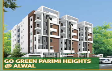
GO GREEN PARIMI HEIGHTS @ ALWAL