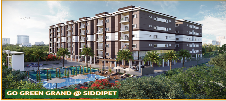
GO GREEN GRAND @ SIDDIPET