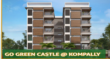
GO GREEN CASTLE @ KOMPALLY