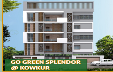
GO GREEN SPLENDOR @ KOWKUR