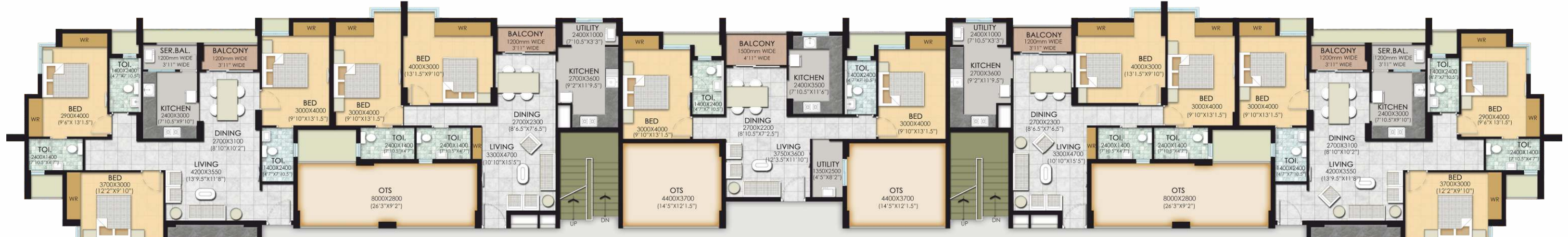
UNIT - 05 3BHK - 1408 sq.ft.