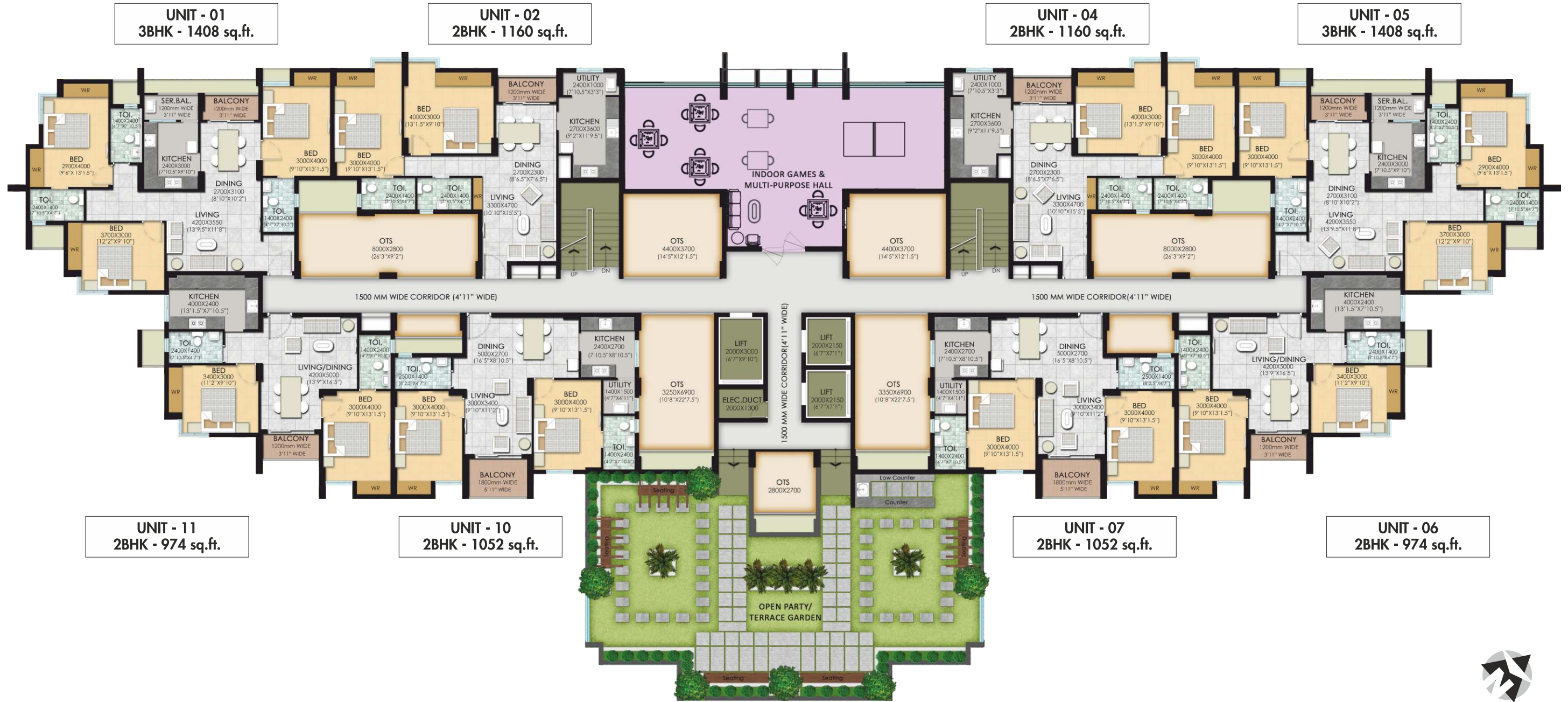
UNIT - 01 3BHK - 1408 sq.ft.