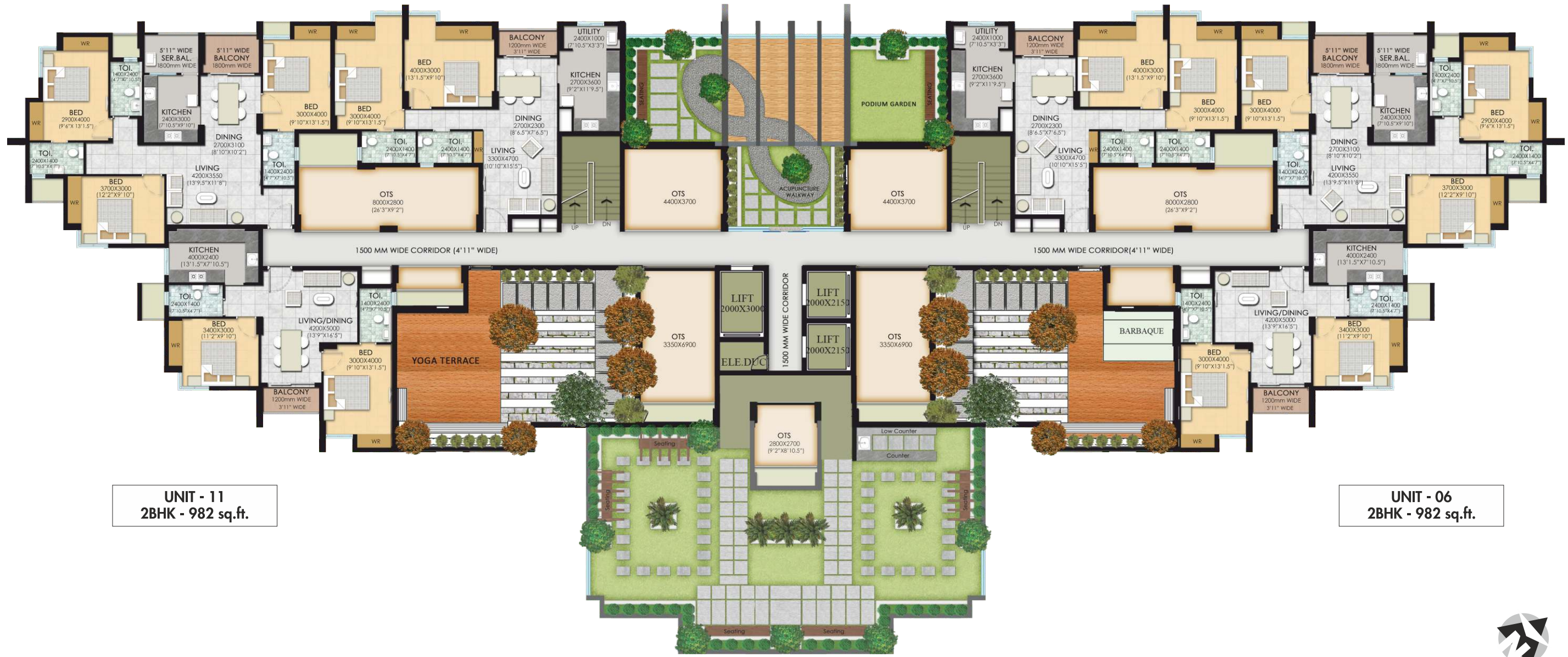
UNIT - 11 2BHK - 982 sq.ft.