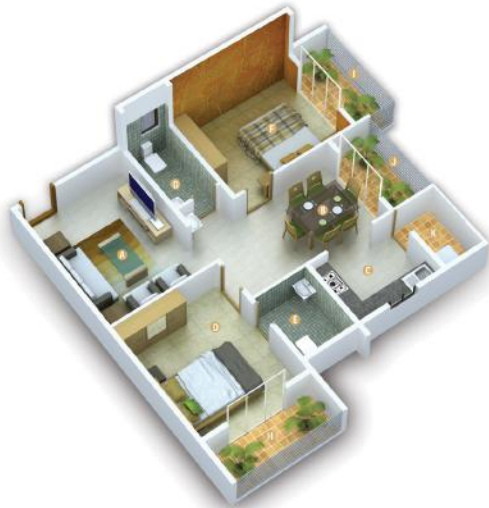
UNIT # 109, 209 & 309 SBA-1273 SFT RERA-807 SFT NORTH FACING 2 BHK