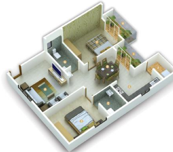
UNIT # 111, 211 & 311 SBA-1369 SFT RERA-890 SFT EAST FACING 2 BHK