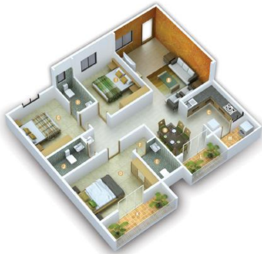
UNIT # 108, 208 & 308 SBA-1632 SFT RERA-1138 SFT NORTH FACING 3 BHK