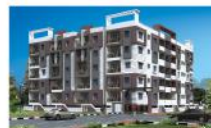
NAVA ATHITHI GRAND