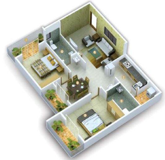
UNIT # 112, 212 & 312 SBA-1281 SFT RERA-863 SFT NORTH FACING 2 BHK