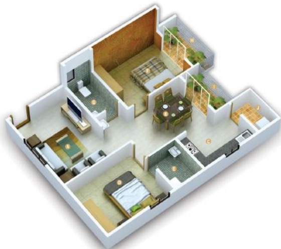
UNIT # 110, 210 & 310 SBA-1257 SFT RERA-844 SFT NORTH FACING 2 BHK