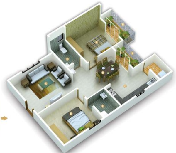
UNIT # 114, 214 & 314 SBA-1300 SFT RERA-902 SFT WEST FACING 2 BHK