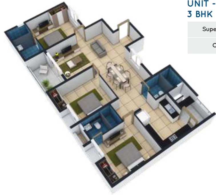
UNIT - A304 3 BHK - NORTH FACING