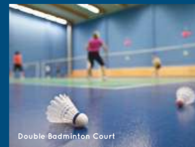
Double Badminton Court