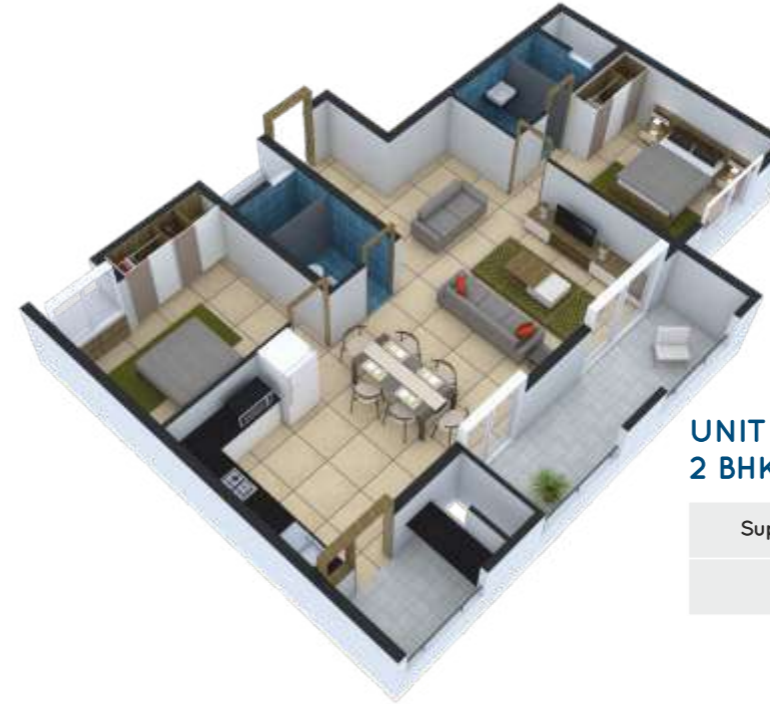
UNIT - A301 2 BHK - EAST FACING