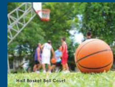
Half Basket Ball Court