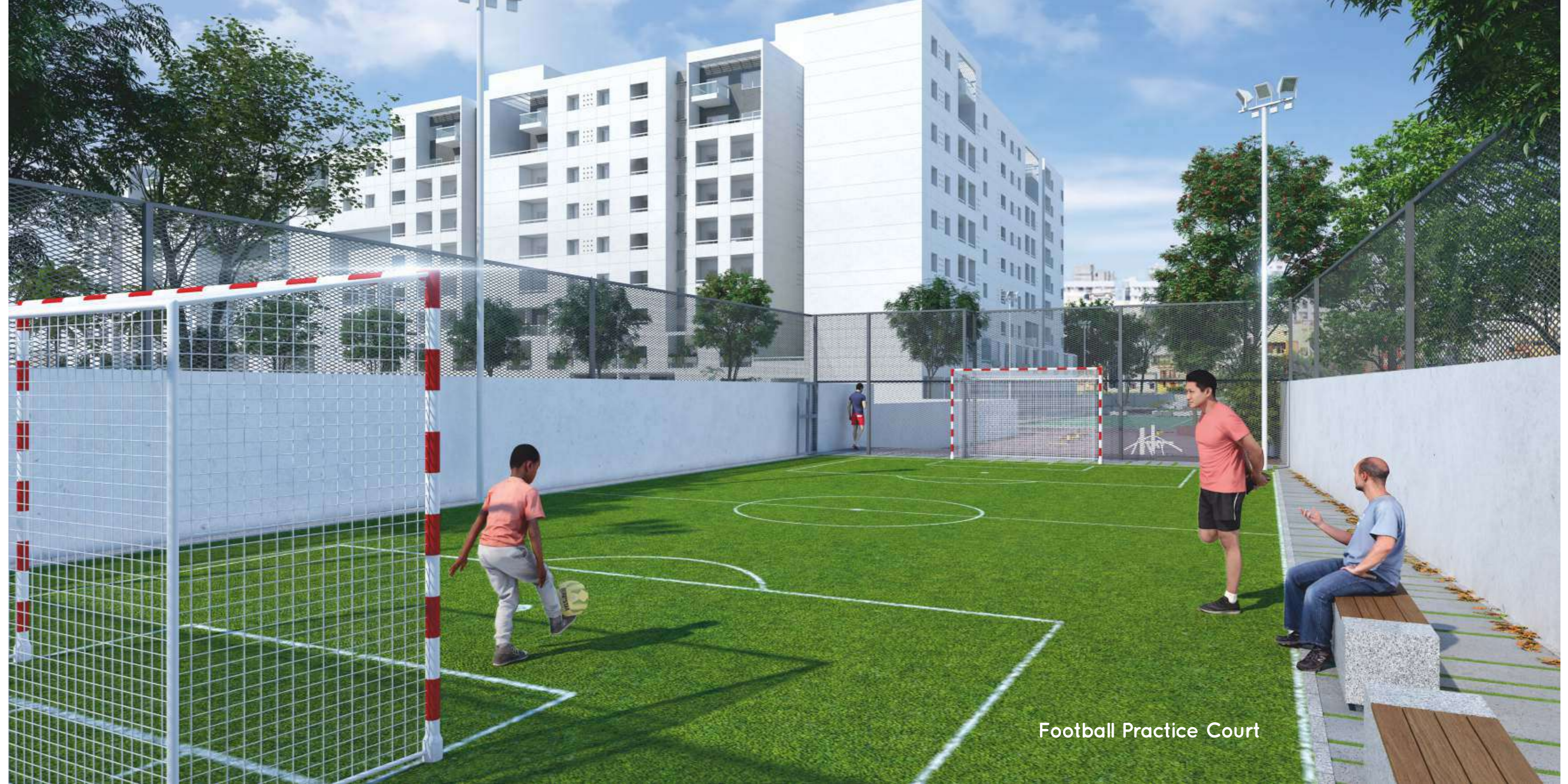
Football Practice Court