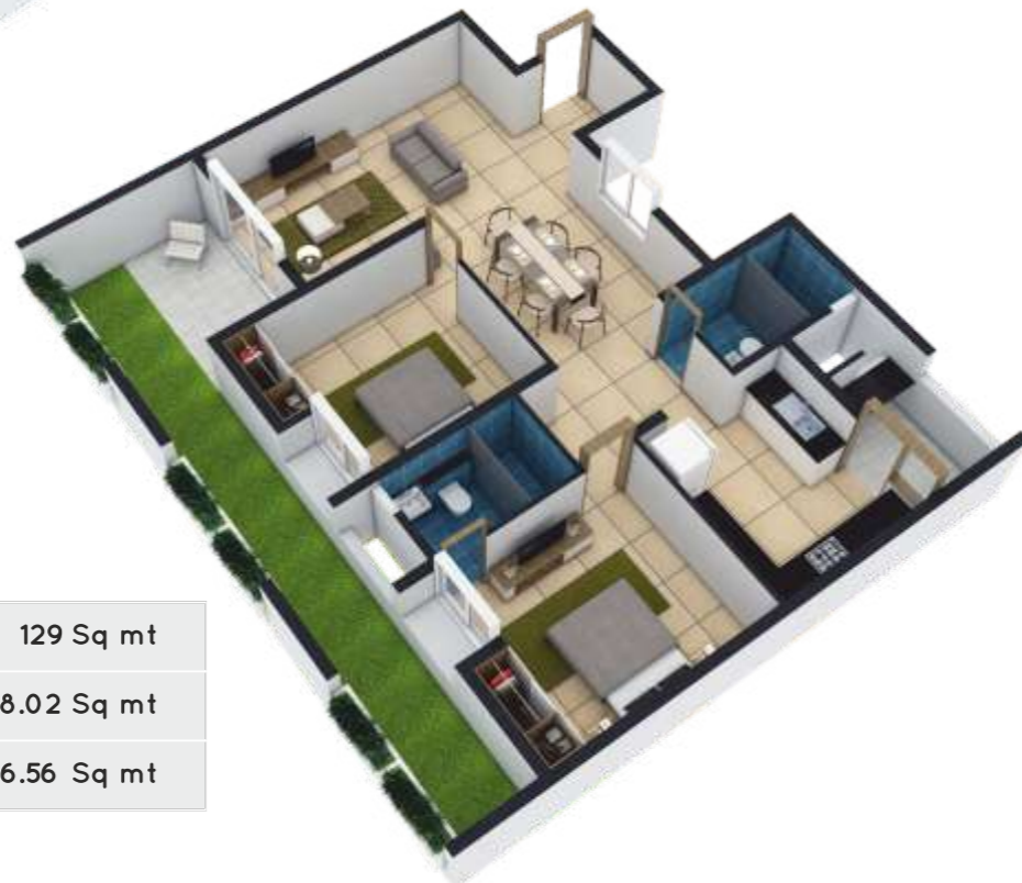
UNIT - A104 2 BHK - NORTH FACING