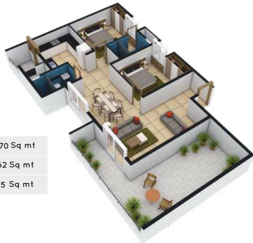
UNIT - A703 2 BHK - NORTH FACING