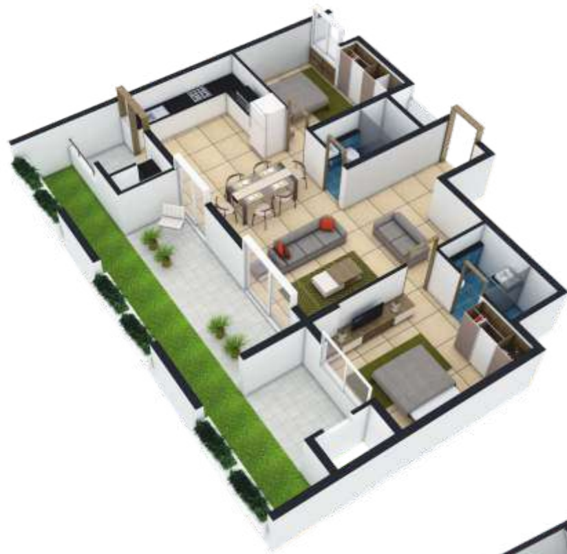
UNIT - A101 2 BHK - EAST FACING