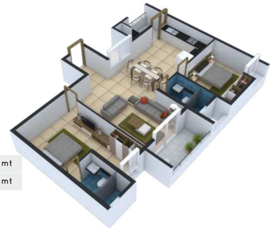
UNIT - A302 2 BHK - WEST FACING