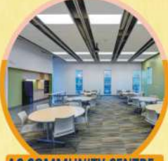
AC COMMUNITY CENTRE