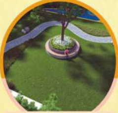
LUSH GREEN PARKS