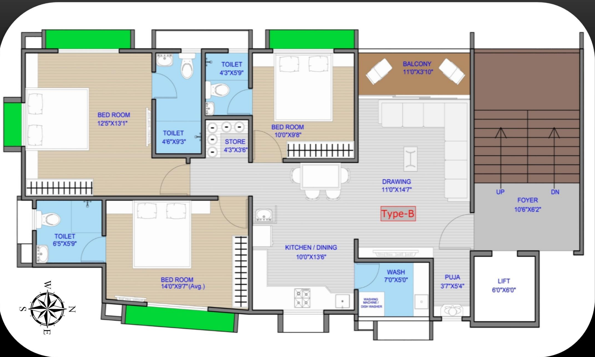
102 TO 502 TYPICAL UNIT PLAN_TYPE-B