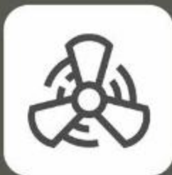
3 Side Open Air Vantiled