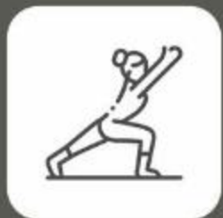
Yoga Space/ Aerobics Space