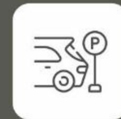
Sufficient Car Parking