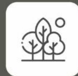
Beautiful Garden & landscape