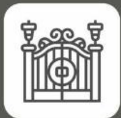
Entrance Gate with Security Cabin