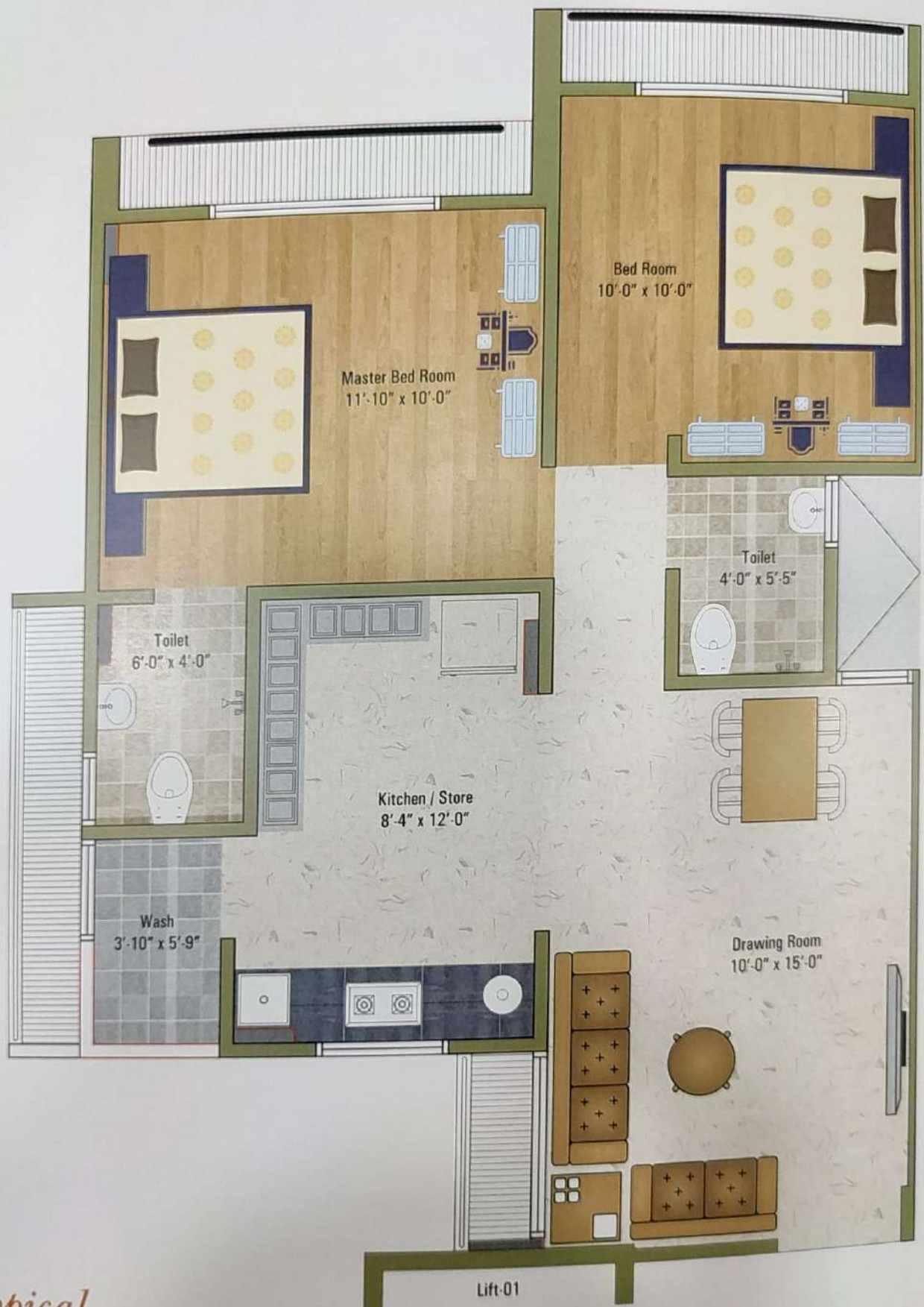
typical layout plan